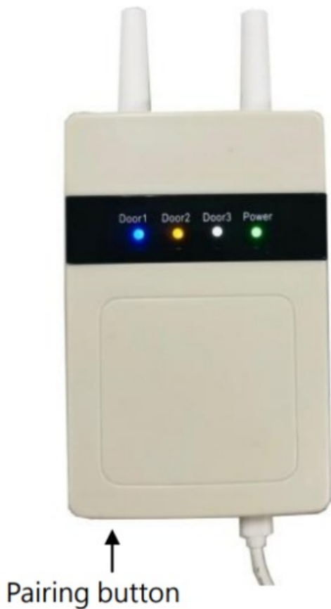
• Fig2. ATTIIOTSWLS Wireless Sensor