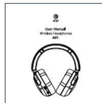
1 x user manual