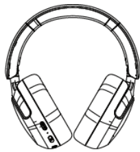
1 x wireless headphones