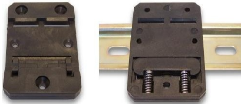
Figure 2-3: DPK-DIN-CLIP