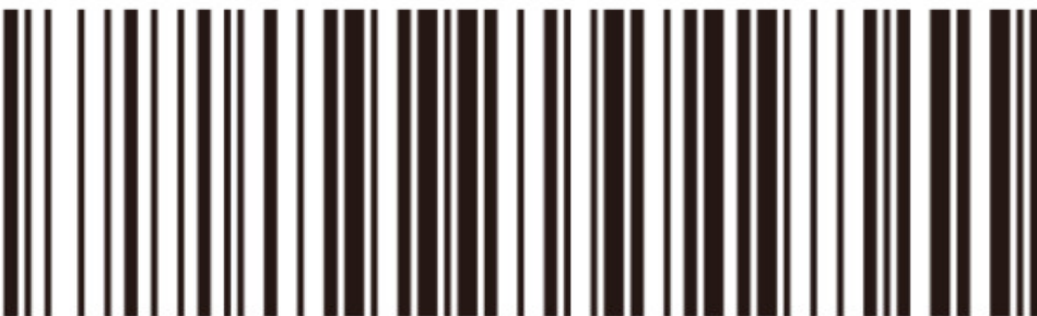
Upload all data