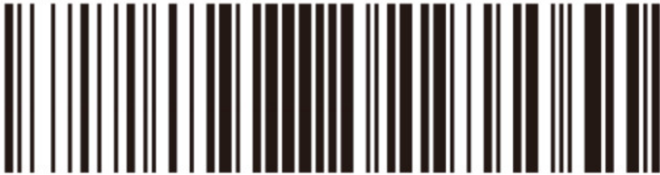
Real-time upload mode