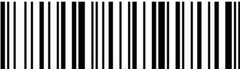
BLE serial port mode