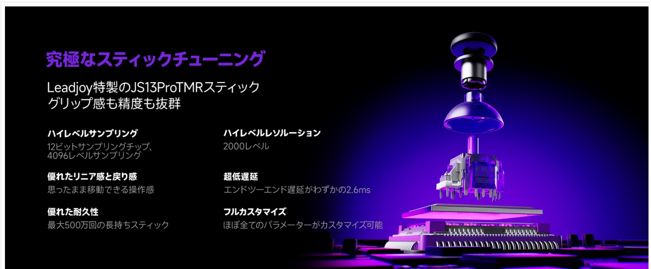
Image: Exploded view of the joystick mechanism, highlighting features like high-precision sampling, enhanced resolution, superior linearity, ultra-low latency, durability, and full customization.

resolution for finer control. The ultra-low latency ensures responsive, true-to-input movement.