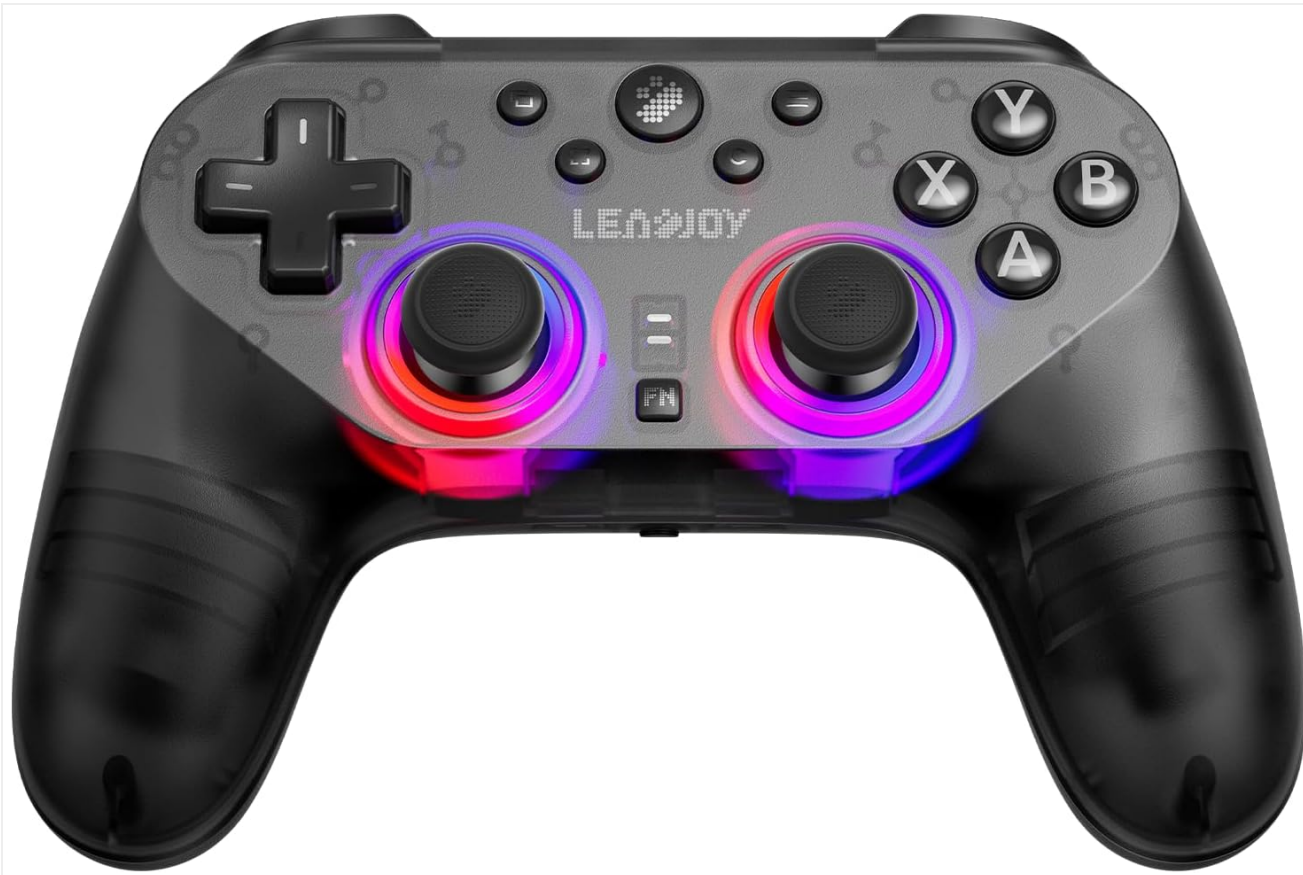
Image: The Leadjoy Saber Plus Game Controller in black, showcasing its ergonomic design and button layout.