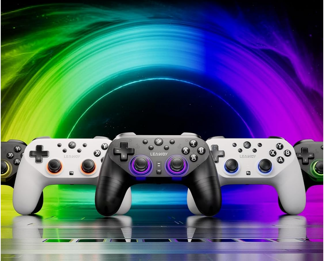
Image: Multiple Leadjoy Saber Plus controllers with vibrant RGB lighting, demonstrating the customizable ambient effects.

24 High-Bright LEDs | 5 Dynamic Light Modes, 16.7M Full Colors Smart APP Control: Customize color, brightness & light speed with one tap