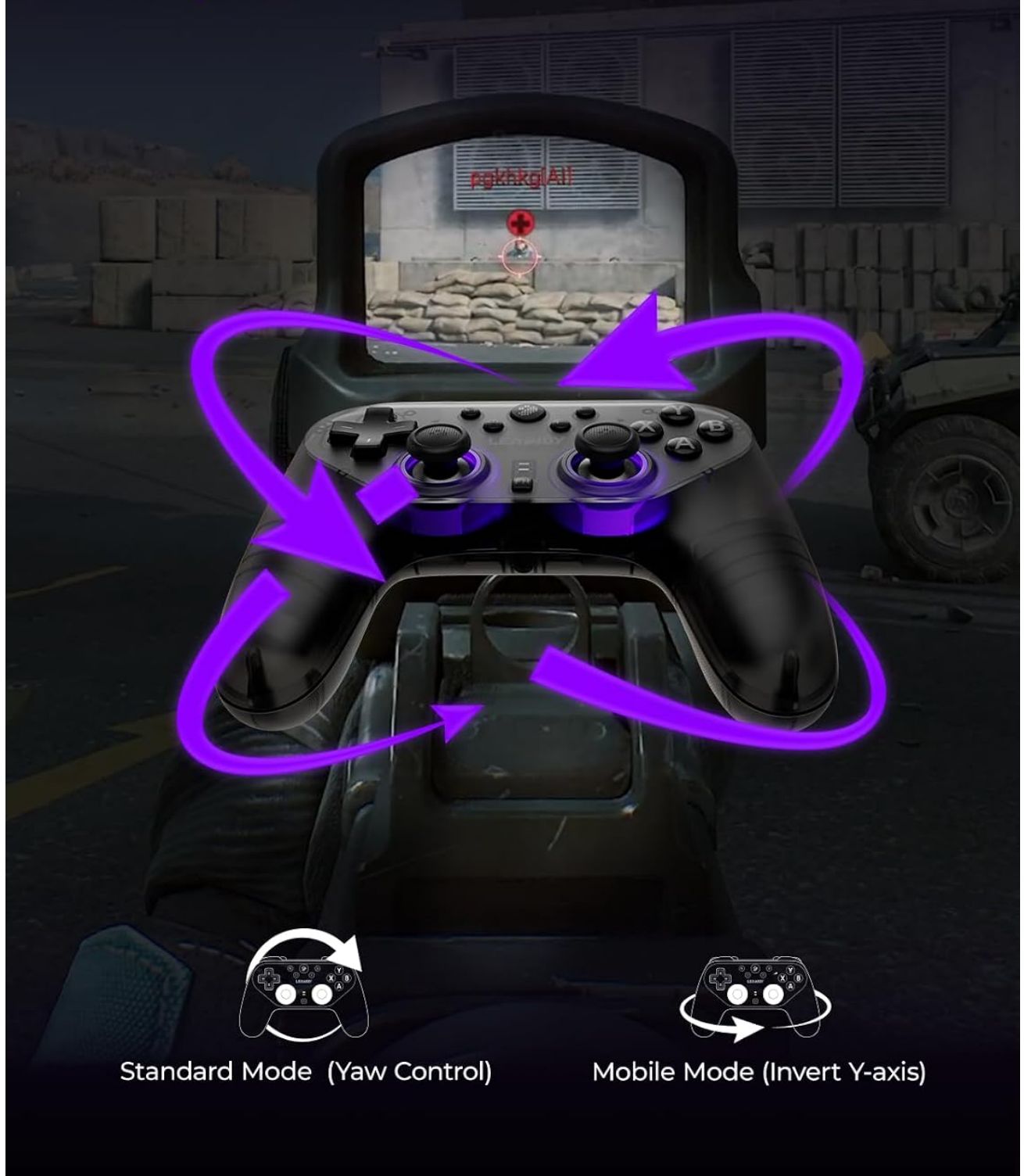
Image: A first-person shooter perspective showing the controller being used with motion controls, indicated by purple arrows.