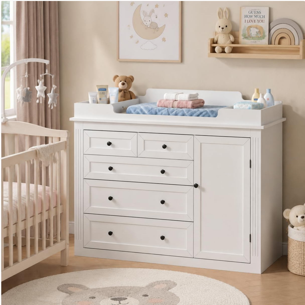
Figure 5.1: Organized Changing Station. This image demonstrates how the divided top tray keeps essential baby care items neatly organized and accessible during diaper changes.