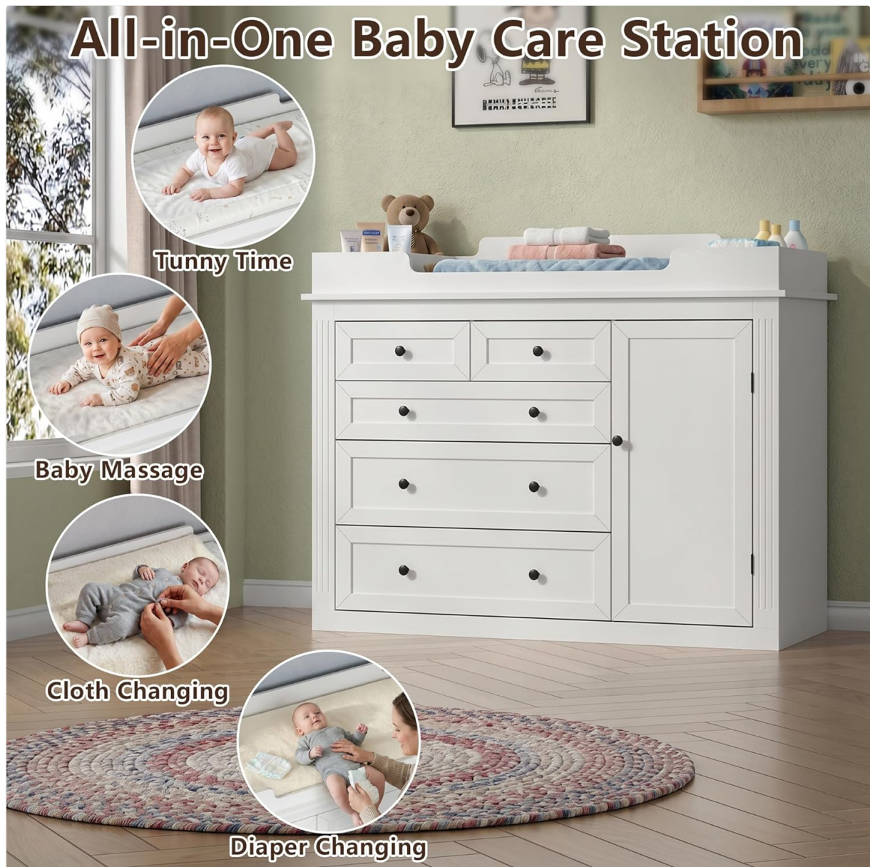
Figure 5.3: Ergonomic Height Benefit. This visual comparison demonstrates how the dresser's height allows for a more comfortable posture during baby care, reducing back strain compared to bending over a crib.