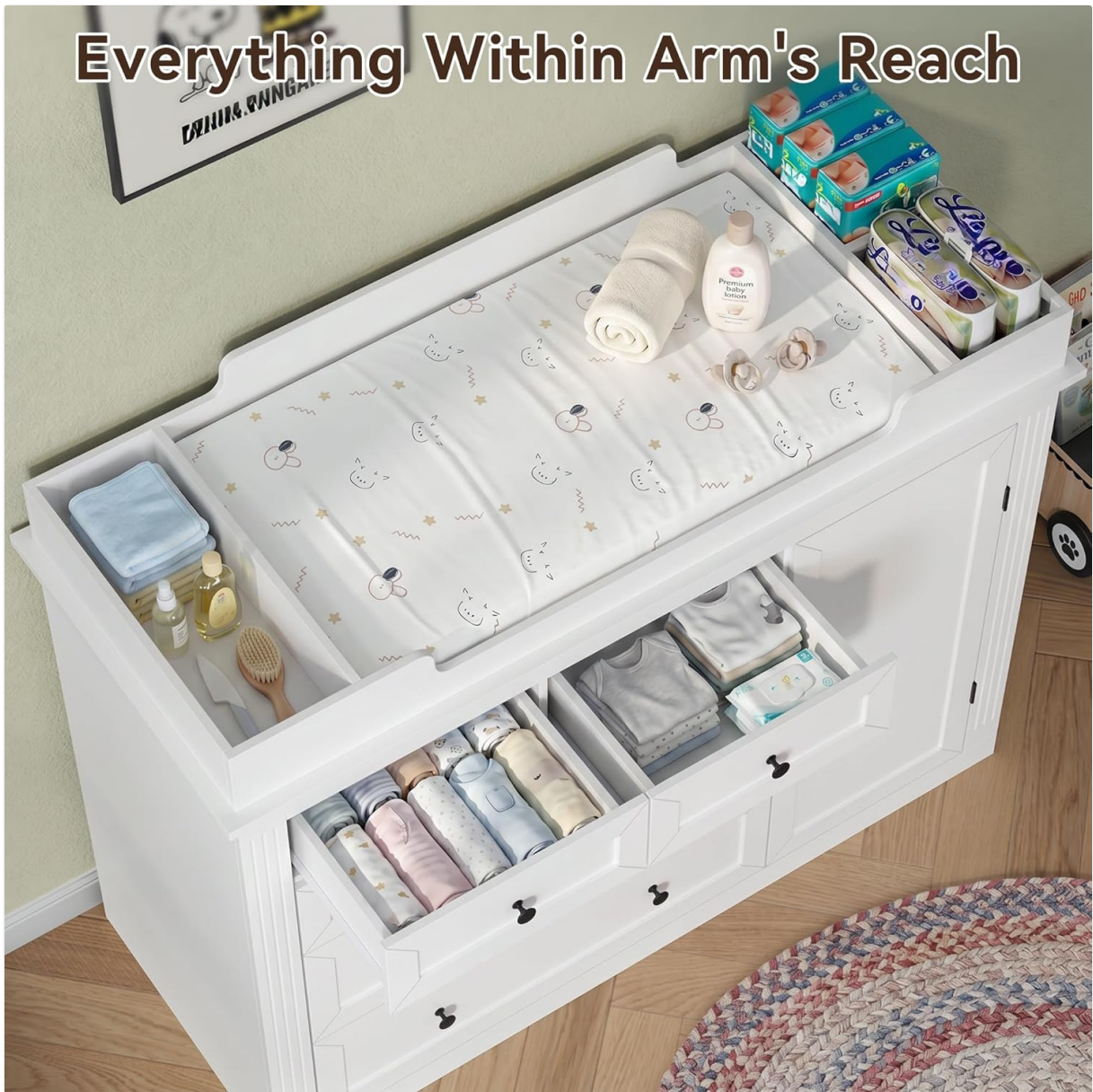
Figure 5.4: All-in-One Baby Care Station. This image illustrates the versatility of the dresser, showing it can be used for various activities beyond just diaper changing, such as tummy time and baby massage.

Your browser does not support the video tag.