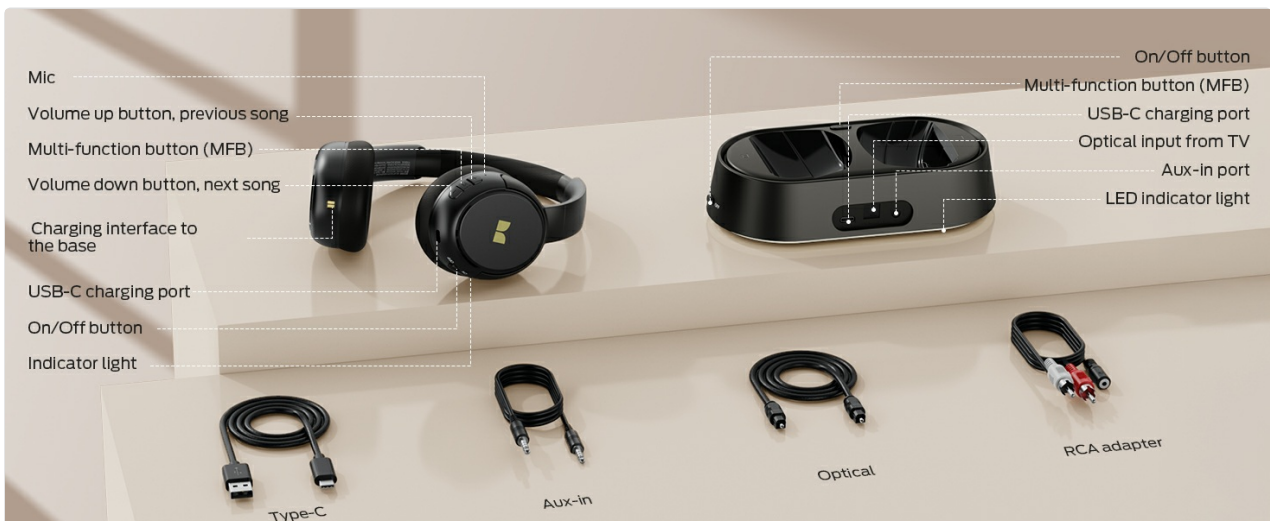
Image: Labeled diagram of the headphones and transmitter base, indicating buttons, ports, and indicator lights.

Familiarize yourself with the main components and controls of your Monster TVLink 300 headphones and transmitter base.