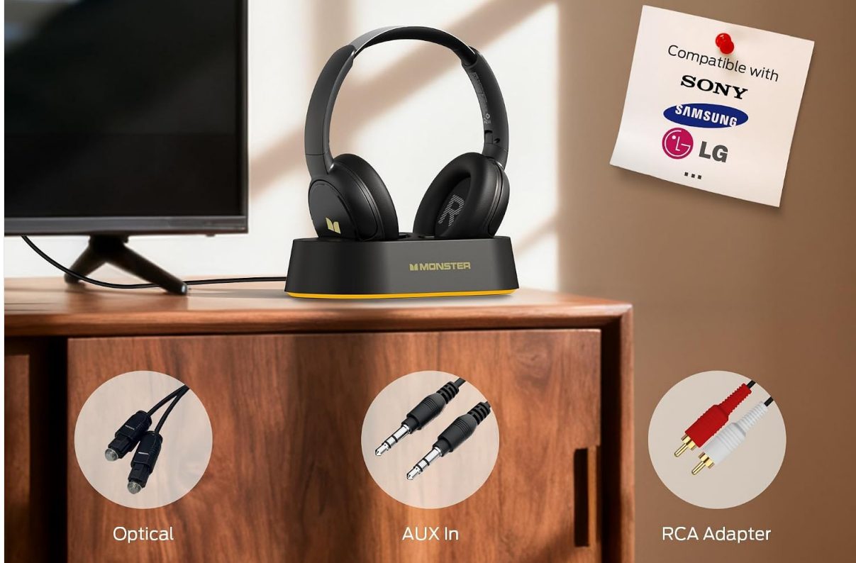
Image: Flexible connection options for the transmitter base, including Optical, AUX, and RCA.

Three ways to link the headphones to TV, choose freely what fits best.