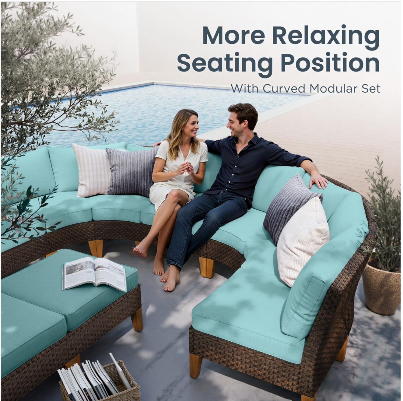
Image: An assembled PHI VILLA Half Moon Patio Furniture Set by a pool, demonstrating the curved modular configuration and comfortable seating. This image illustrates the final setup of the furniture.