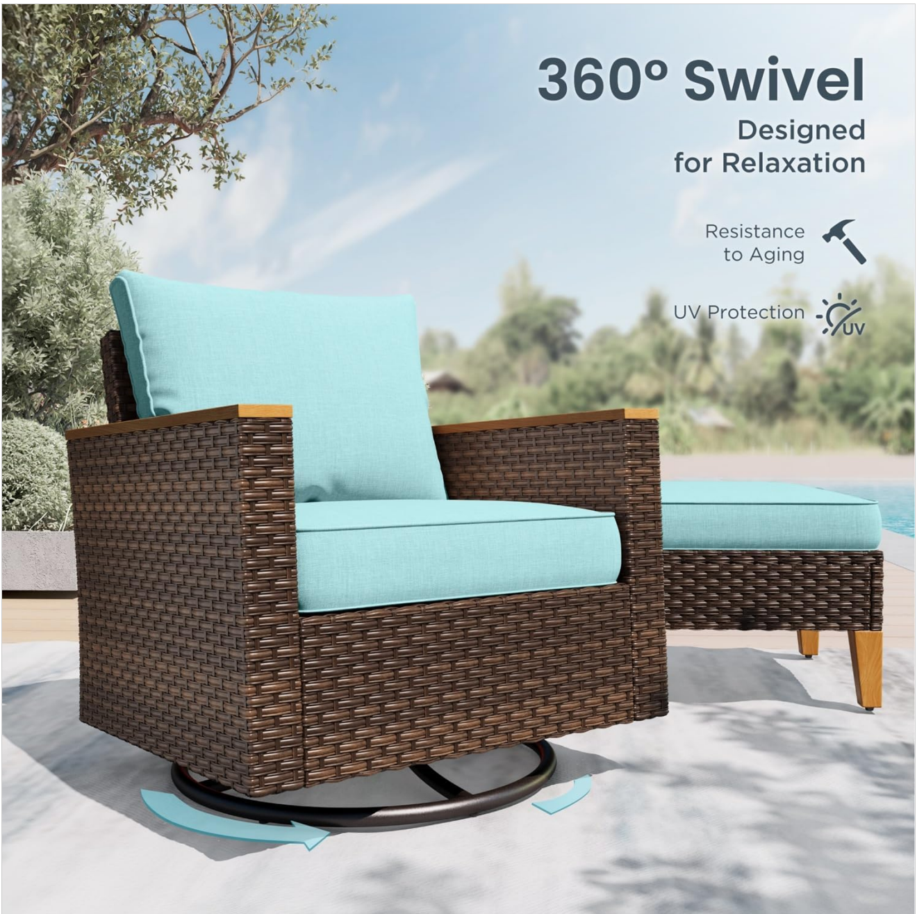
Image: A PHI VILLA swivel chair with an aqua blue cushion, highlighting its 360-degree rotation capability and the durable wicker construction. This image demonstrates the swivel feature.