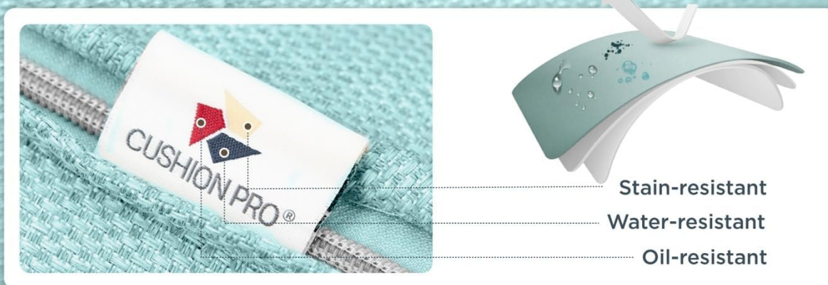
Image: An illustration of PHI VILLA's Cushion Pro Technology, showing water beads on the aqua blue fabric, indicating its water, oil, and stain resistance. This image demonstrates the protective features of the cushions.

Your browser does not support the video tag.