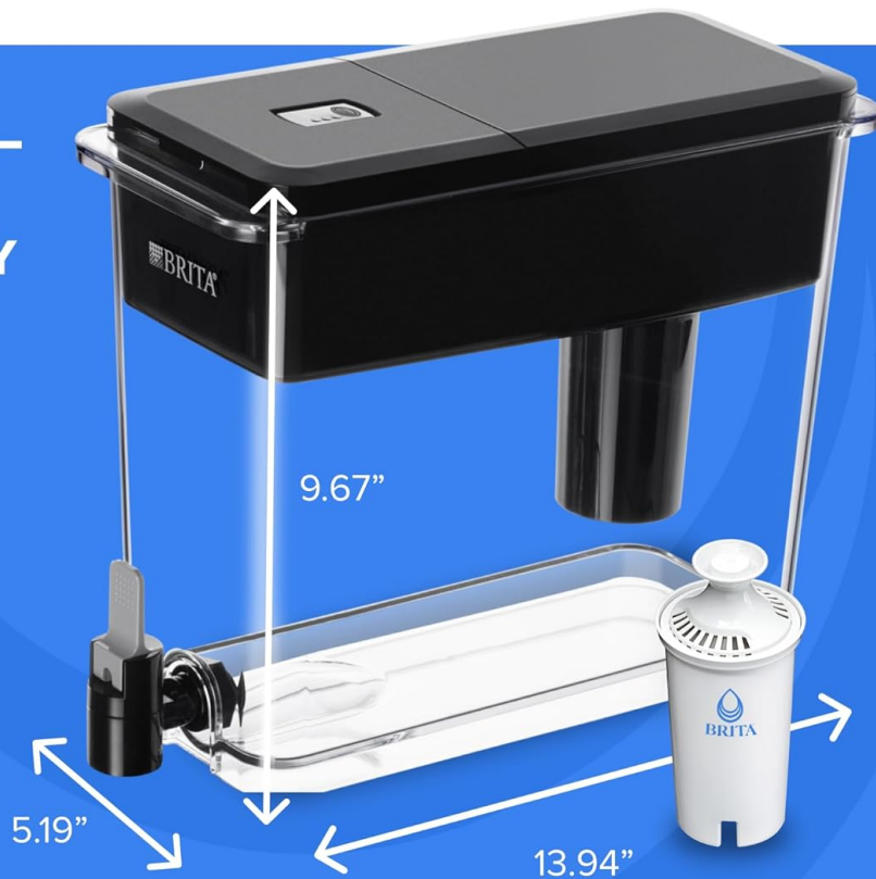
Image: A diagram illustrating the key dimensions (length, width, height) of the Brita UltraMax Water Filter Dispenser and its filter for reference.