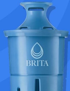
Image: A close-up of a Brita water filter, featuring the Water Quality Association (WQA) certification seal, indicating its tested and certified performance.