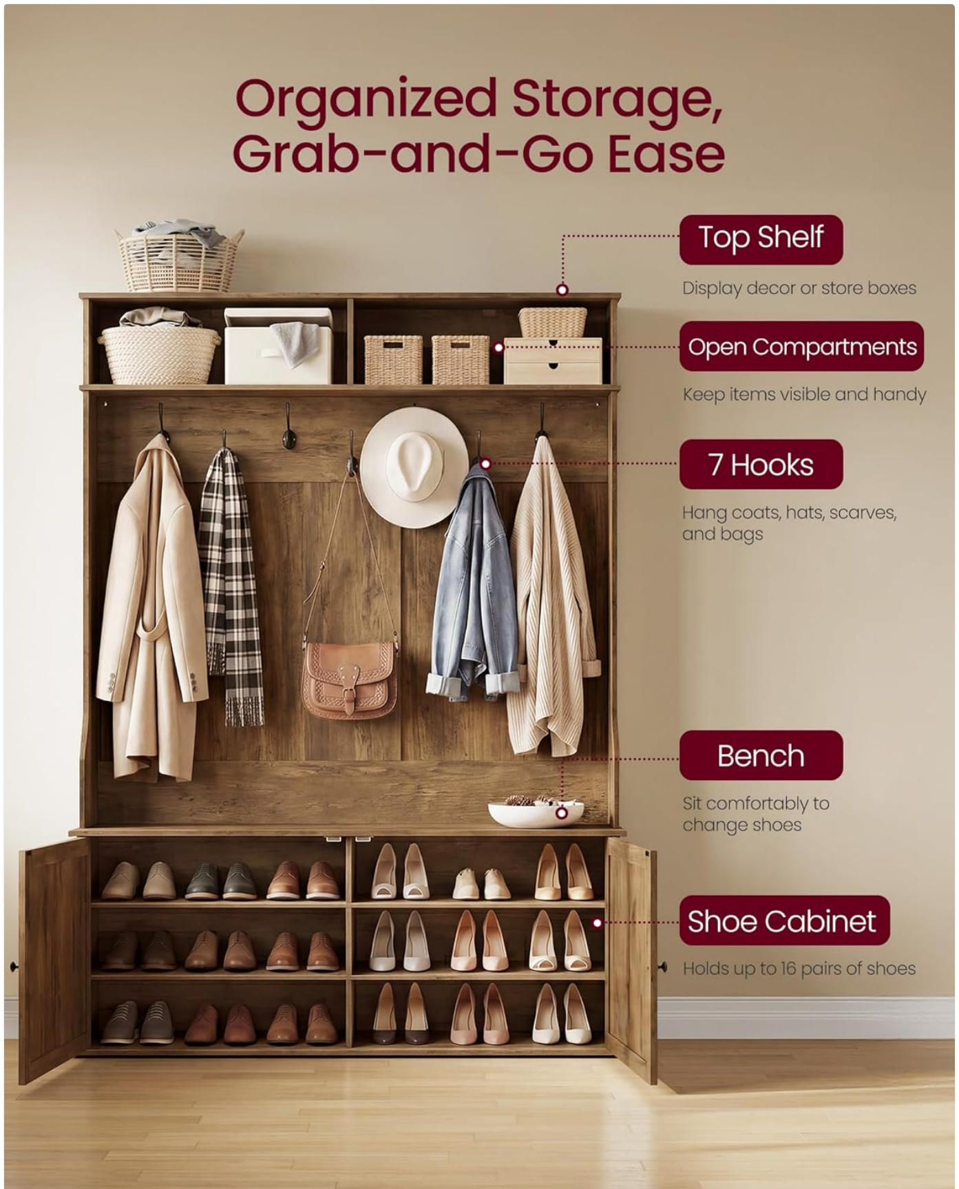
Image: A diagram illustrating the various components of the hall tree, including the top shelf, open compartments, hooks, bench, and shoe cabinet.