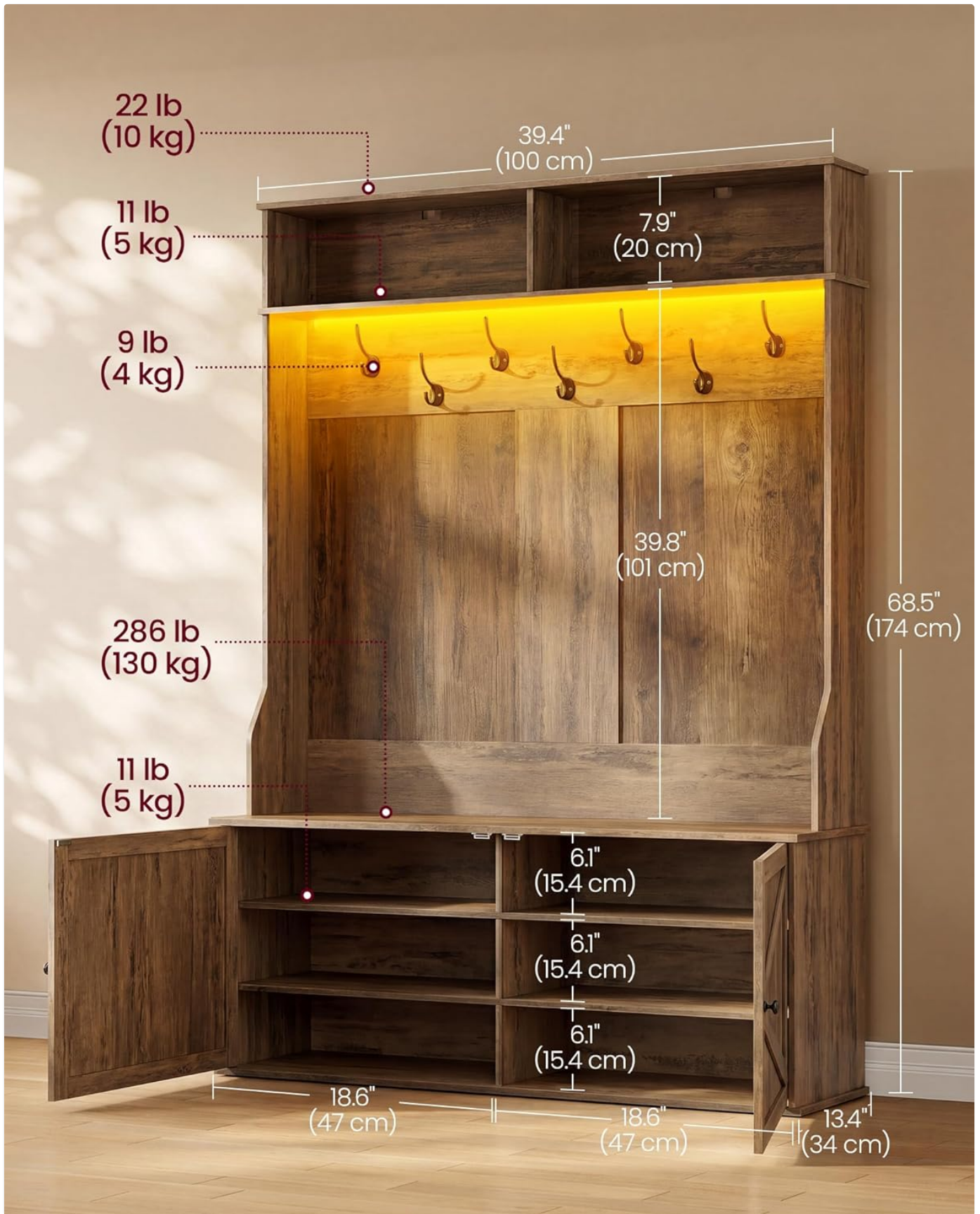
Image: A detailed diagram displaying the dimensions (depth, width, height) and individual weight capacities for the top shelf, open compartments, and hooks of the hall tree.