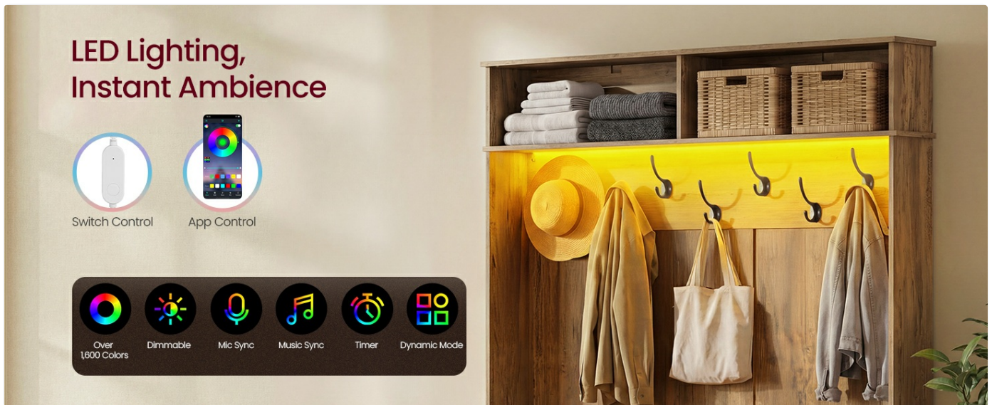
Image: The hall tree's LED lighting in operation, highlighting both the physical switch control and the mobile app interface for adjusting colors and modes.

to over 1,600 colors and 28 dynamic lighting modes, including dimming, mic sync, music sync, and timer functions.