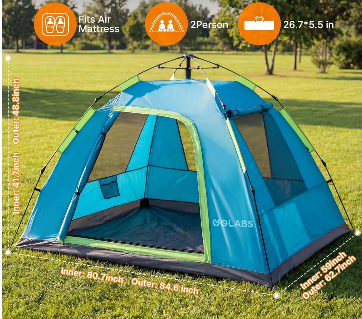
Figure 7.1: Detailed dimensions of the 2-person GOLABS CT3 Instant Camping Tent.