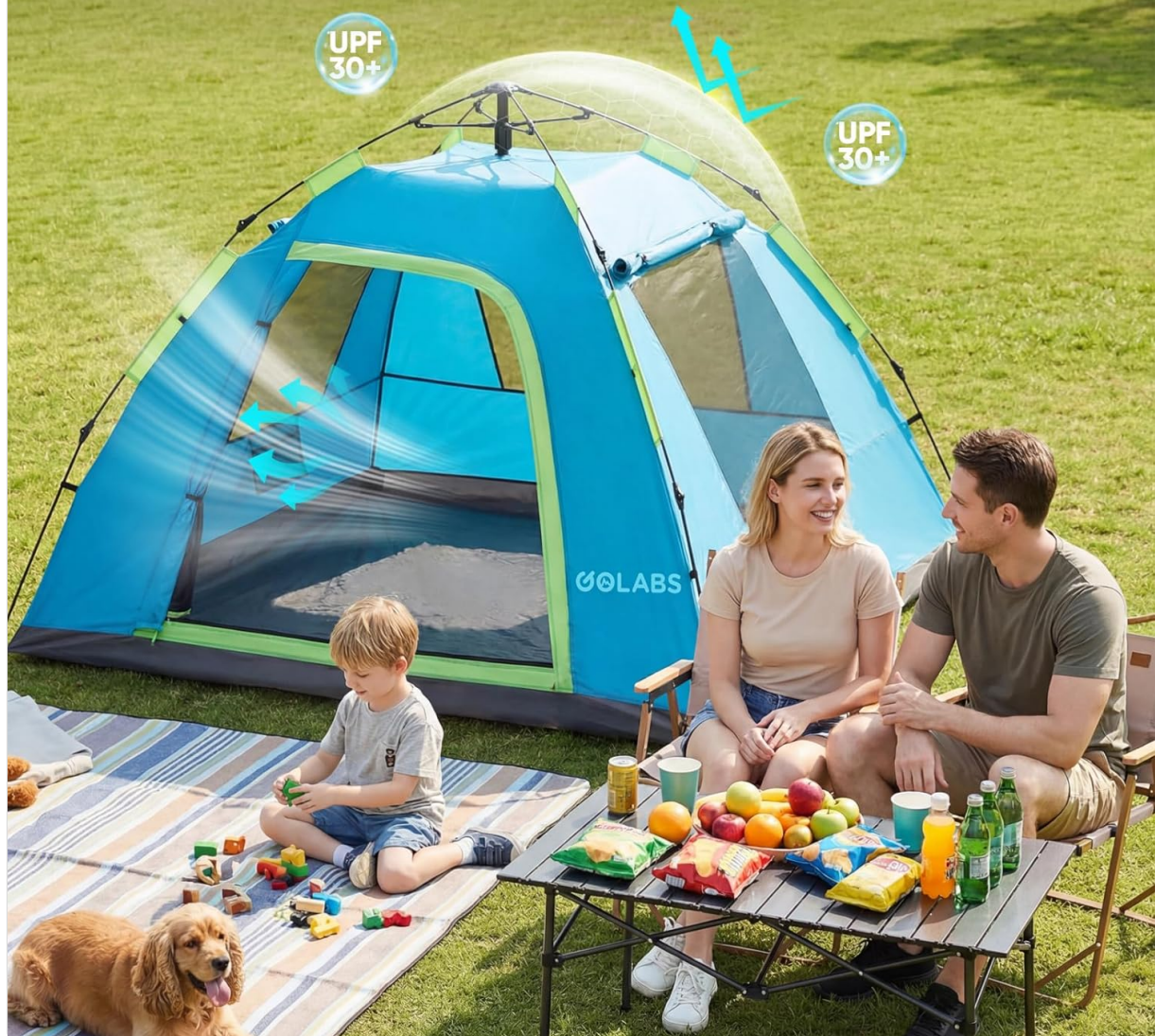
Figure 4.1: Illustration of the tent's ventilation system with mesh windows and door.