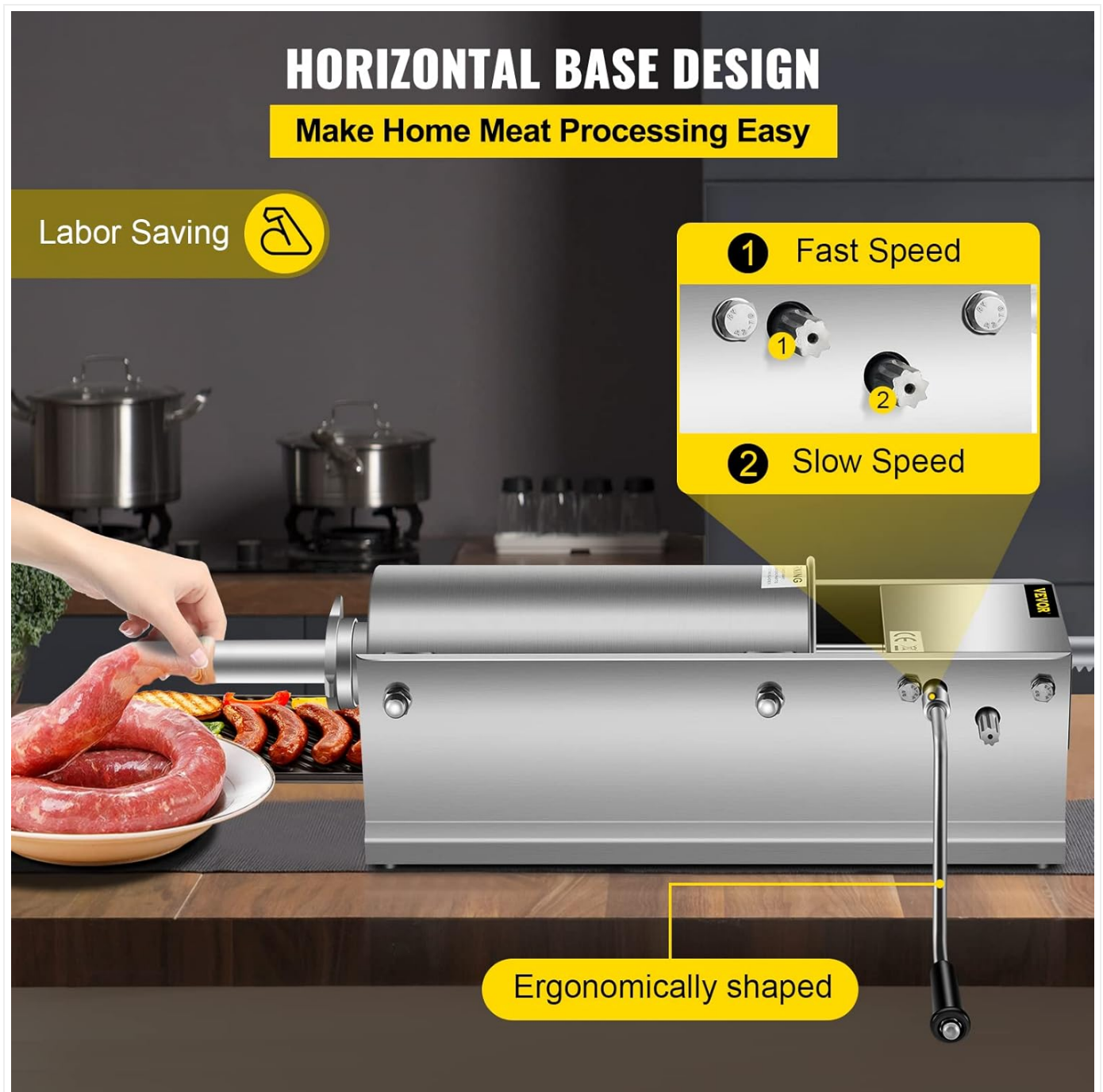
Image: The VEVOR 5L Horizontal Manual Sausage Stuffer demonstrating its horizontal design, ergonomic handle, and dual-speed settings (Fast Speed and Slow Speed) for efficient and controlled operation.