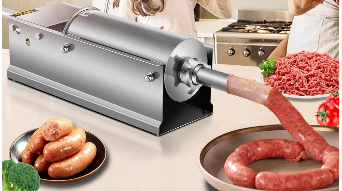
Image: The VEVOR 5L Horizontal Manual Sausage Stuffer in operation, demonstrating its use for making fresh sausages. The image highlights its efficiency and ease of cleaning.