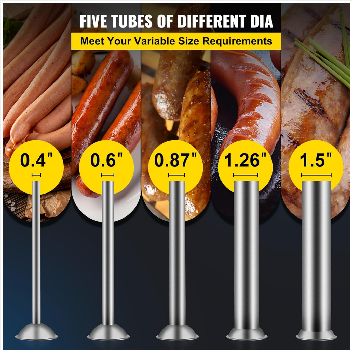
Image: A display of the five stainless steel stuffing tubes included with the VEVOR sausage stuffer, showing their varying diameters (0.4", 0.6", 0.87", 1.26", 1.5") to accommodate different sausage sizes.