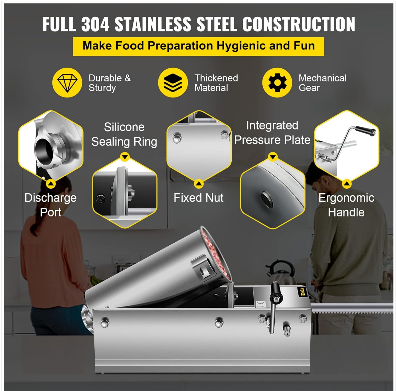
Image: Detailed view of the VEVOR 5L Horizontal Manual Sausage Stuffer, illustrating its full 304 stainless steel construction and key parts like the discharge port, silicone sealing ring, fixed nut, integrated pressure plate, and ergonomic handle.