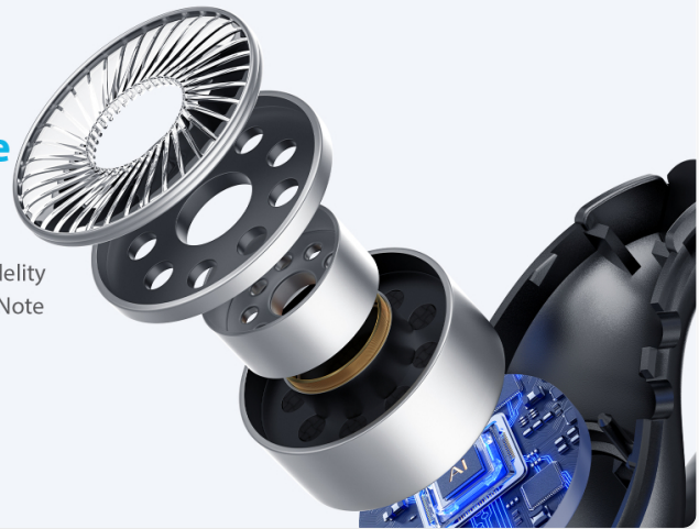
Image: Diagram illustrating the 16.3mm dynamic drivers and audio technology within the Boytond S30i earbuds.

Crystal-Clear Highs, Deep Rich Bass—Experience True Audio Fidelity Dual Audio Technology Delivers Studio-Grade Sound for Every Note Exclusive High-Low Frequency Tuning for Immersive Listening