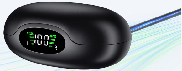
Image: The Boytond S30i charging case connected via USB-C, displaying battery levels for both earbuds and the case.