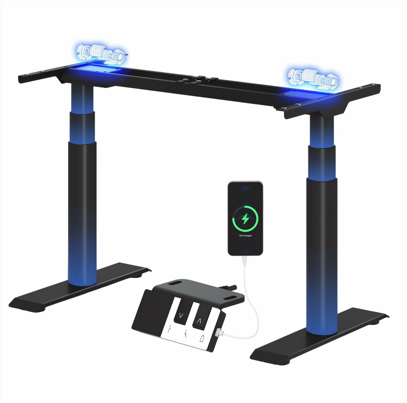
Image: The FLEXISPOT CylineX Pro Electric Standing Desk Frame with a black tabletop in a home office environment.