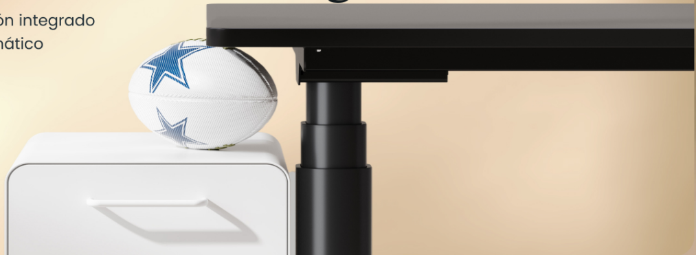
Image: The integrated anti-collision system provides safer movement by automatically reversing if an obstacle is detected.

Sistema anti-colisión integrado para reinicio automático