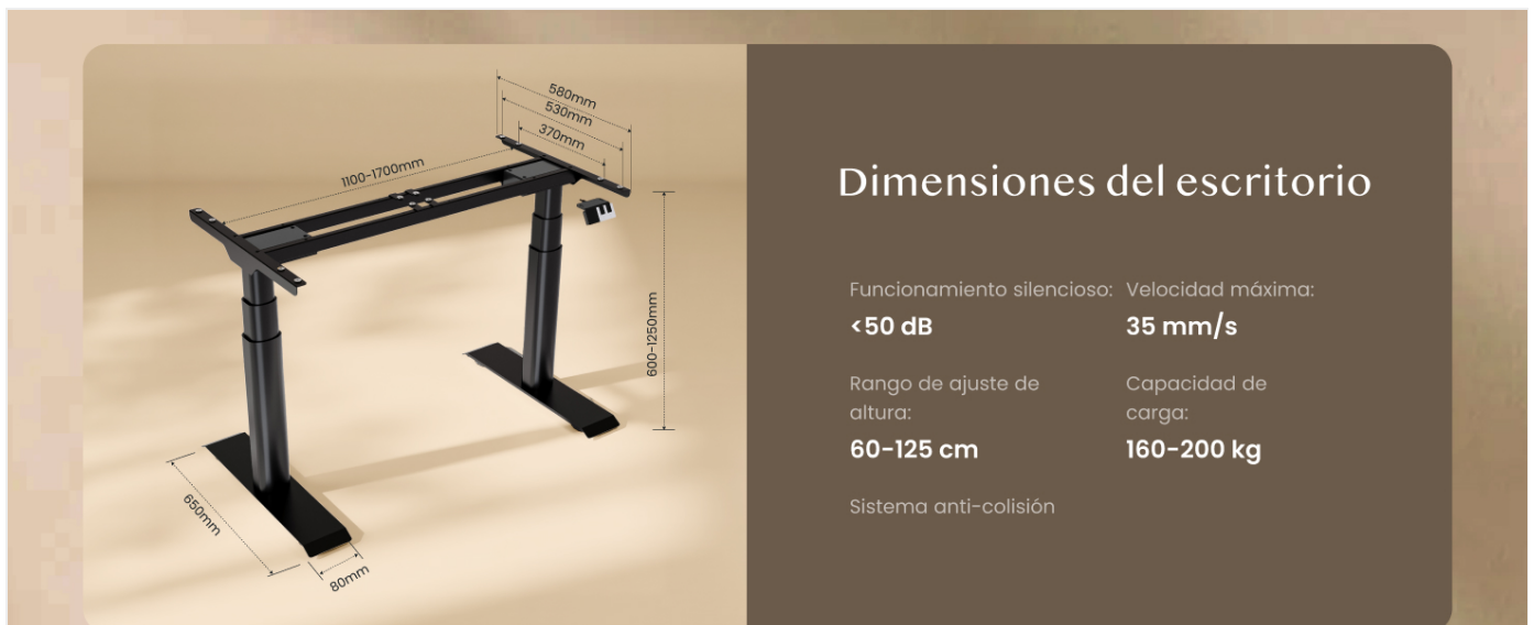
Image: Detailed dimensions and performance specifications of the CylineX Pro desk frame.

Key technical specifications for the FLEXISPOT CylineX Pro Electric Standing Desk Frame: