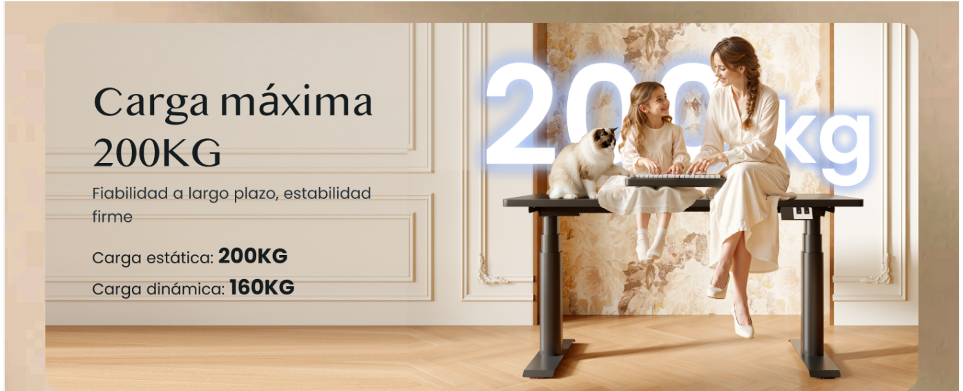
Image: The desk's robust construction supports a maximum static load of 200 kg and a dynamic load of 160 kg.