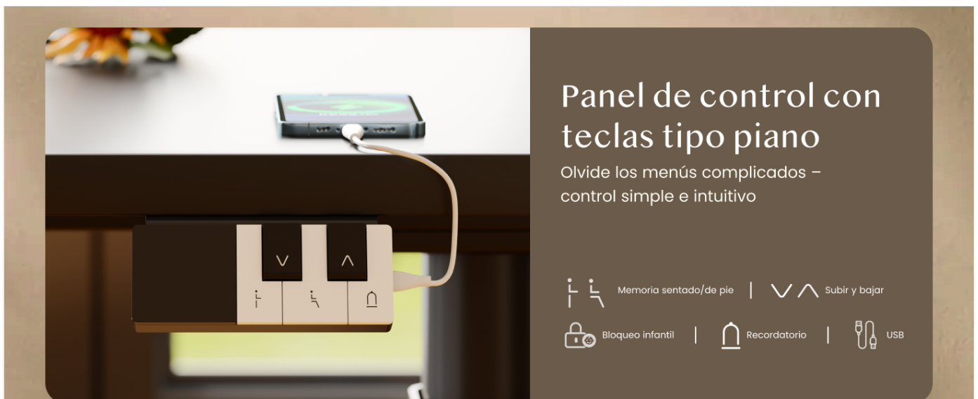
Image: The piano-style control panel offers simple and intuitive control with memory functions, sit/stand reminder, child lock, and a USB port.

The CylineX Pro features an intuitive piano-style control panel for easy height adjustment and personalized settings.