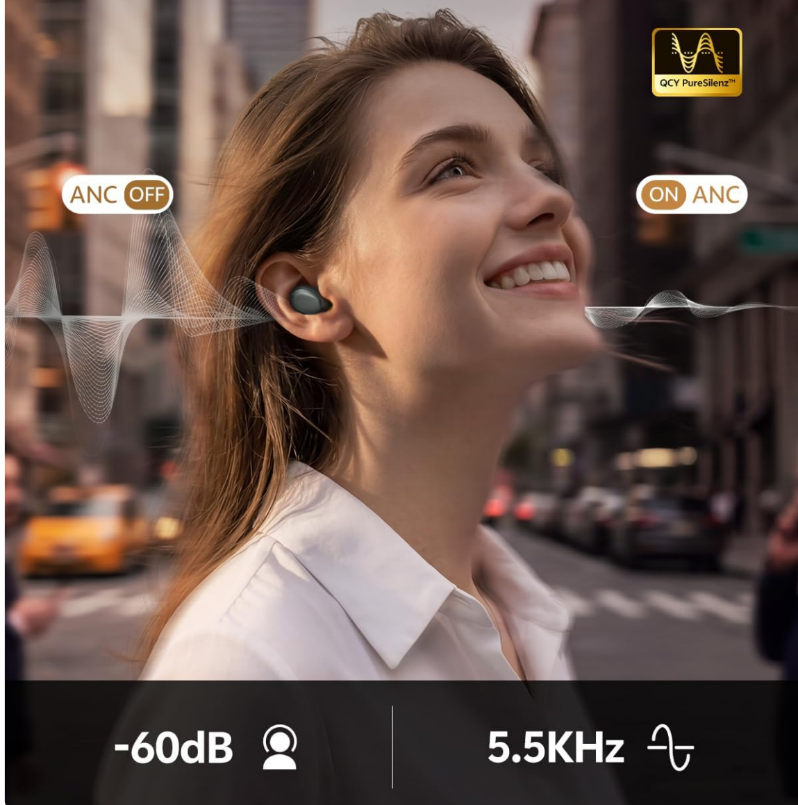
Image: QCY MeloBuds A30 earbuds and charging case.

AIシーン適応ANCと風切り音適応ANCが周囲の環境を自動で検知し、シーンに合わせて最適なノイズキャンセリングレベルへ自動調整。風の強い場所でも、快適でクリアなリスニングを実現します。