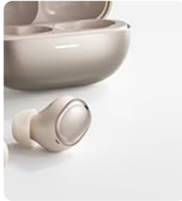
Image: QCY MeloBuds A30 earbuds with water droplets, demonstrating IPX5 water resistance.

The MeloBuds A30 are IPX5 water resistant, protecting them from sweat and water splashes. This makes them suitable for workouts and commuting. However, they are not designed for submersion in water.