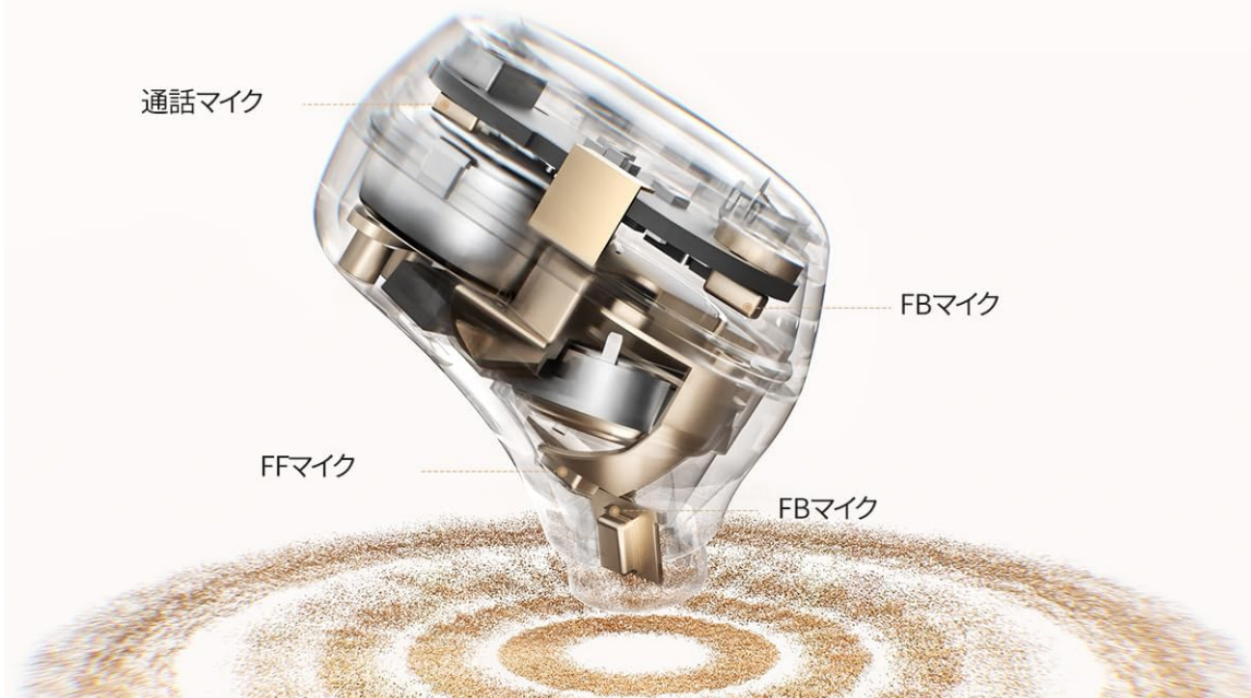
Image: Detailed internal view of a QCY MeloBuds A30 earbud, highlighting microphone components.