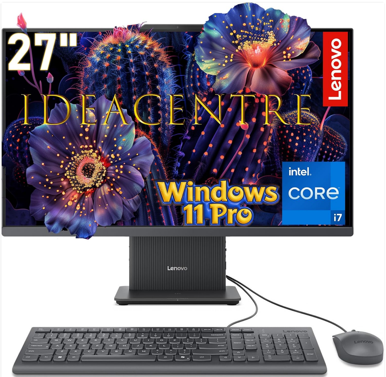
Figure 1: Lenovo IdeaCentre AIO 27 All-in-One Desktop PC