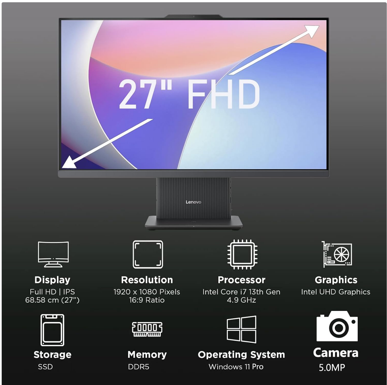
Figure 2: Overview of key features including Display, Resolution, Processor, Graphics, Storage, Memory, Operating System, and Camera.