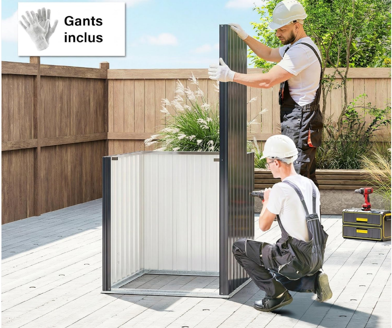
Image 4.1: Assembly in progress, highlighting the recommendation for 2-3 people and the use of included gloves for safety.