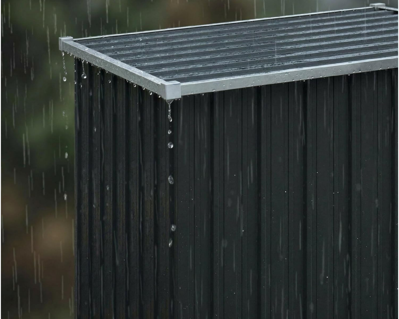
Image 6.2: The inclined roof design ensures efficient water runoff, keeping the interior dry.