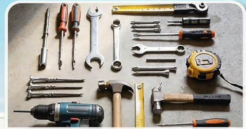
Abri à outils