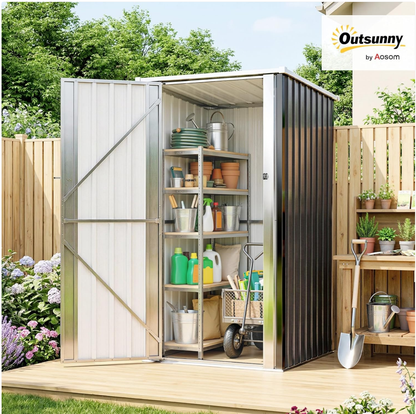
Image 1.1: The Outsunny Metal Garden Shed, designed for organized outdoor storage.

This compact metal garden shed is designed to integrate seamlessly into your outdoor space, providing an optimal organization solution. Constructed from galvanized and lacquered steel, it offers resistance against rust, UV rays, and humidity, ensuring durable outdoor use. Its sloped roof facilitates rapid water drainage, keeping your stored items dry.