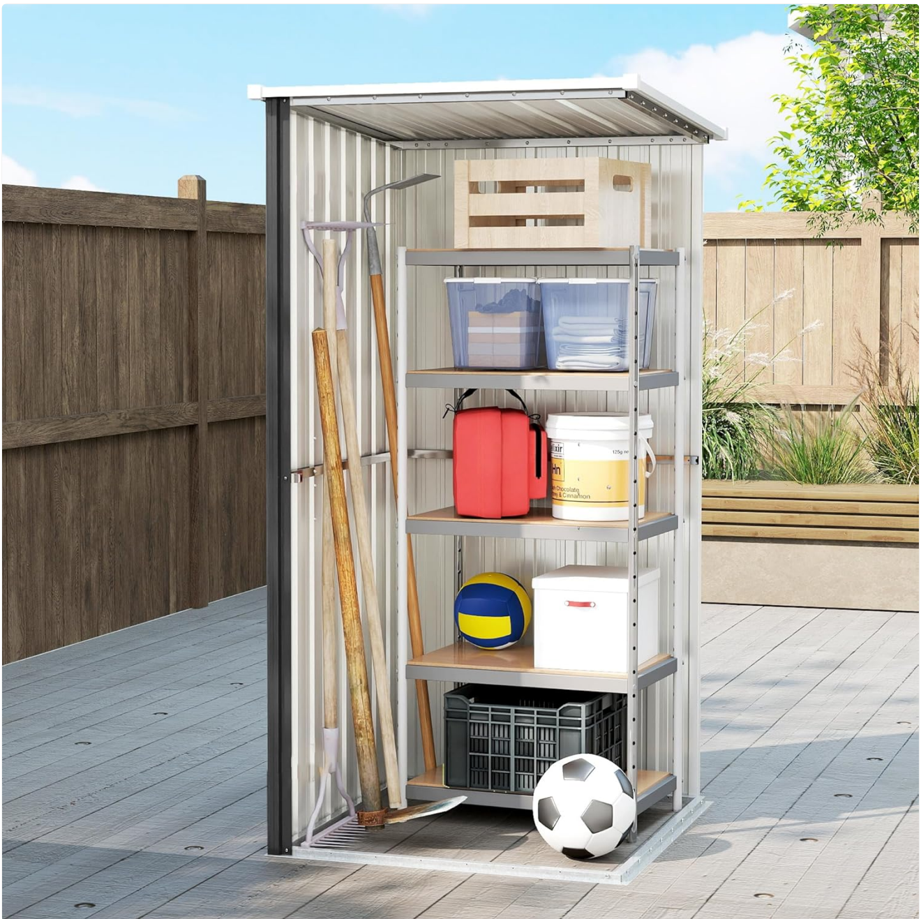
Image 5.2: Example of organized storage within the shed, accommodating various garden and sports items.