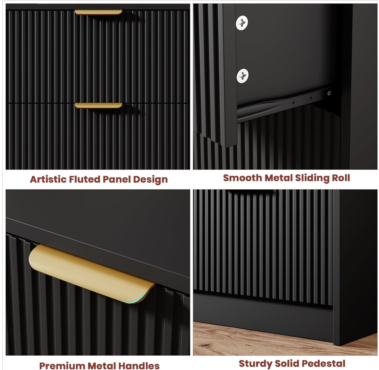
Image: Detailed view of the dresser's features, including fluted panels, drawer glides, handles, and base.