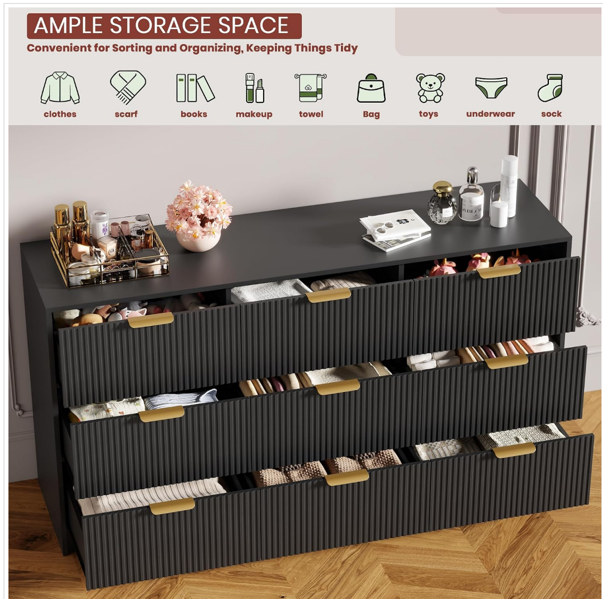
Image: The dresser with drawers open, illustrating its storage capacity for various household items.