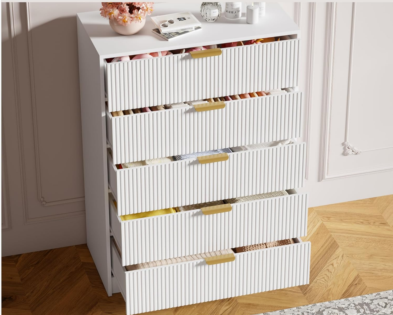
Figure 3: The dresser with drawers open, showcasing its ample storage space for organizing various items such as clothing, books, and personal accessories, helping to maintain a tidy environment.