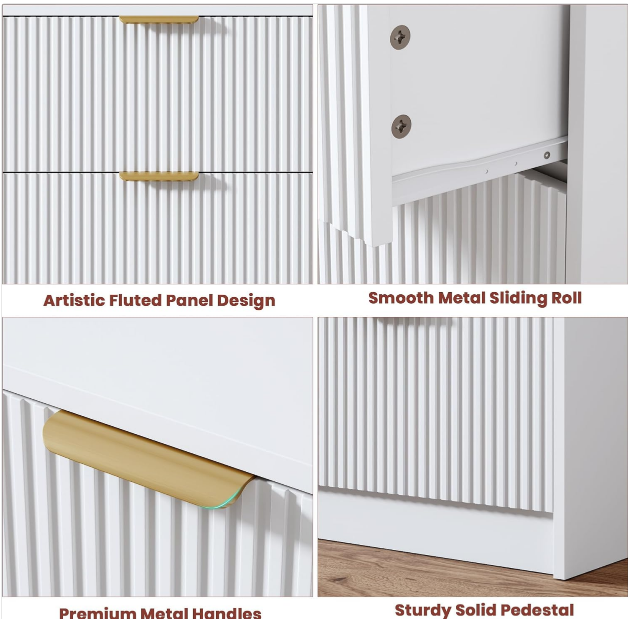
Figure 2: Detailed views of key components: the artistic fluted panel design, the smooth metal drawer slides, the premium golden metal handles, and the sturdy solid pedestal base, highlighting the quality and design elements.