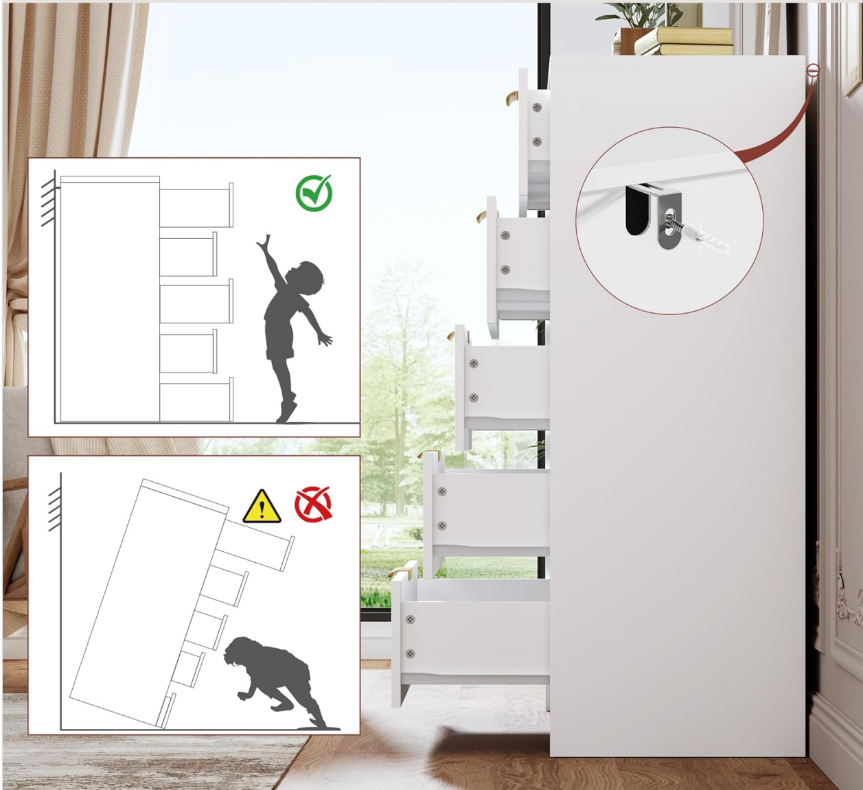
Figure 1: Illustration of the anti-tipping device installation. This device is essential for preventing the dresser from accidentally tipping over, ensuring safety, especially around children.