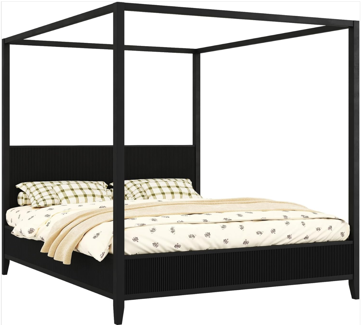
Figure 1: Front view of the Merax King Size Canopy Bed Frame, illustrating the integrated wooden slat support system.