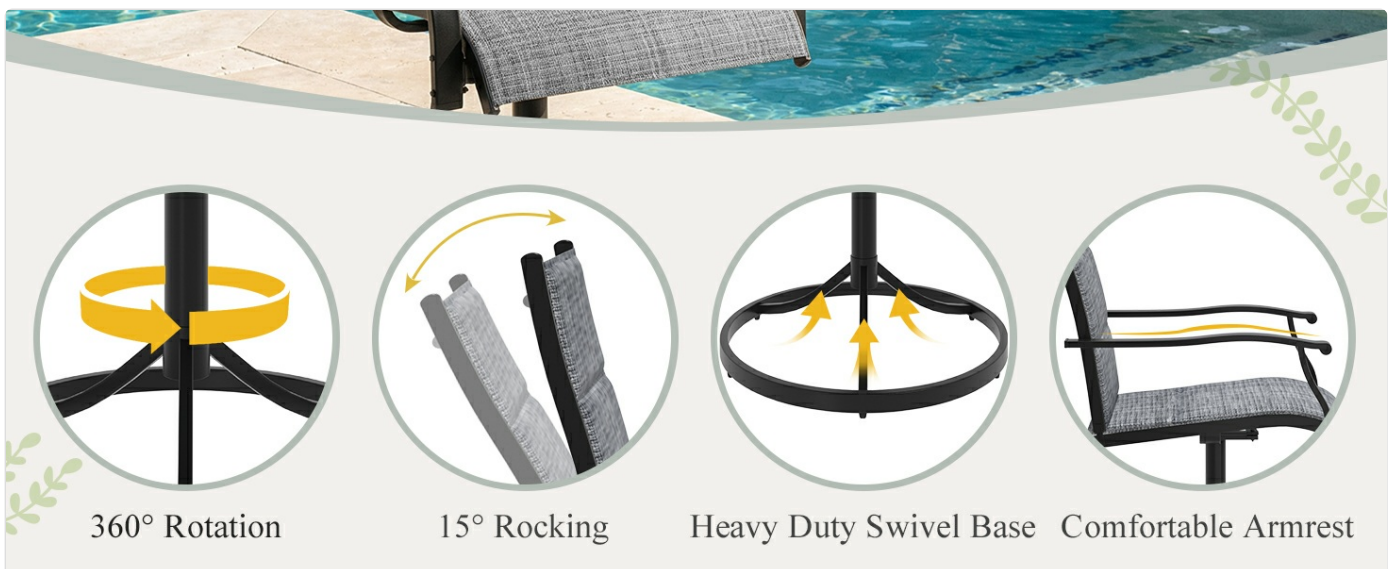
Figure 4.2: Key features of the swivel chairs: 360° rotation, 15° rocking, heavy-duty swivel base, and comfortable armrests.