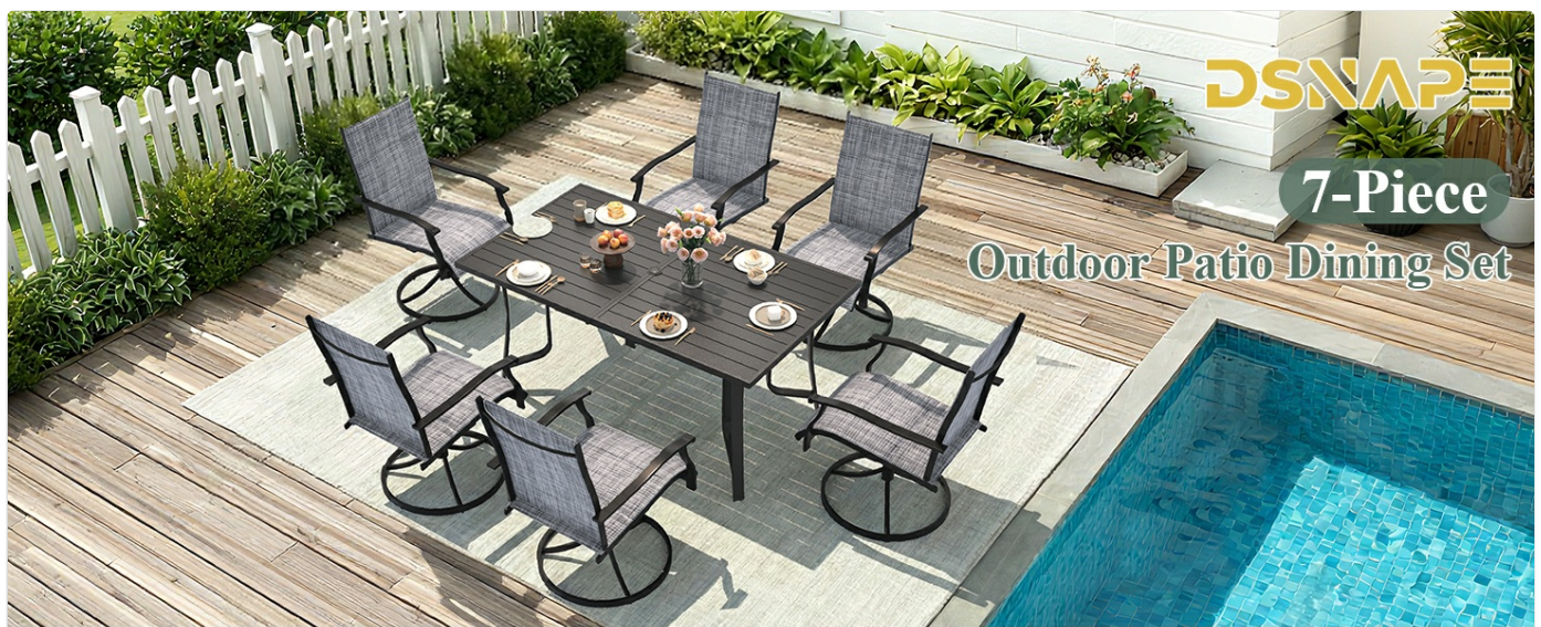
Figure 3.1: The fully assembled DSNAPÉ 7-Piece Patio Dining Set, featuring a rectangular table and six swivel chairs.