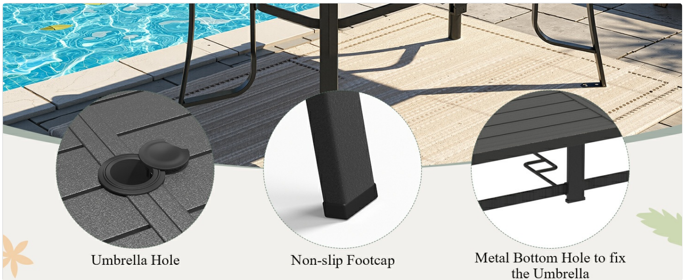
Figure 4.1: Detailed view of the table's features: umbrella hole, non-slip footcap, and metal bottom hole for umbrella stability.