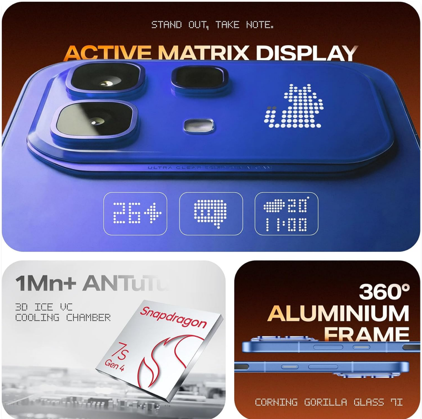
Image: Close-up of the Infinix Note 60 Pro's rear panel, showcasing the Active Matrix Display with dynamic light patterns for notifications and information.

The Infinix Note 60 Pro features a 6.78-inch Full HD+ AMOLED display with a 144Hz refresh rate, offering smooth scrolling and vibrant visuals. It boasts up to 4500 Nits Peak Brightness for clear visibility even in bright conditions. The device also incorporates an Active Matrix Display on the rear for interactive notifications and information at a glance.