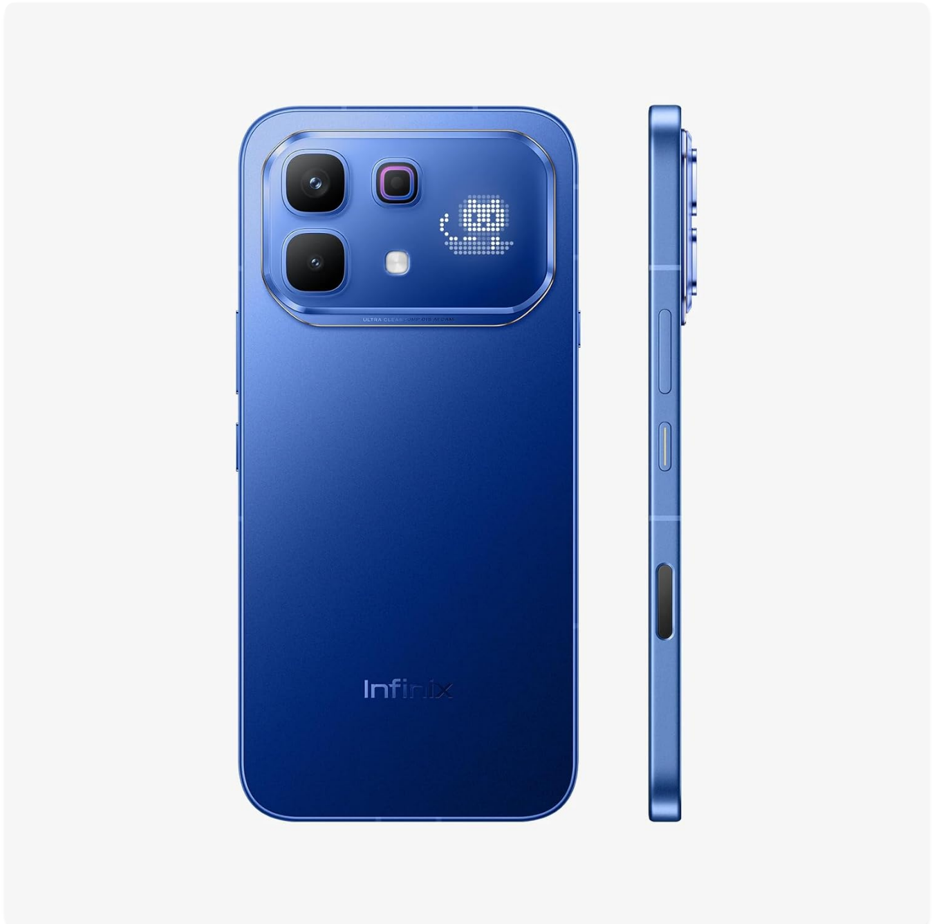
Image: Side view of the Infinix Note 60 Pro, highlighting the location of the SIM card tray and volume/power buttons.