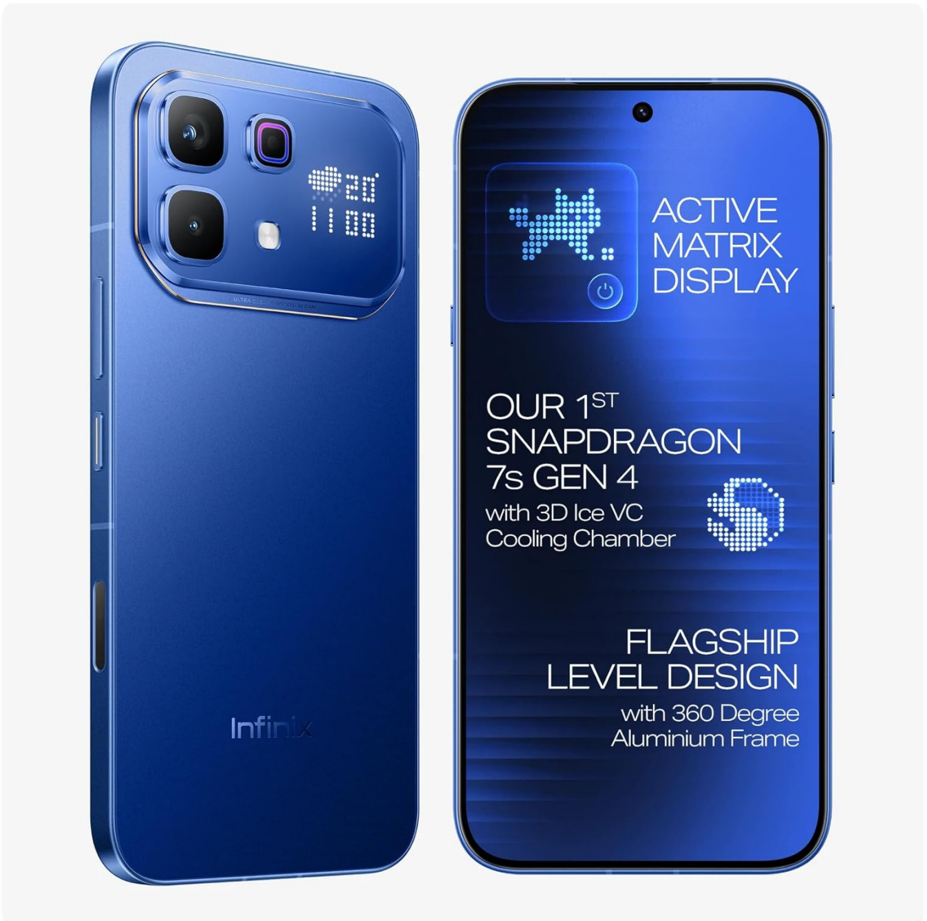
Image: The Infinix Note 60 Pro smartphone in Deep Ocean Blue, showcasing its sleek design.