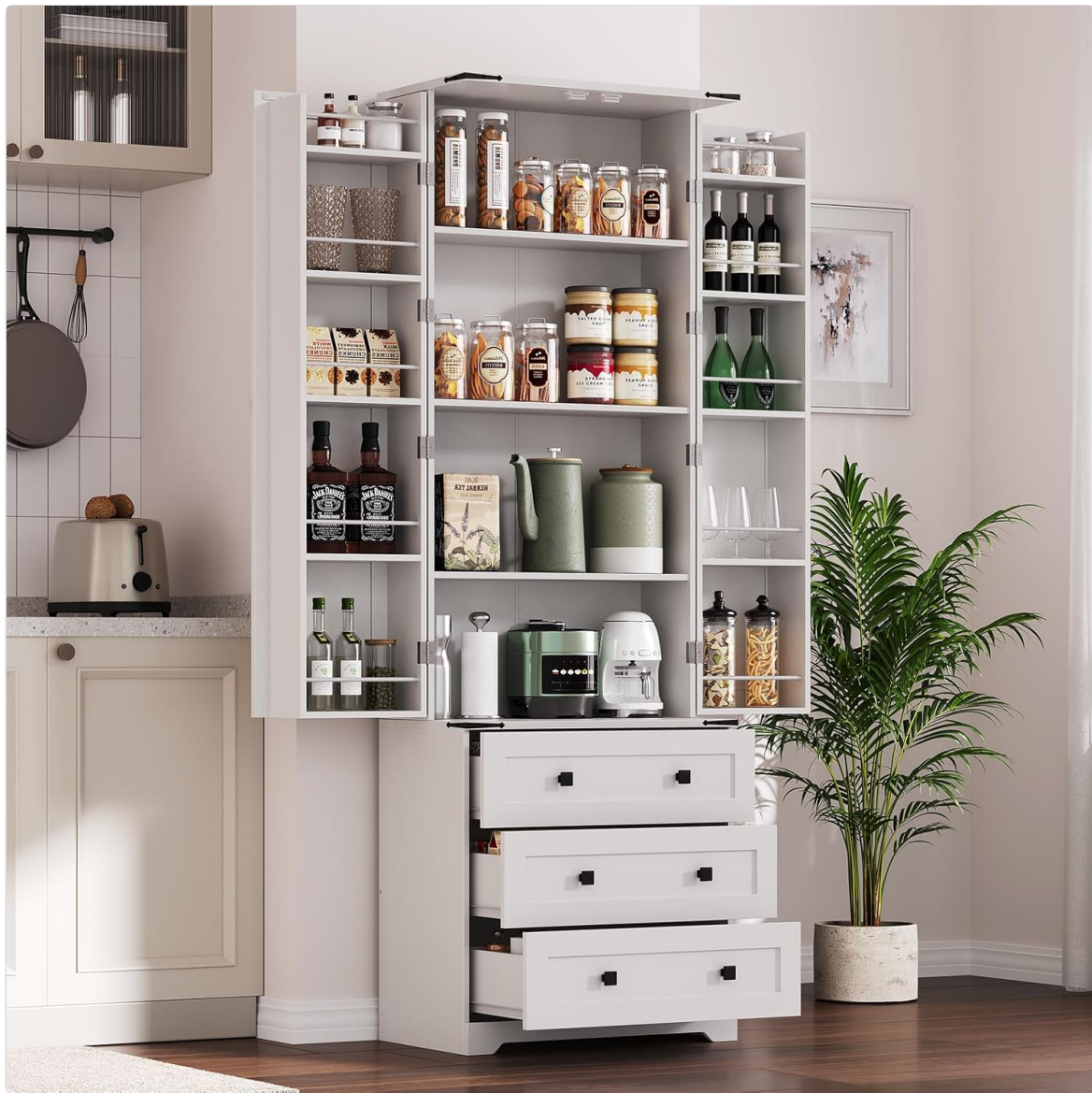
Image: Cabinet with Doors Open. This image shows the Patikuin pantry cabinet with its barn doors fully open and drawers extended, displaying the ample interior storage space for various kitchen items.