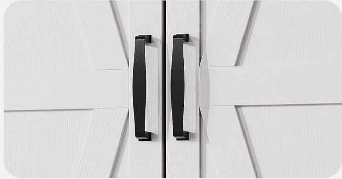
Minimalist Metal Handle