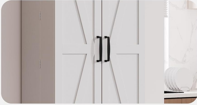
Farmhouse Barn Door