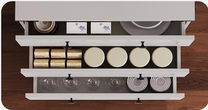
More Storage Space

Image: Barn Door, Handle, and Drawer Storage. This image provides a detailed view of the cabinet's farmhouse-style barn doors, the minimalist black metal handles, and an open drawer demonstrating its storage capacity for various items.