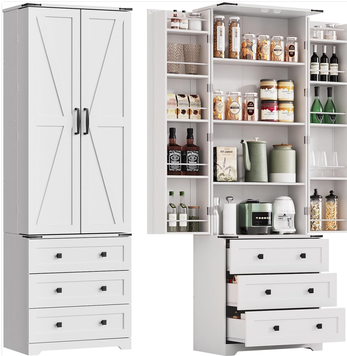
Image: Assembled Cabinet View. This image displays the fully assembled Patikuin 72-inch Pantry Cabinet in a white finish, showcasing its two upper barn-style doors and three spacious lower drawers.