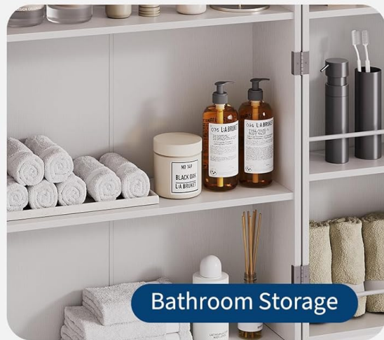
Image: Diverse Storage Options. This image illustrates the versatility of the cabinet, showing it configured for kitchen storage (spices, dishes), bedroom organization (books, office supplies), and bathroom storage (towels, toiletries).