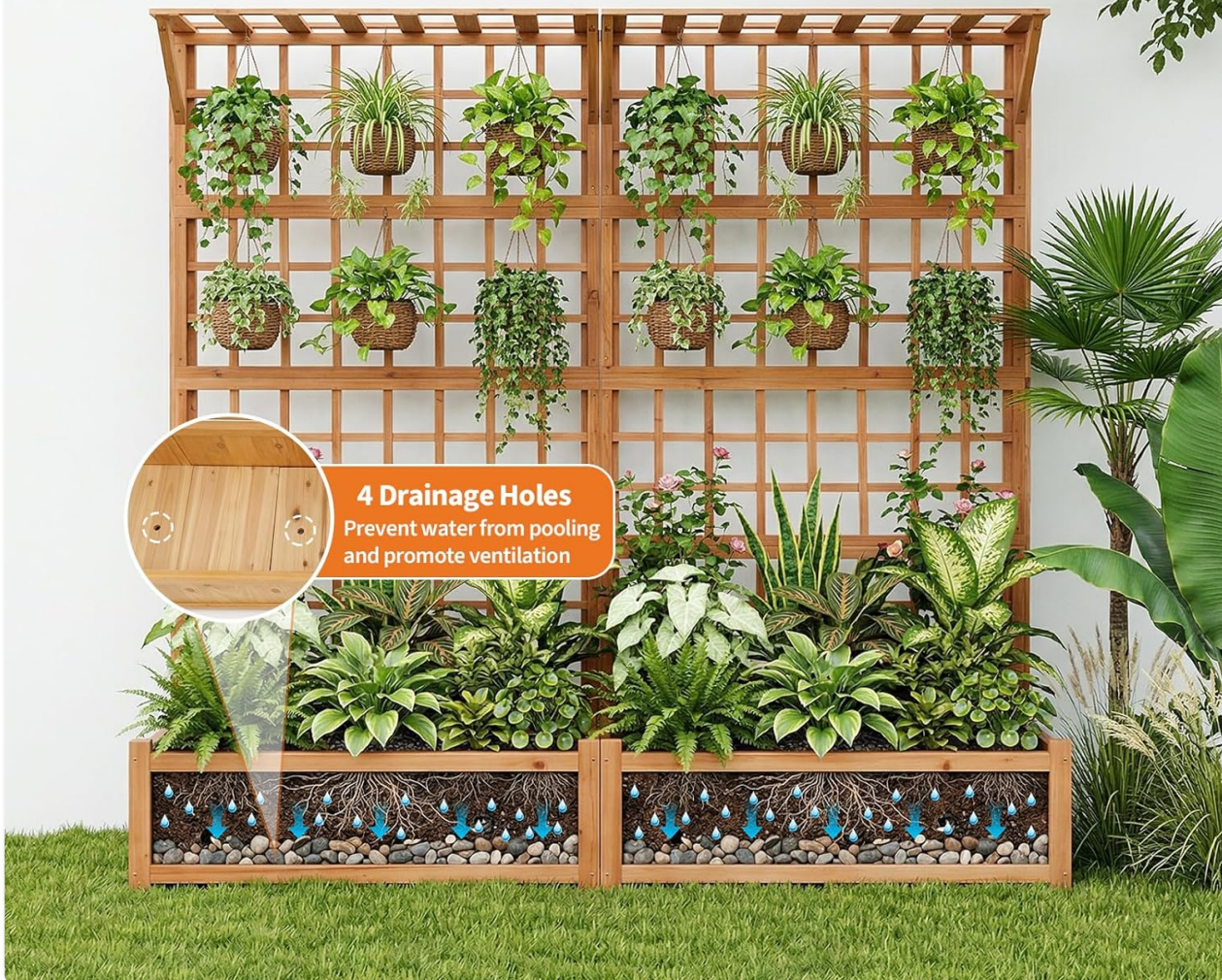
Image: Visual representation of the drainage system.