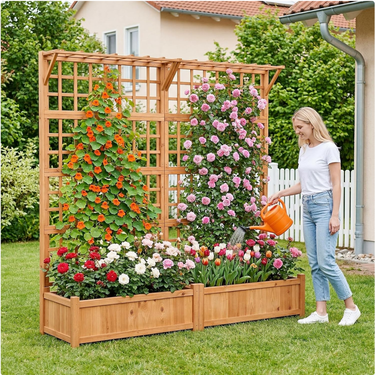
Image: Proper watering of plants in the garden bed.