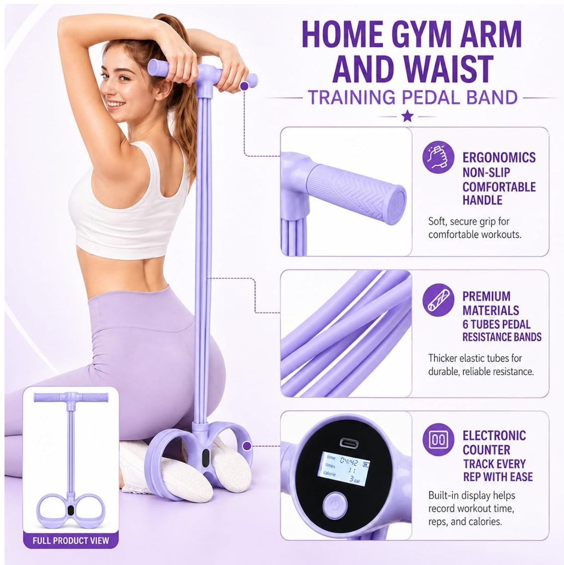
Image: A detailed view of the product highlighting its ergonomic non-slip comfortable handle, premium 6-tube pedal resistance bands, and electronic counter.

comfort handles, 6 natural latex resistance tubes, and non-slip footpads.