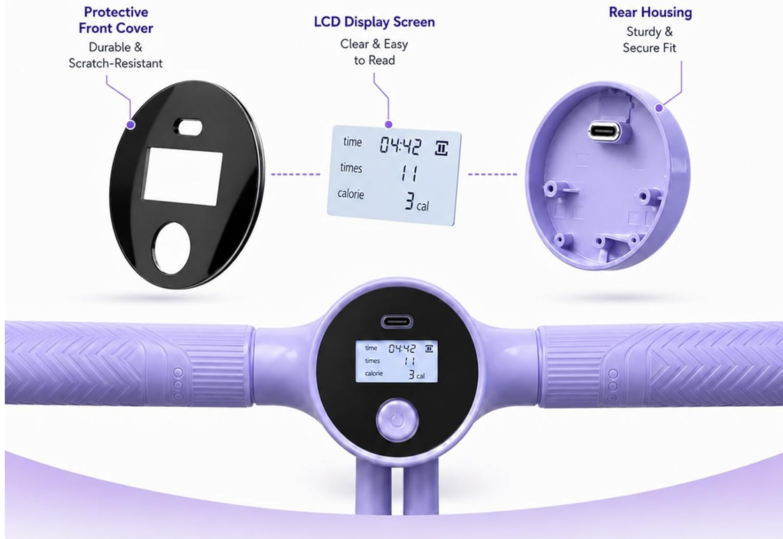
Image: An exploded view of the smart LCD display, detailing its protective front cover, clear display screen, one-touch power button, Type-C rechargeable port, and precision internal counter module.