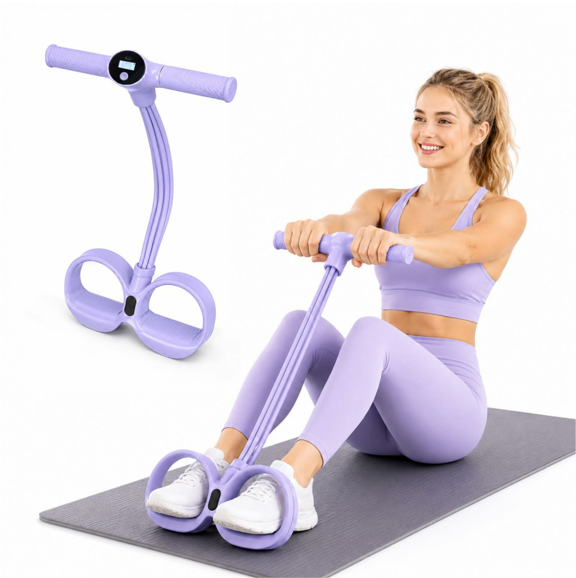
Image: The Exliu Smart Foot Pedal Puller in purple, showcasing its design with a central digital counter and foot pedals.