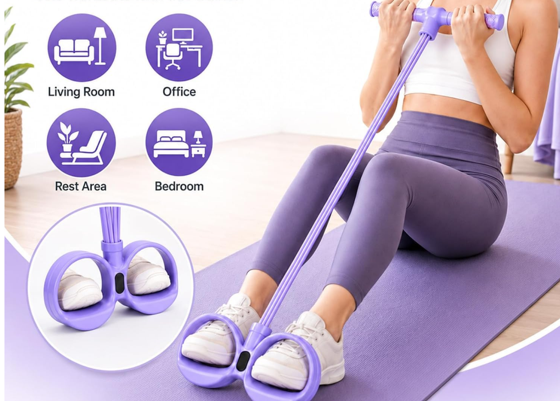
Image: A user demonstrating various exercises with the pedal puller in different home environments, emphasizing its versatility for solo workouts.

No space limits. Effortless solo workouts with this trainer.