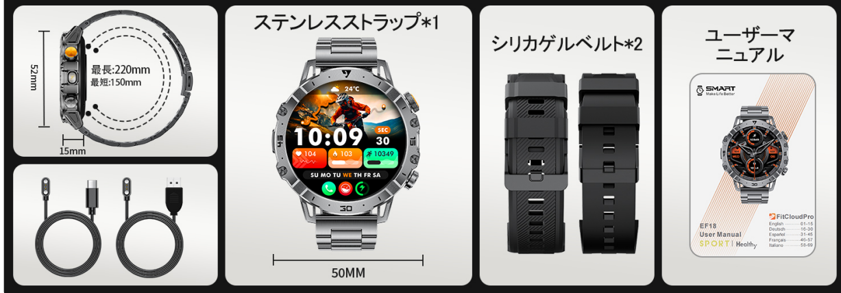
Image: The LIGE EF18 Smartwatch showcasing a selection of its over 200 customizable watch faces, allowing users to personalize their device's appearance.