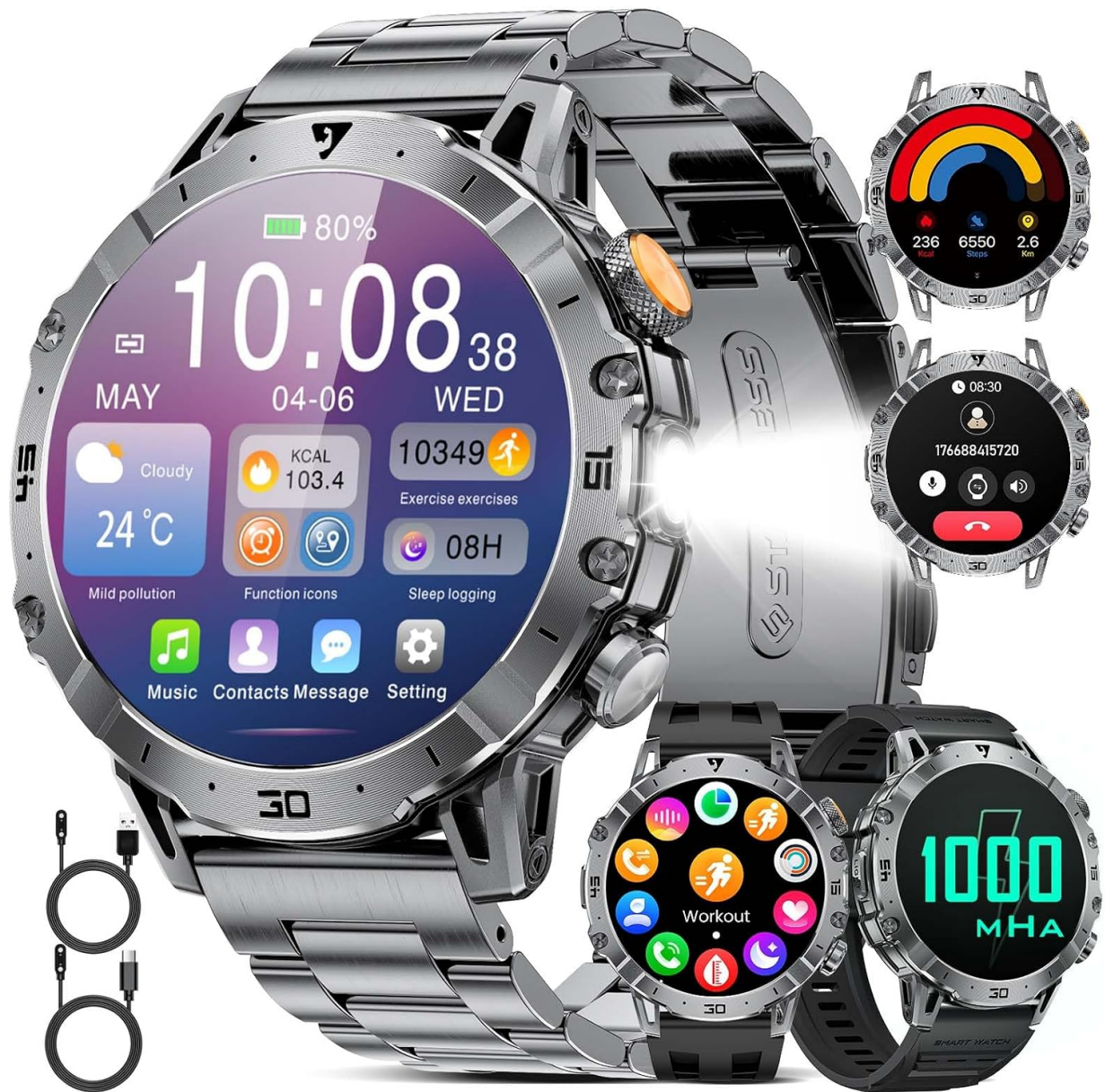
Image: A close-up of the LIGE EF18 Smartwatch, highlighting its large 1.85-inch display, metallic casing, and side buttons. The screen shows various health metrics and time.