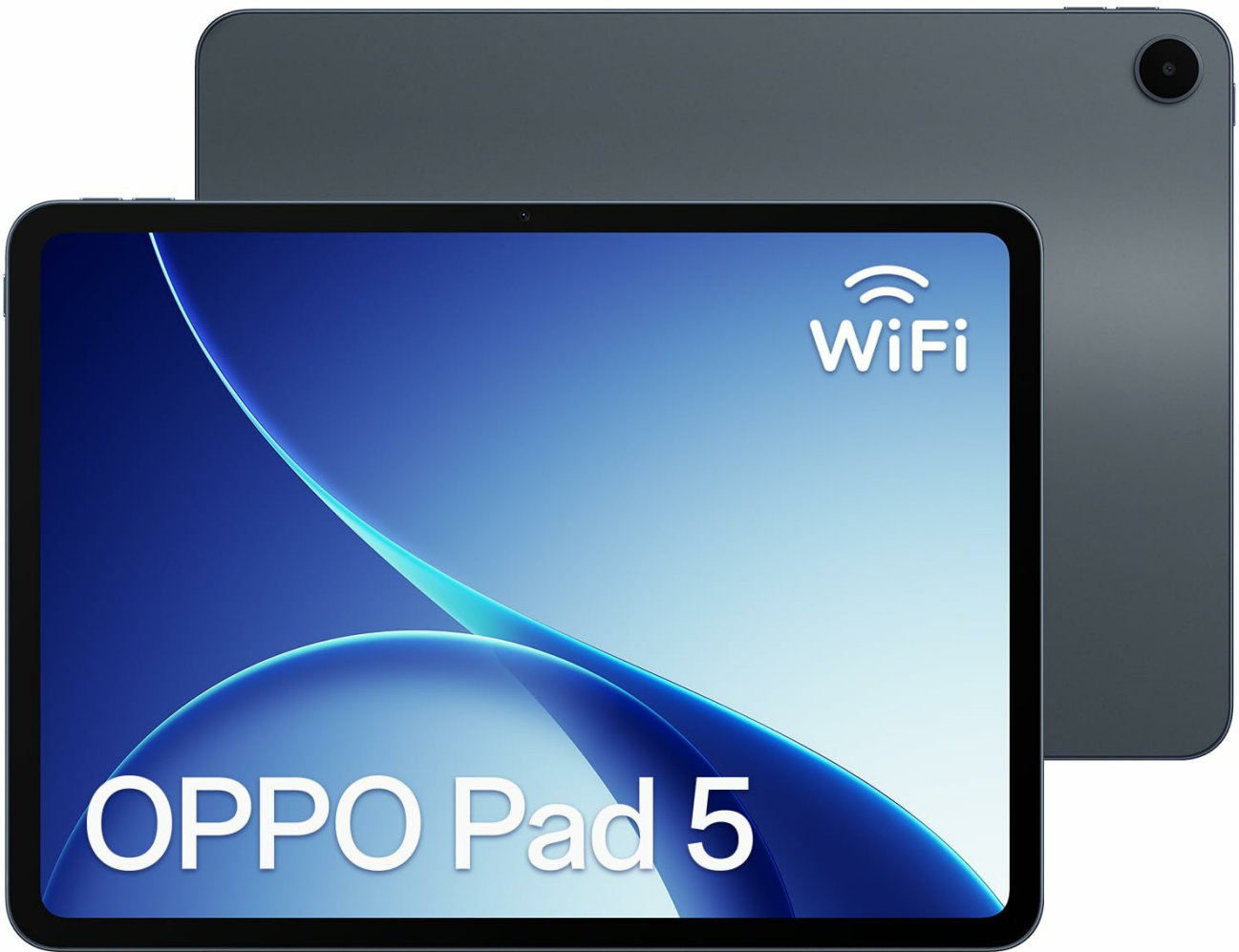
Image: The OPPO Pad 5 Wi-Fi tablet, showcasing its sleek design.