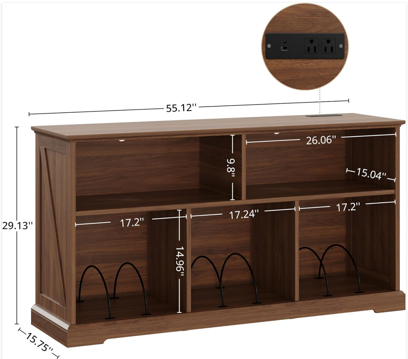
Figure 1: Product Dimensions and Internal Layout. This image illustrates the overall size and internal compartment measurements for planning your setup.