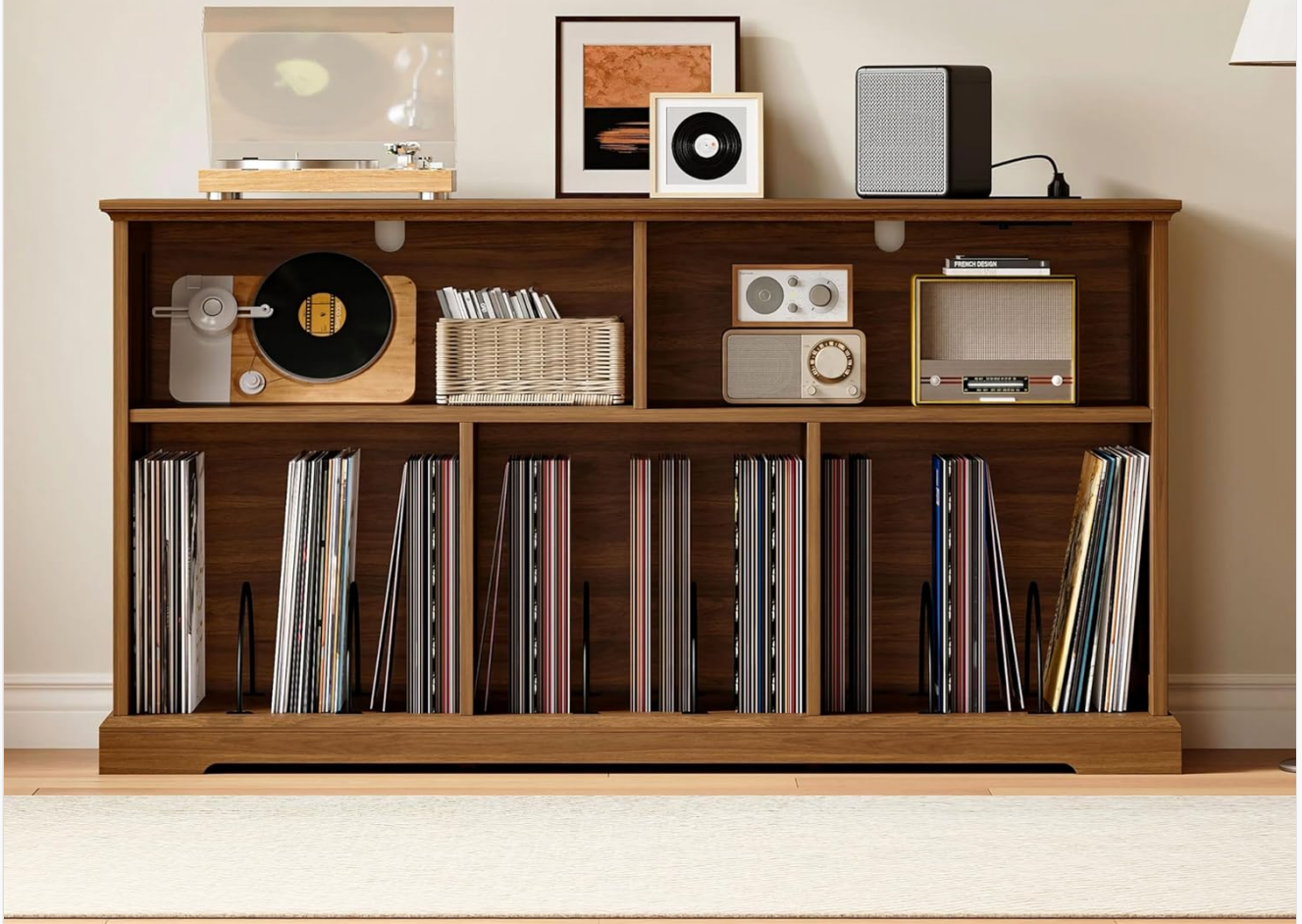
Figure 3: Ample Storage Capacity. This image demonstrates the stand's ability to hold a record player, various accessories, and a substantial vinyl record collection.