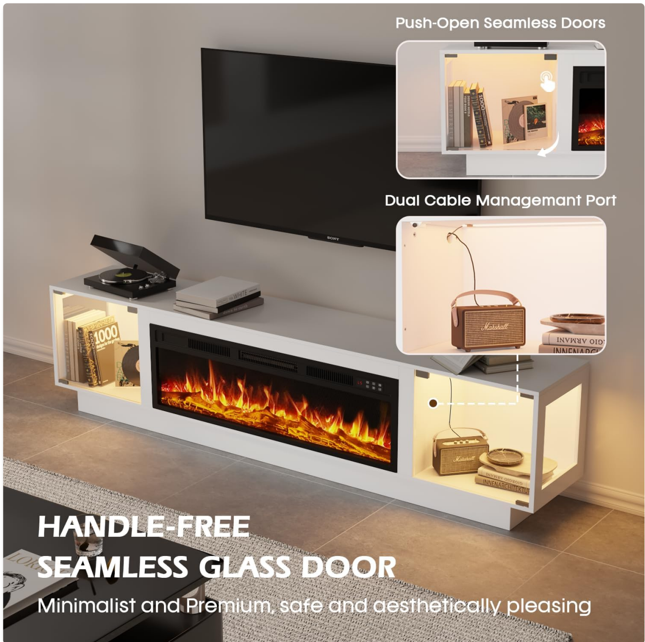
Image 4.2: Illustration of the push-open seamless doors and the dual cable management port for organized wiring.