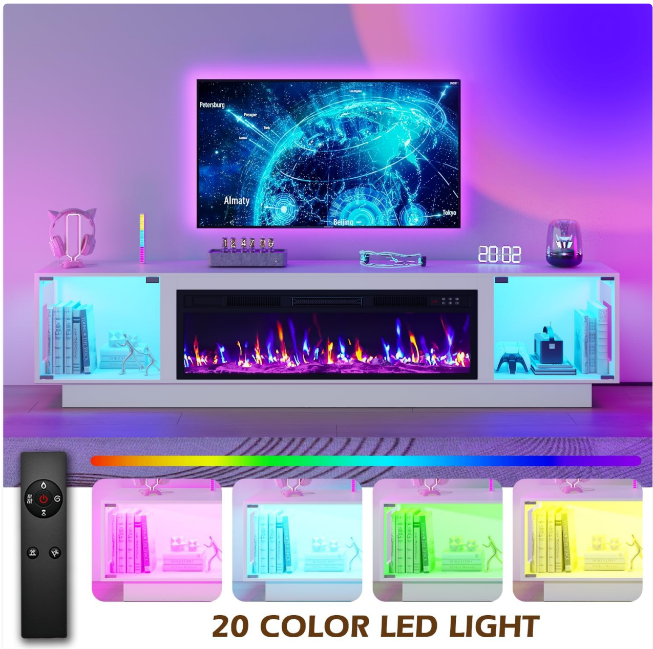
Image 5.2: The TV stand illuminated by 20 different LED light colors, controlled by a remote.