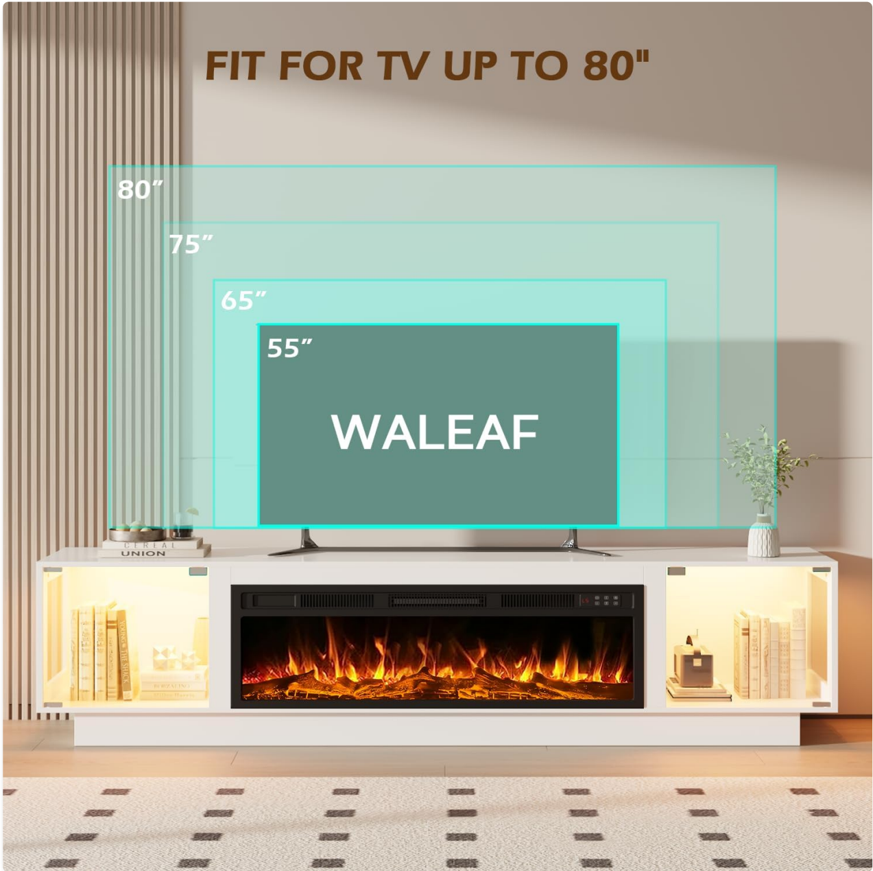
Image 8.1: Visual guide for TV size compatibility, indicating the stand fits TVs up to 80 inches.