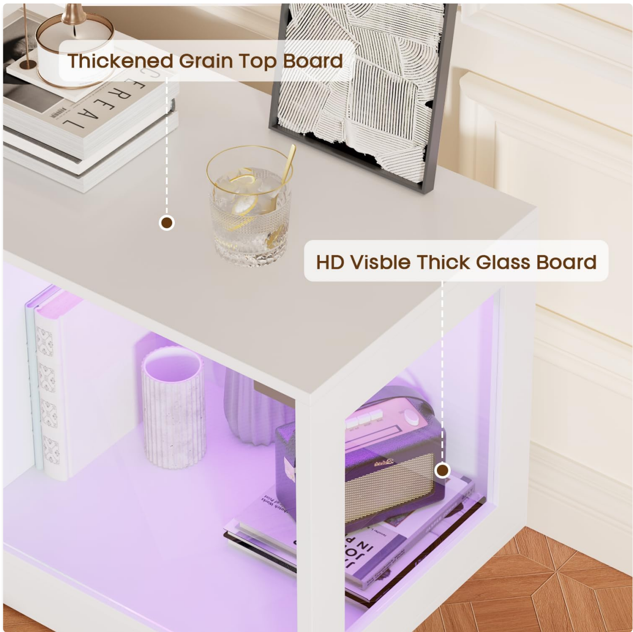
Image 8.2: Detail of the construction materials, showing the thickened top board and the durable, visible thick glass board.