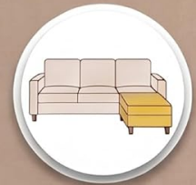
RIGHT SIDE RECLINER

Configuration options can be, move usolr sofa module, middle, recliner, or arofn right side eofn recliners