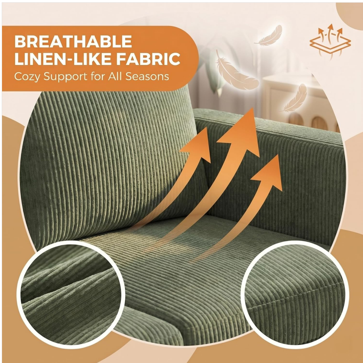
Image 5.1: Detail of the corduroy fabric, which is soft and skin-friendly.