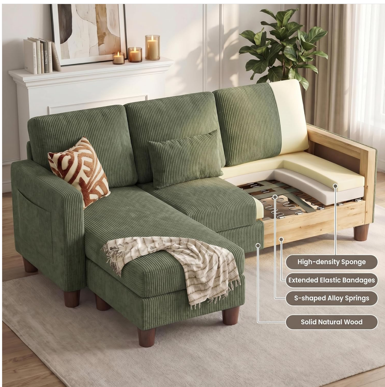
Image 3.1: Illustration of the sofa's internal construction, including solid wood frame, S-shaped alloy springs, extended elastic bandages, and high-density sponge.