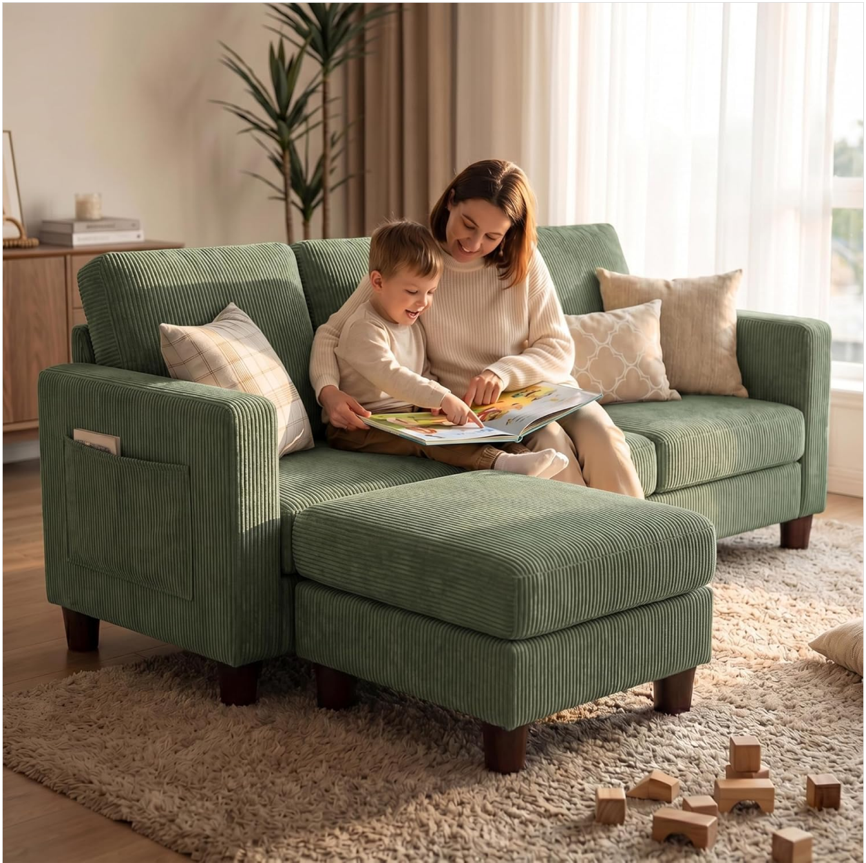
Image 4.2: The sofa being used by a mother and child, highlighting its comfort and family-friendly design.