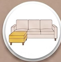
LEFT SIDE RECLINER