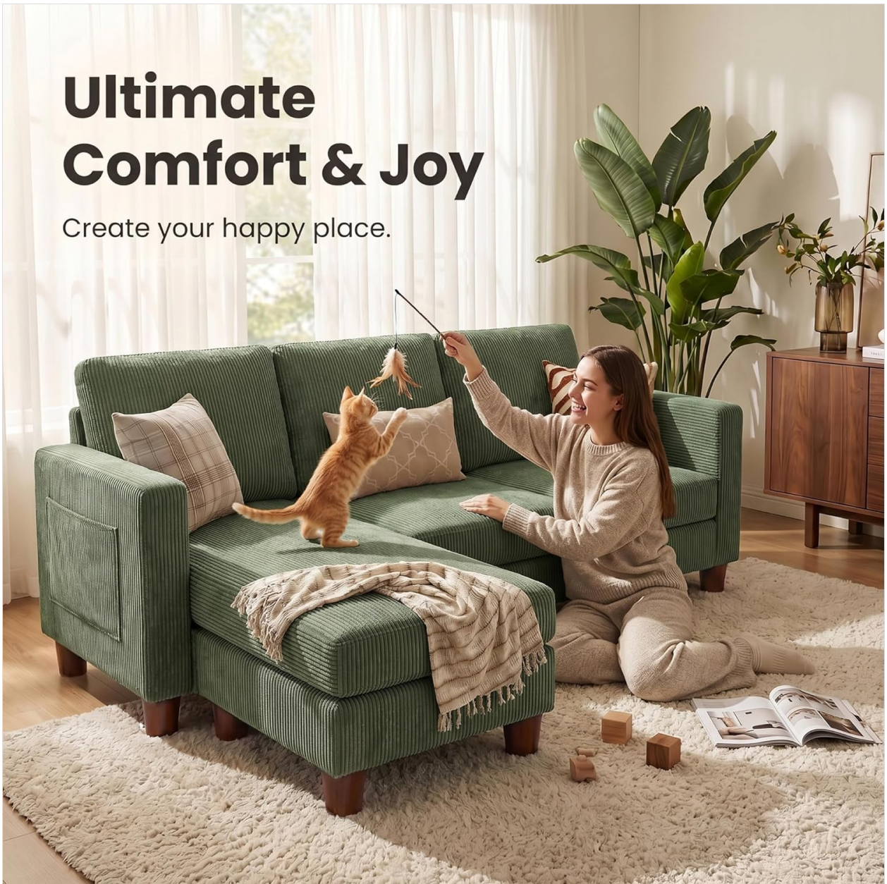
Image 4.3: The sofa's corduroy fabric is designed to be soft and resistant to snagging, making it suitable for households with pets.