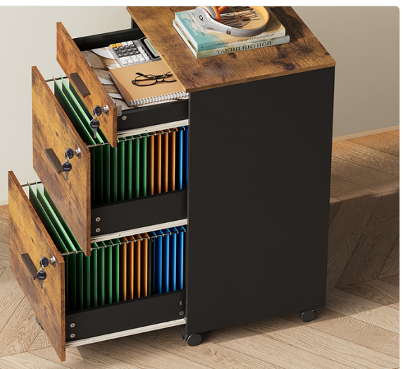
Image: A drawer fully extended, showcasing the smooth operation and accessibility of hanging files.