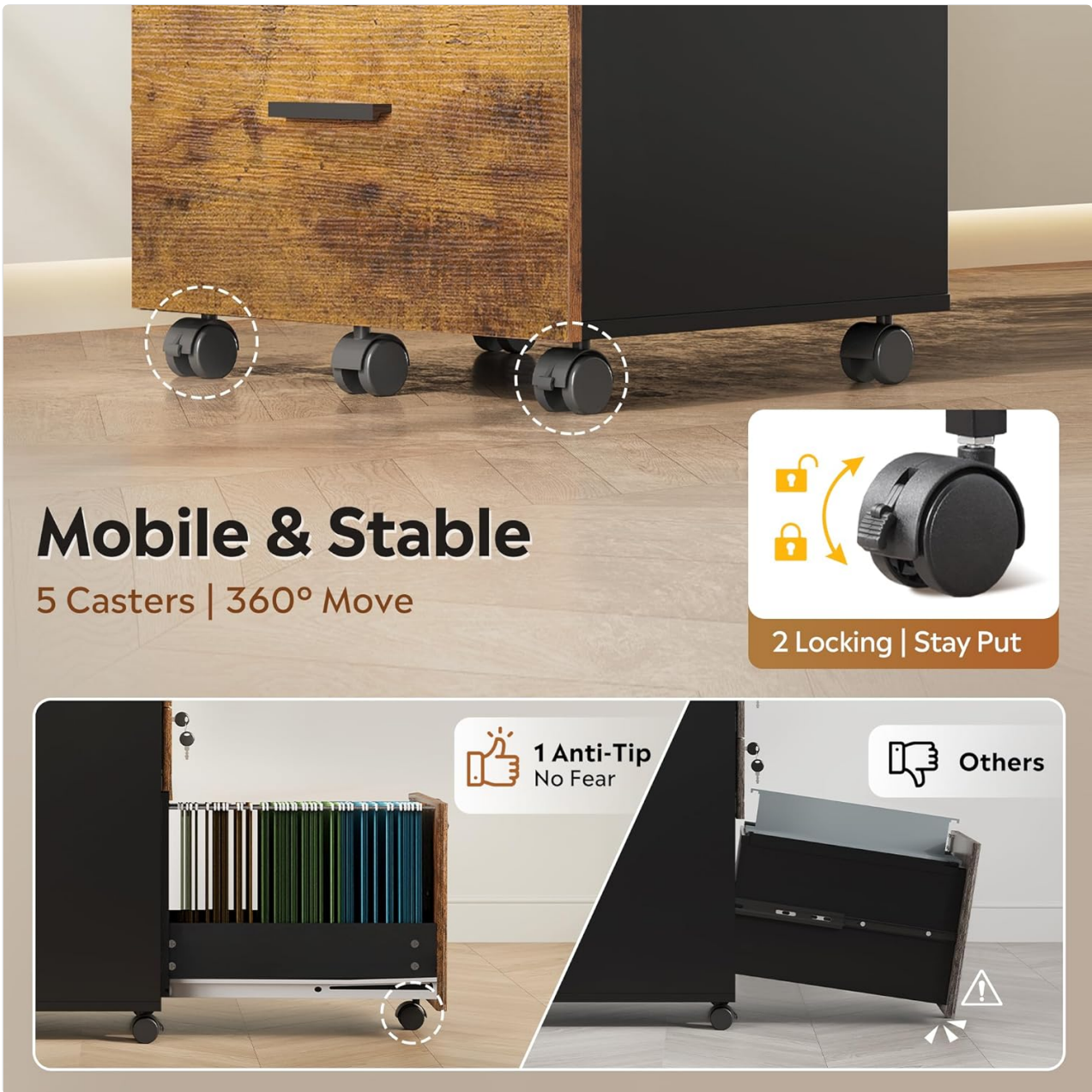
Image: A close-up view of the cabinet's 5-caster system, highlighting the 360° swivel wheels, two locking brakes, and the anti-tip wheel for enhanced stability.