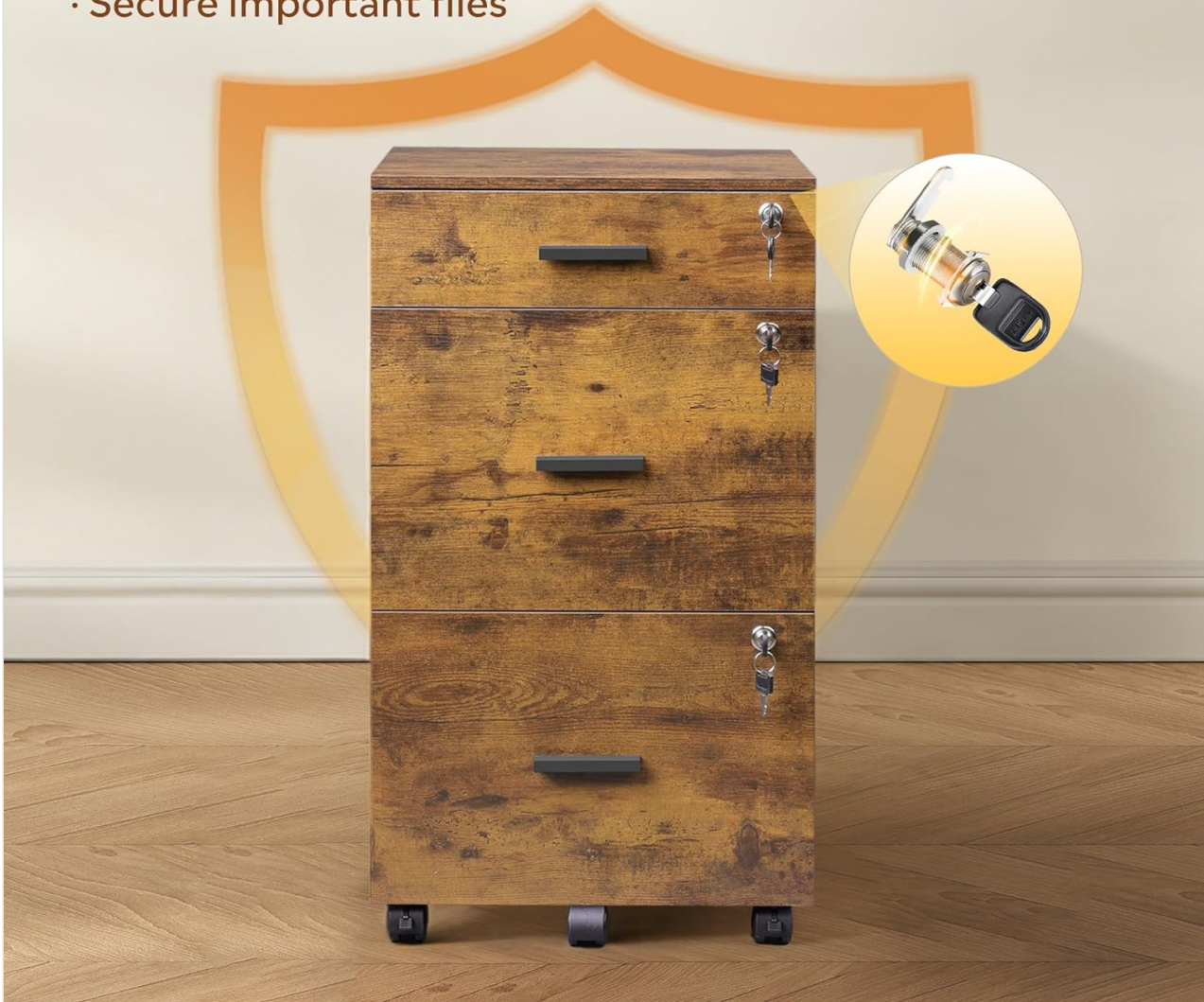
Image: A visual representation of the dual locking system, showing the individual locks for each drawer and a key.