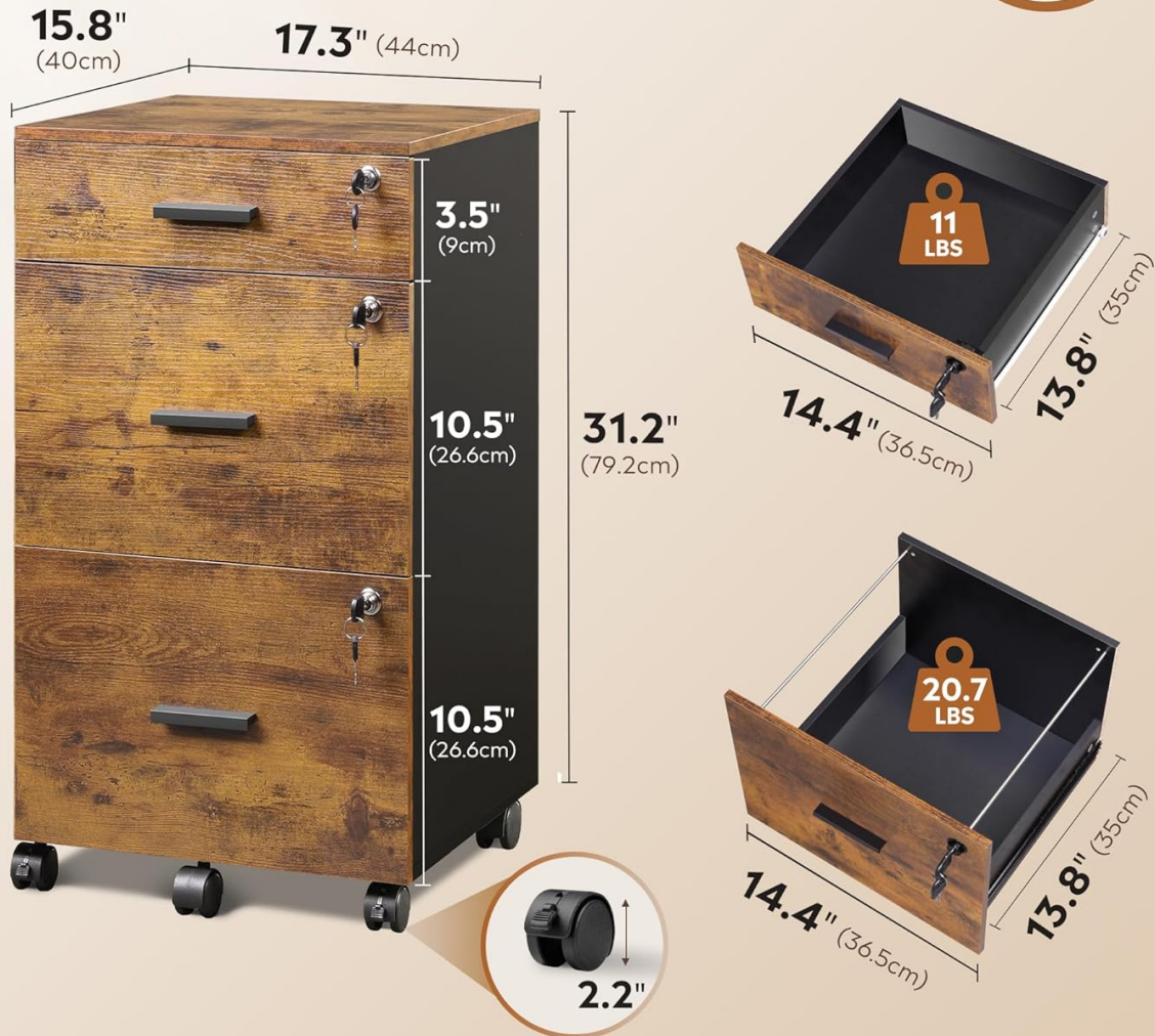
Image: Detailed product dimensions including overall size (15.8"W x 17.3"D x 31.2"H) and individual drawer capacities (top: 11 lbs, bottom two: 20.7 lbs each).