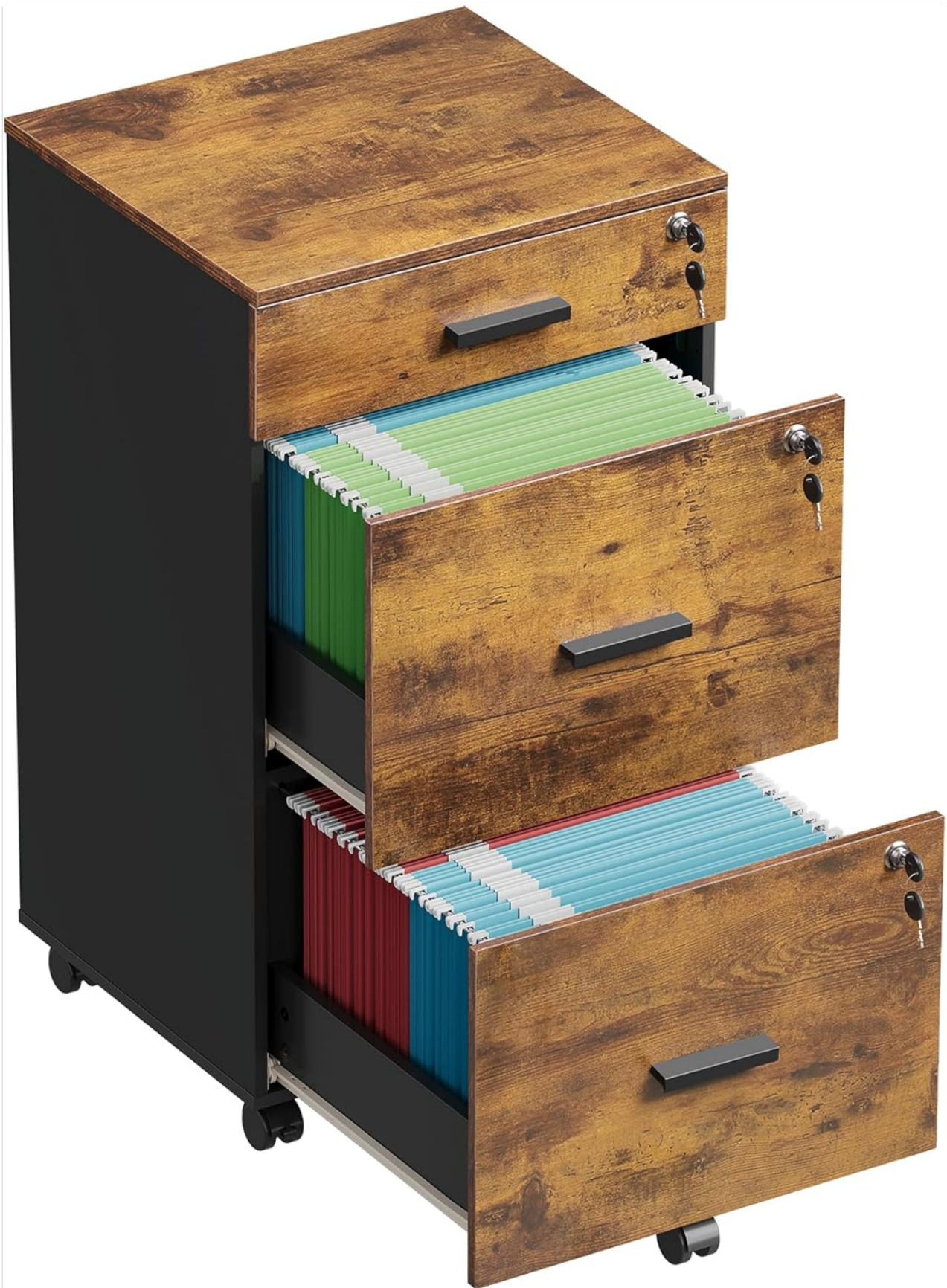
Image: The DEVAISE 3-Drawer Mobile File Cabinet in Rustic Brown, featuring three drawers with locks and wheels, positioned in a home office setting.