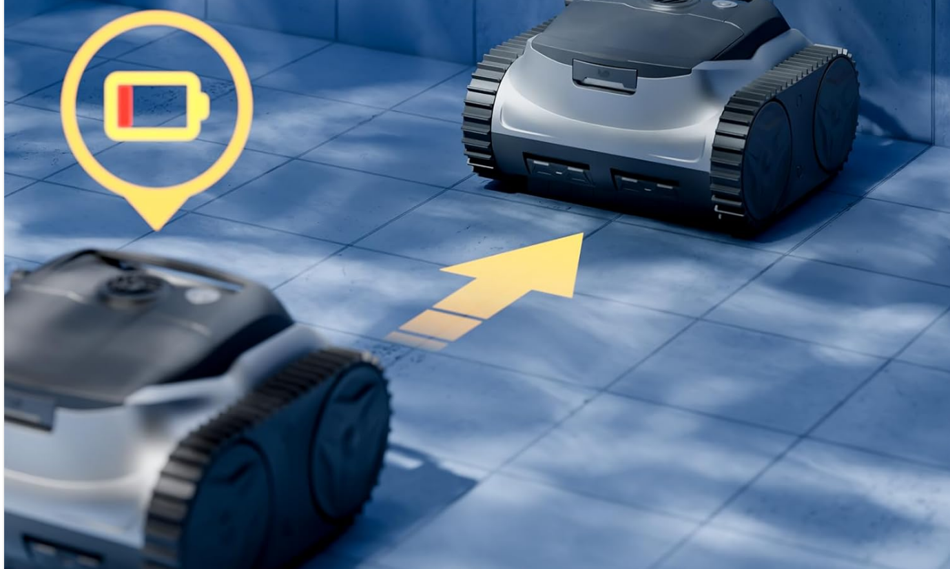
Image: The Bubot 700 robotic pool cleaner connected to its charger, indicating the charging process.