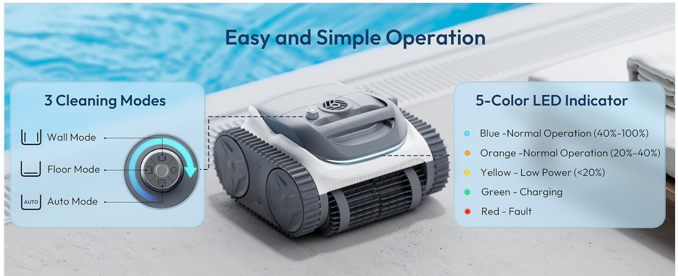
Image: The control knob on the Bubot 700, illustrating the selection options for Wall Mode, Floor Mode, and Auto Mode, alongside a 5-color LED indicator for operational status.

You can select these modes using the control knob on the cleaner or through the BUBLUE app.