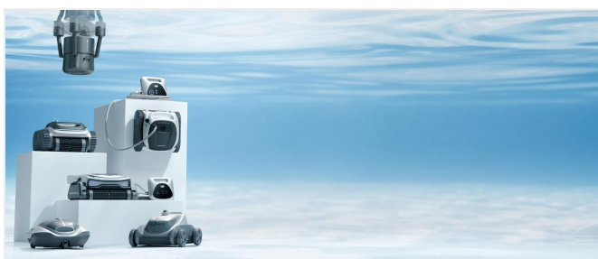
Image: The Bubot 700's powerful suction system, highlighting its 2X scrubbing, 3-motor system, and 3434 GPH suction power.