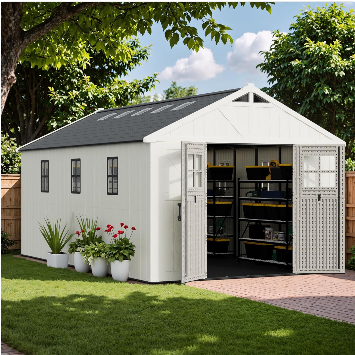
Image 5.2: The shed with its double doors open, revealing ample interior storage space.