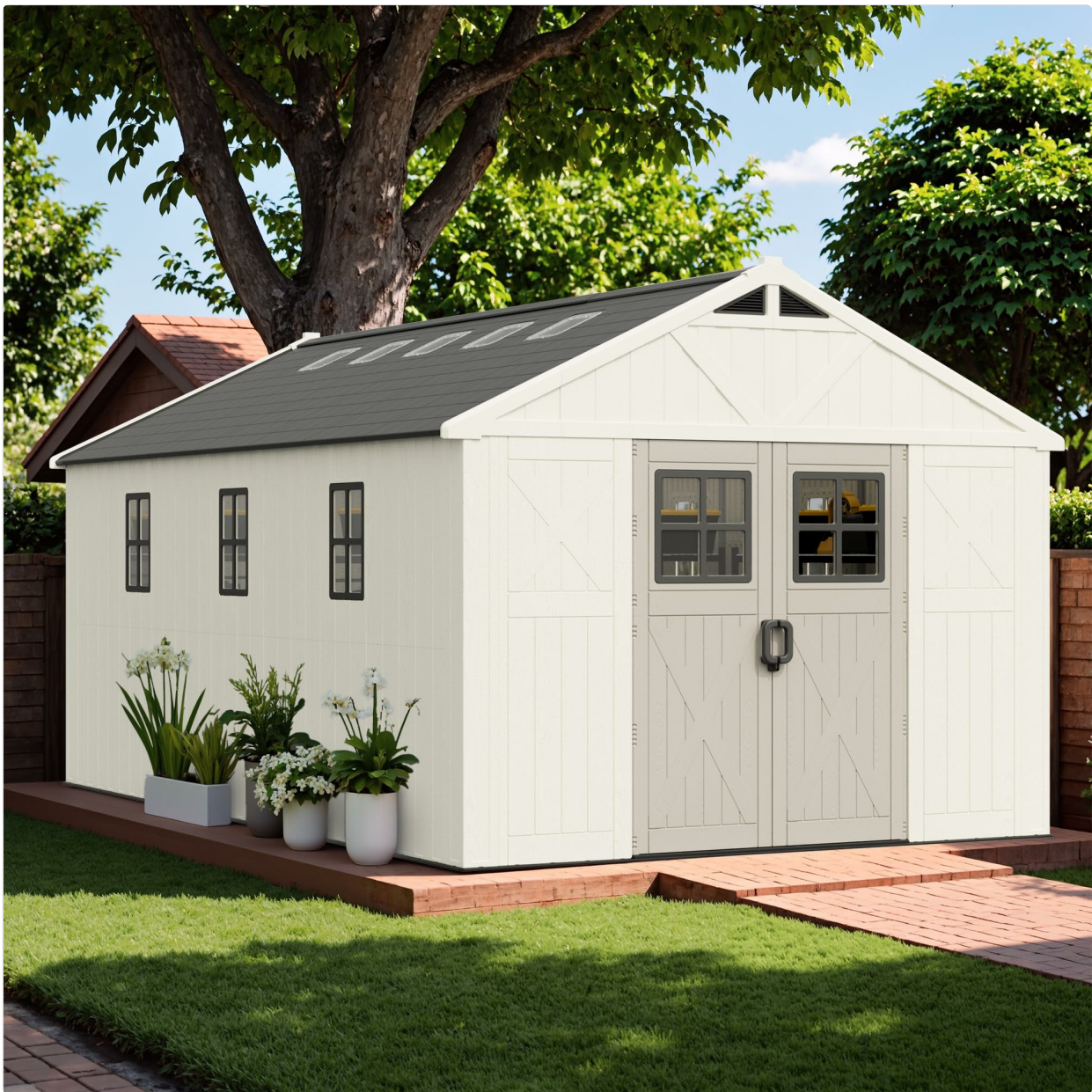
Image 1.1: Front view of the Greesum 10x16FT Plastic Outdoor Storage Shed.