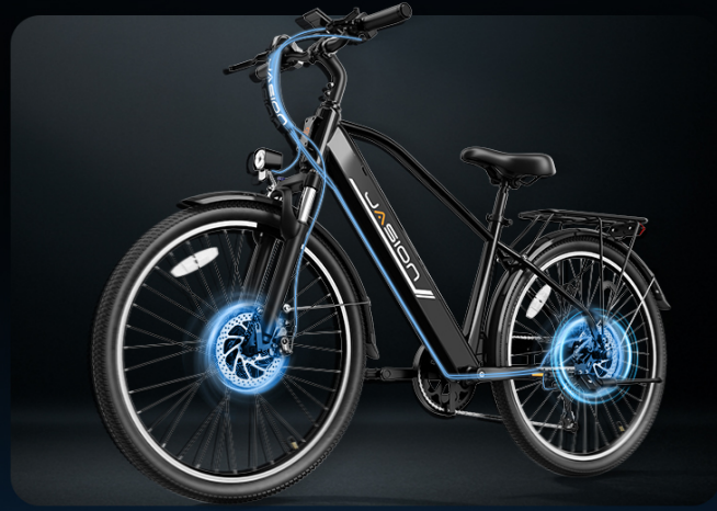
Image: The smart LCD display and handlebar controls of the Jasion Roamer/ST electric bike.