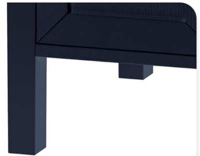
Solid Wood Legs