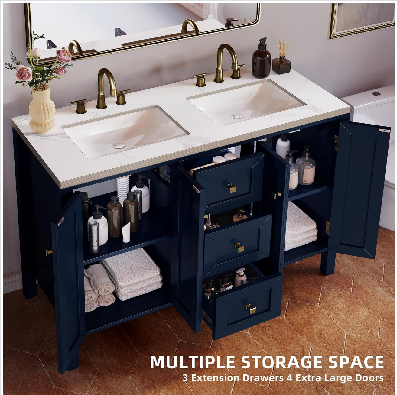
Figure 2: Multiple Storage Space. The vanity offers three extension drawers and four extra-large doors for ample storage.

Attach the cabinet doors using the soft-close hinges and screws. Install the three pull-out drawers into their respective runners. Ensure smooth operation for both doors and drawers.