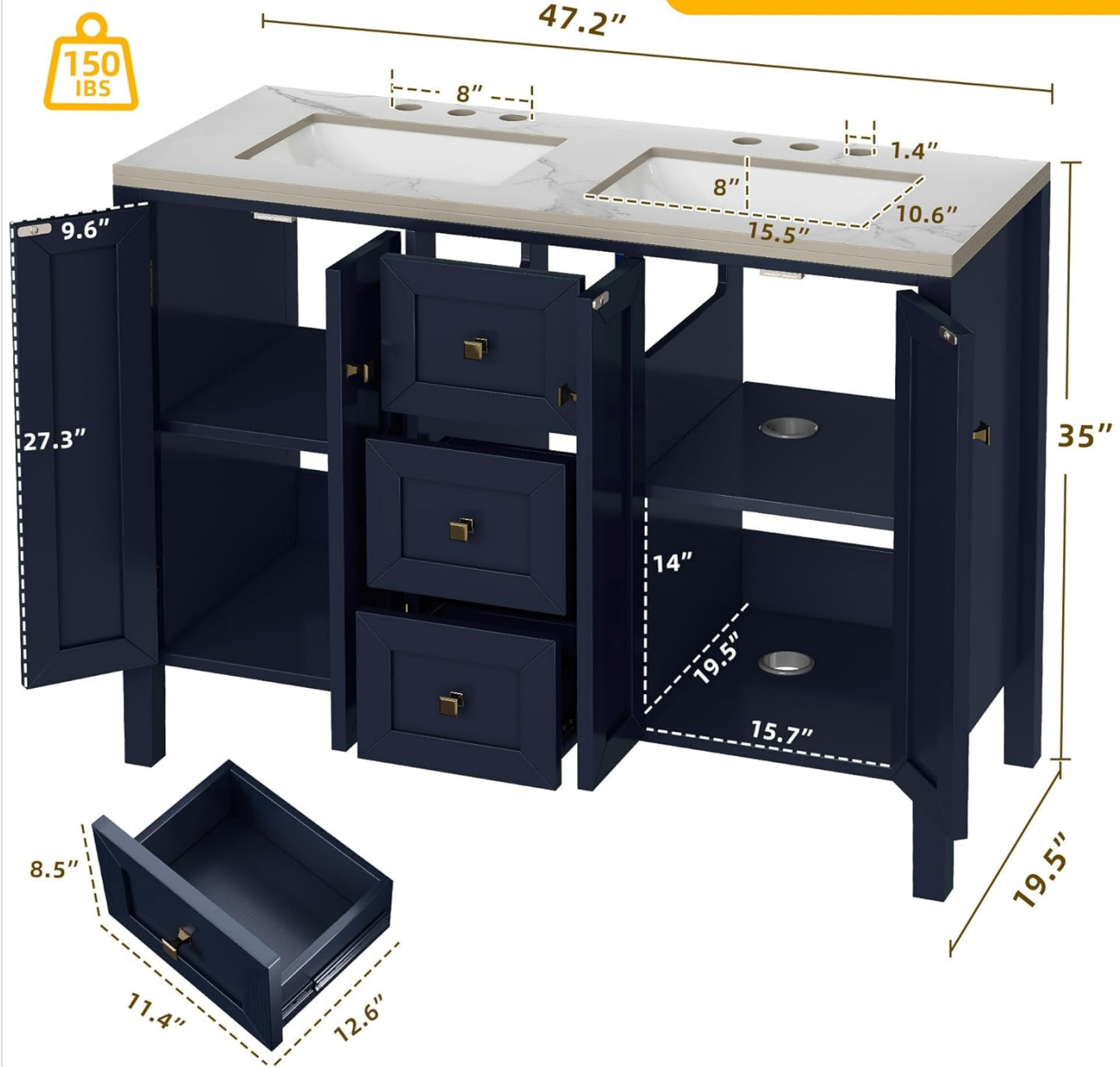
Figure 6: Product Dimensions. Detailed measurements of the vanity, including overall size and internal storage dimensions.