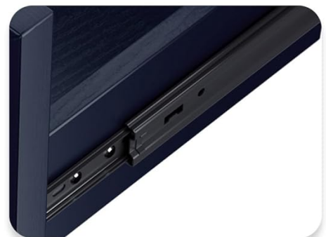
Smooth Metal Runners