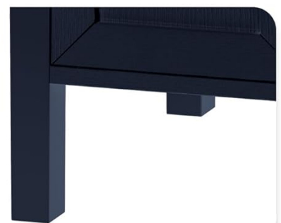
Solid Wood Legs