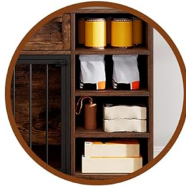
4 Open Storage Shelves