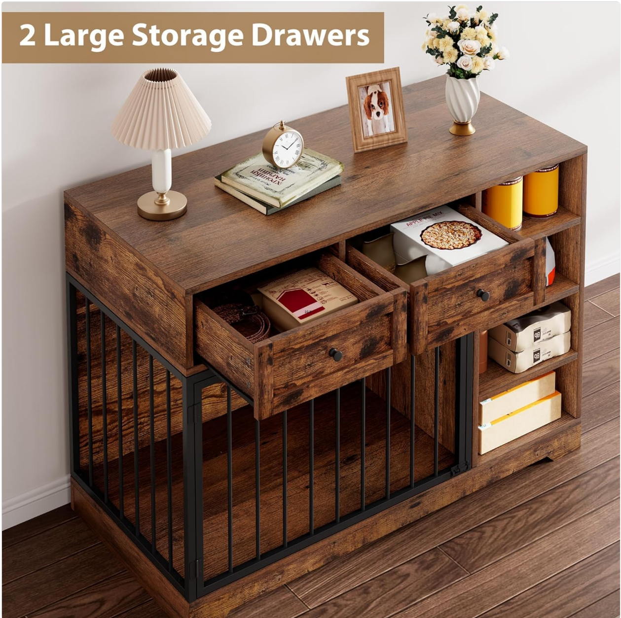
Image 4.1: View of the two large storage drawers, demonstrating their capacity for organizing various items.