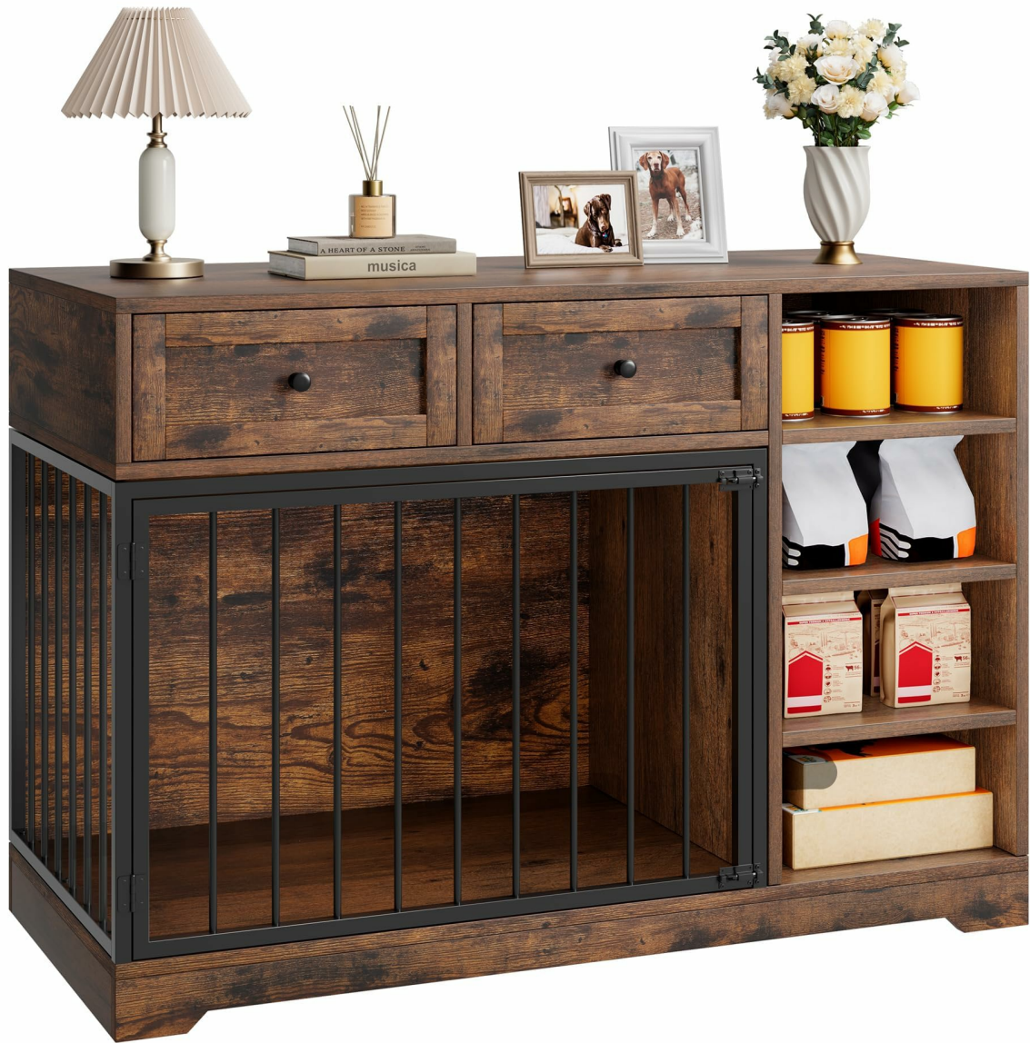
Image 1.1: Front view of the GAOMON Wooden Dog Crate Furniture, showcasing its design as a pet kennel and storage unit.