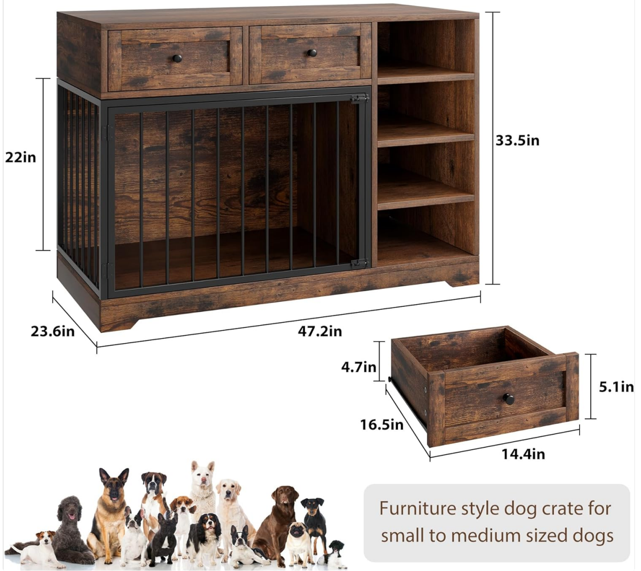
Image 3.1: Product dimensions, useful for planning placement and ensuring proper fit for your pet.