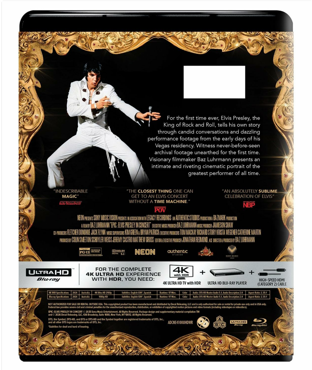
Image 2.1: Back cover of the disc set, detailing technical specifications and system requirements for playback.

Ensure your 4K UHD or Blu-ray player is correctly connected to your television or audio receiver using a high-speed HDMI cable. For 4K UHD content, use an HDMI 2.0a/b or higher cable to support HDR and higher bandwidth.