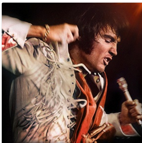
Image 4.1: Elvis Presley performing, representing the content on the disc. Proper disc care ensures continued enjoyment of such performances.

Store discs in their original cases, away from direct sunlight, extreme temperatures, and high humidity. Proper storage helps prevent warping and degradation of the disc material.