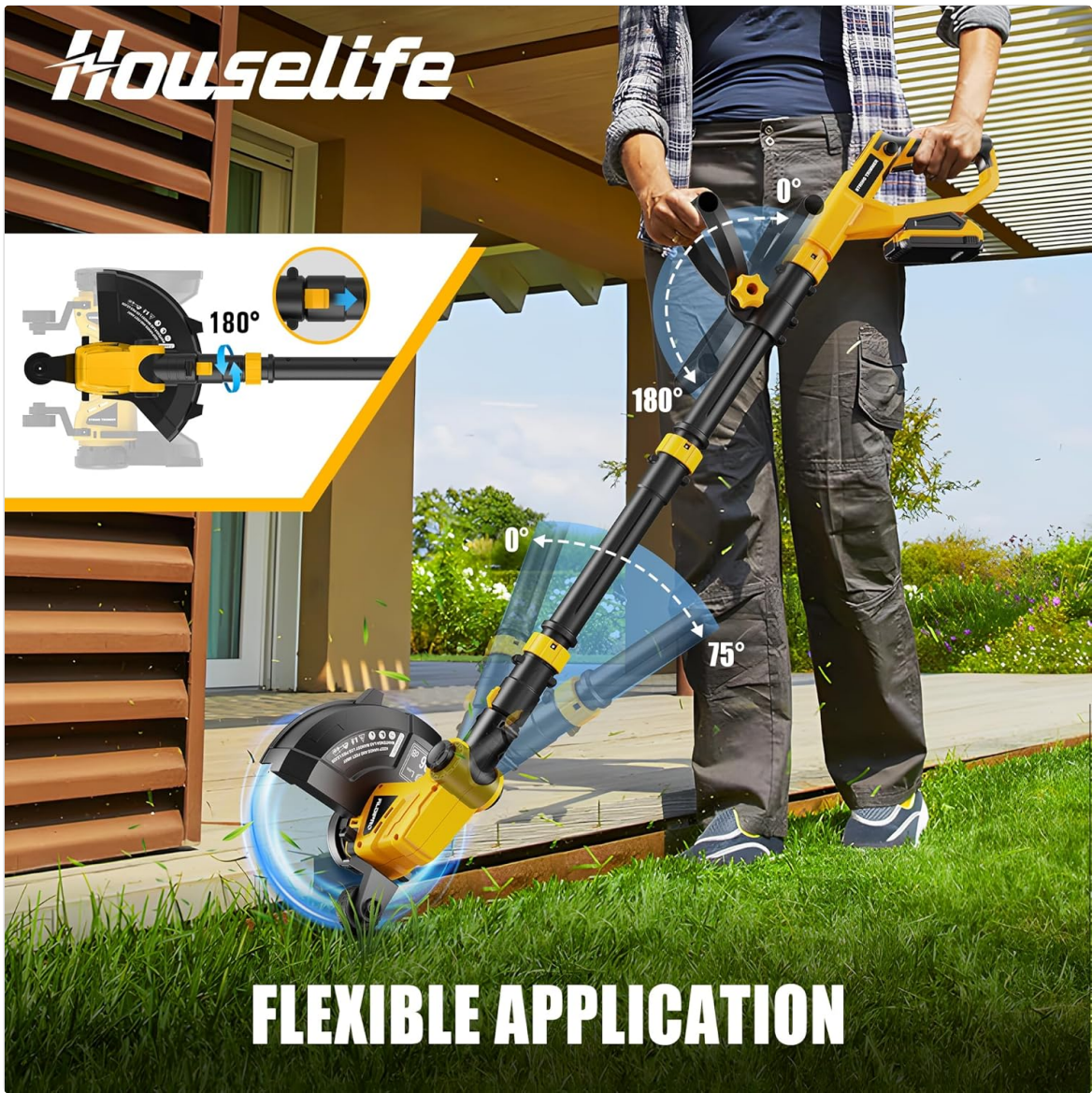
Image: Step-by-step assembly of the Houselife Cordless String Trimmer.