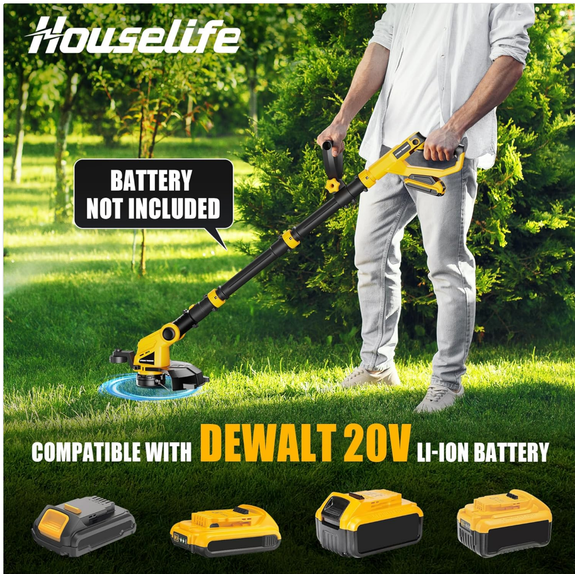
Image: The Housetlife trimmer demonstrating its 3-in-1 functionality as a trimmer, edger, and mower.

Hold the trimmer with both hands, ensuring a firm grip on the main handle and the auxiliary handle. Press the safety button and then the trigger to start the motor. Move the trimmer in a sweeping motion across the area to be trimmed, keeping the cutting line parallel to the ground.