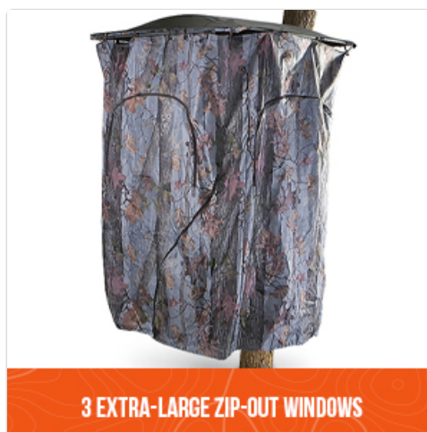
Image 3.1: The blind features three extra-large zip-out windows for versatile use.