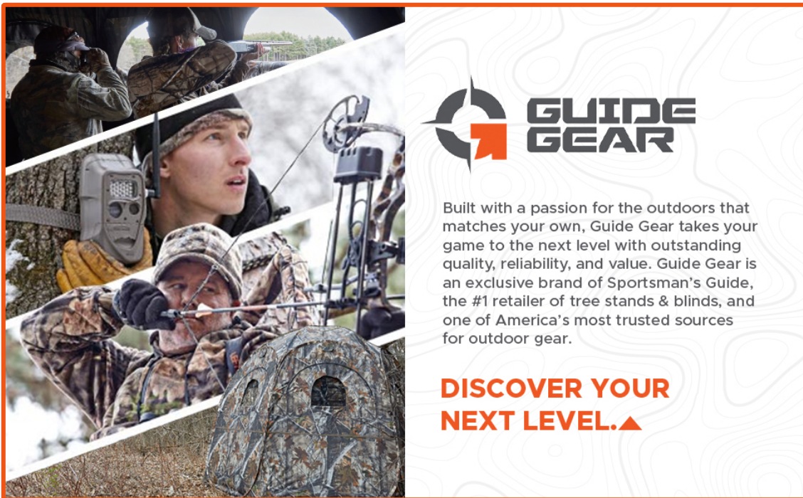
Image 2.3: The blind kit can also be used as a ground blind, secured with stakes.