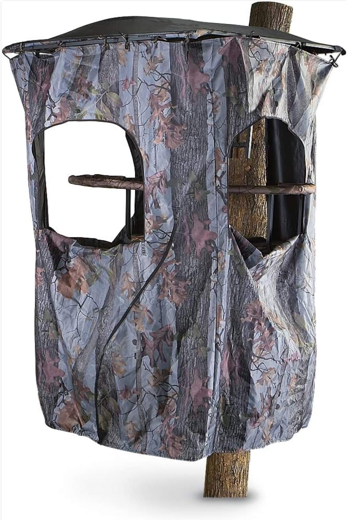
Image 1.1: The Guide Gear Universal Tree Stand Blind Kit, Model TS466, shown installed on a tree stand.