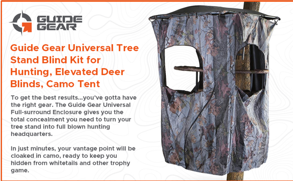
Image 2.2: The blind kit installed on a tree stand, highlighting key features like windows, entry, and tie strings.