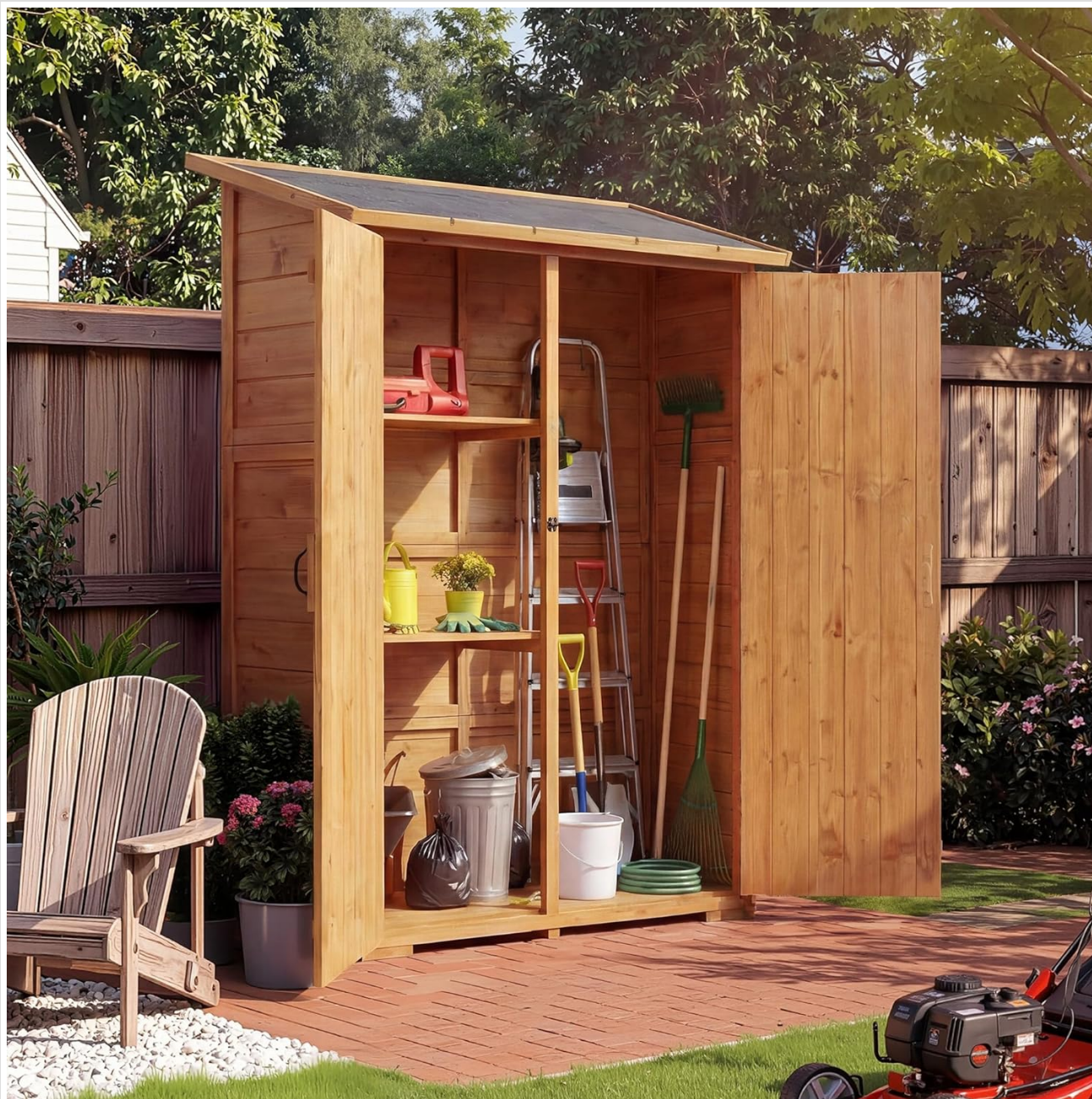
Figure 1.1: Garvee Outdoor Storage Cabinet (Model 3WM-T7L12DUGUDC7E-V-16TLRB816)