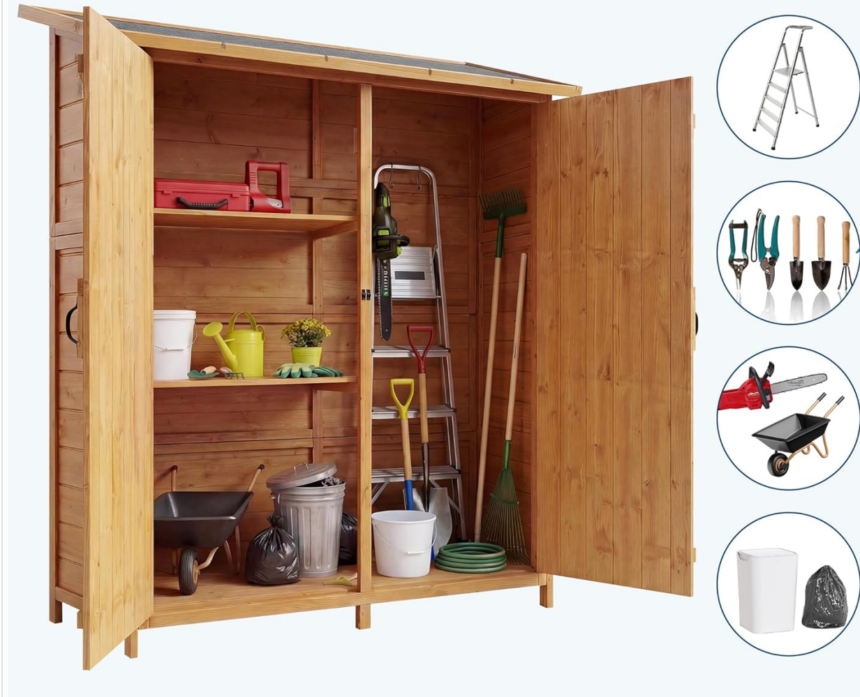
Figure 5.1: Interior Storage and Adjustable Shelves

Storage Function & Practical Scenery in the Garden