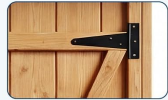
Black Metal Hinges