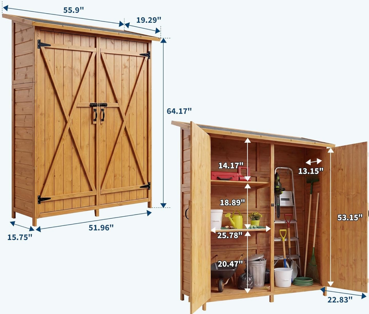
Figure 4.1: Product Dimensions for Assembly Planning