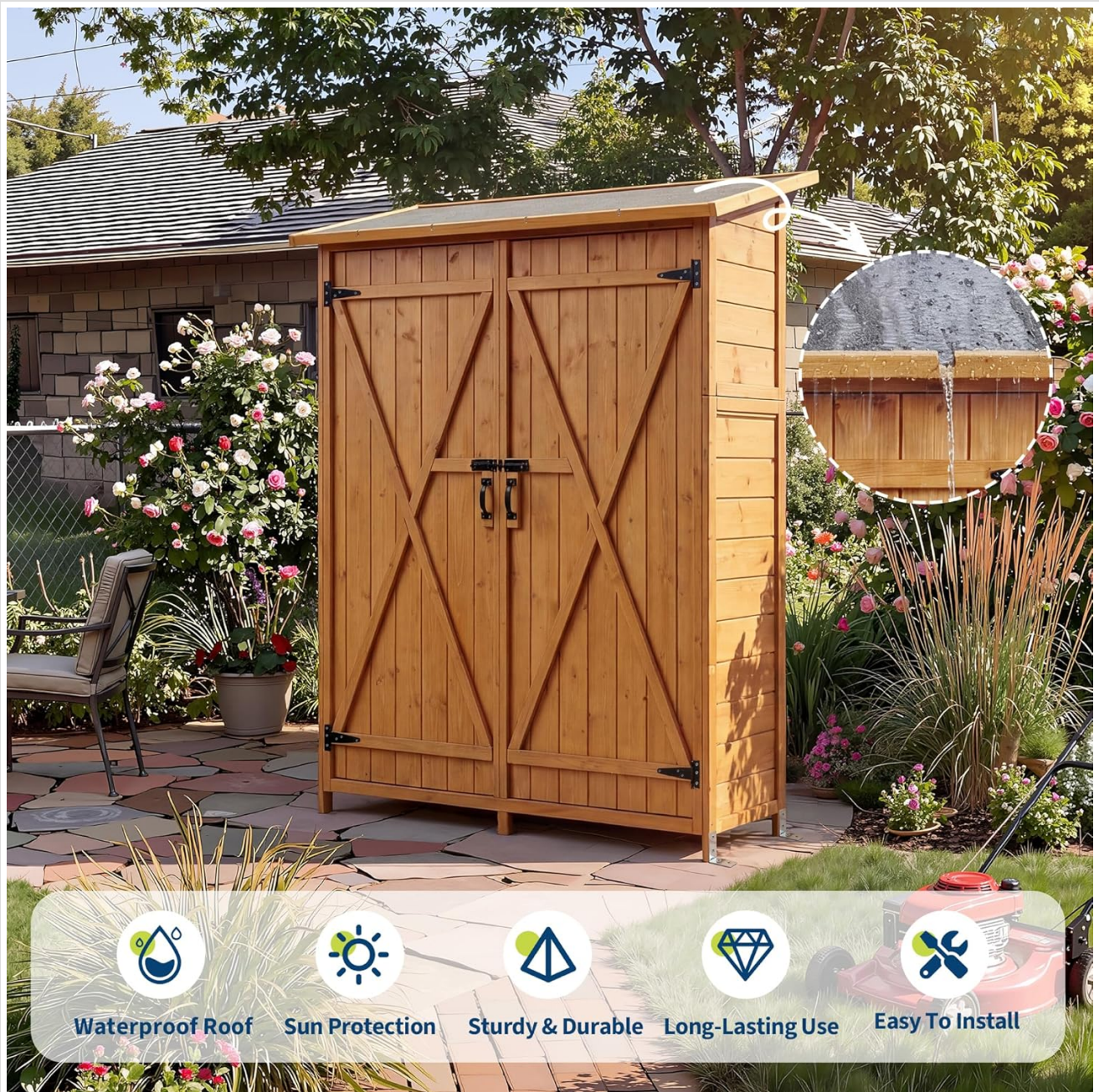
Figure 6.1: Waterproof Roof and Weather Protection