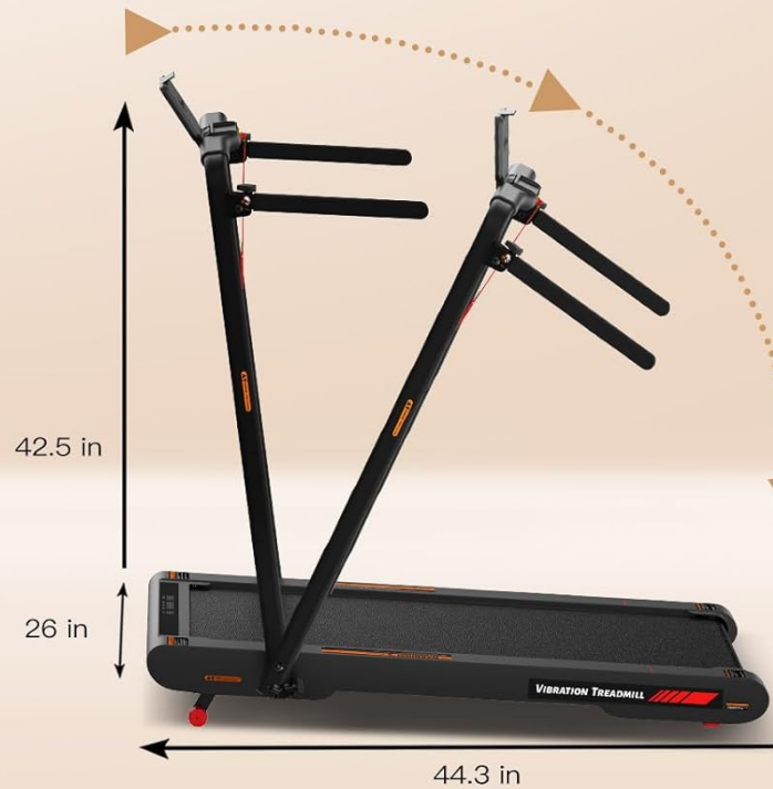
Image 8.1: The treadmill's foldable design and built-in wheels facilitate easy movement and compact storage.