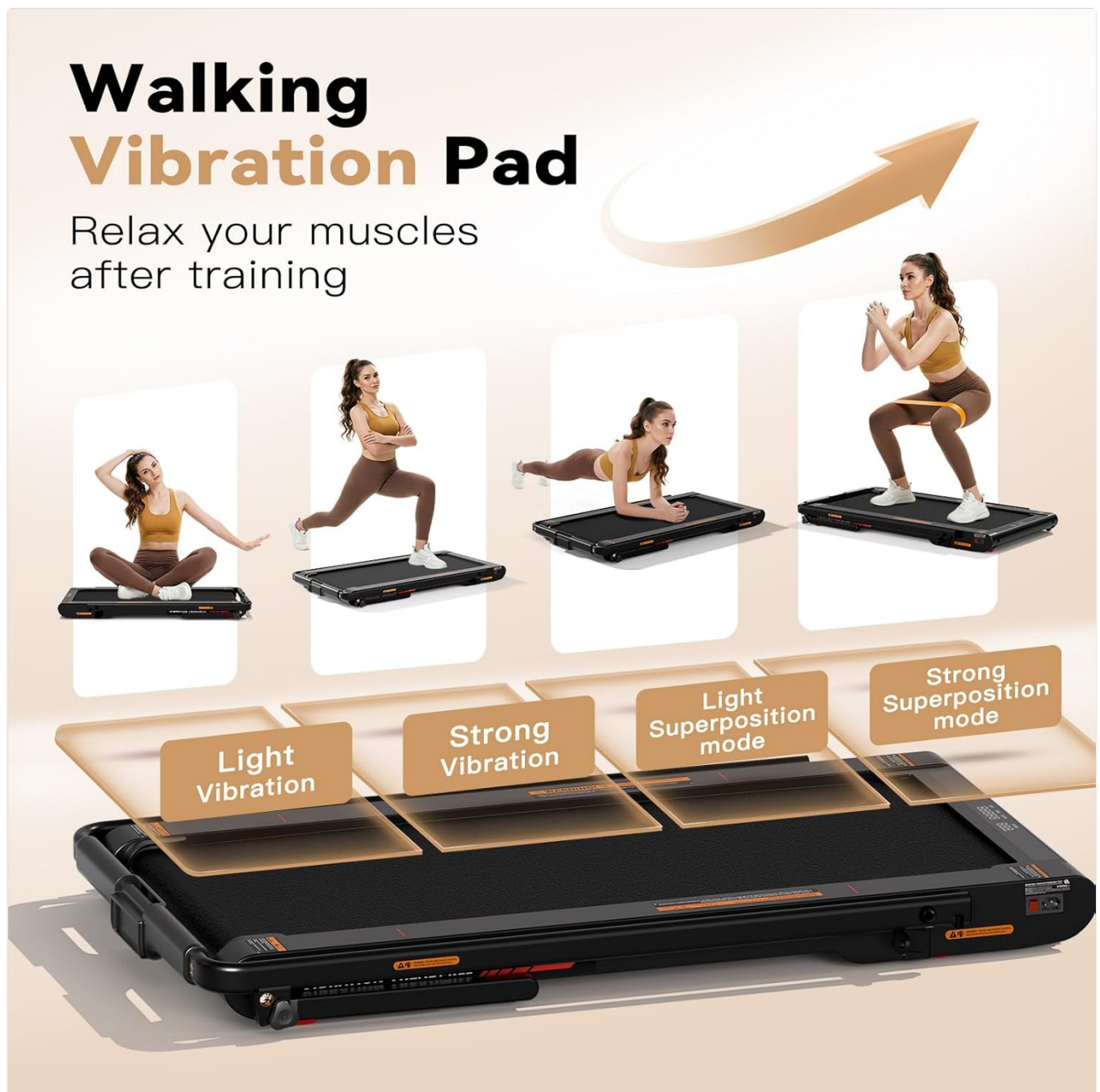
Image 6.1: Visual representation of the four distinct vibration modes available on the walking pad.

Refer to the remote control or app for specific instructions on activating and switching between vibration modes.