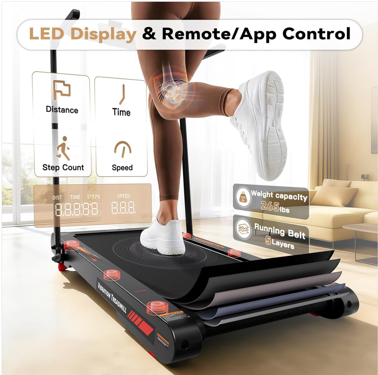
Image 5.1: The LED display shows time, distance, steps, and speed. The remote control allows for easy adjustments.