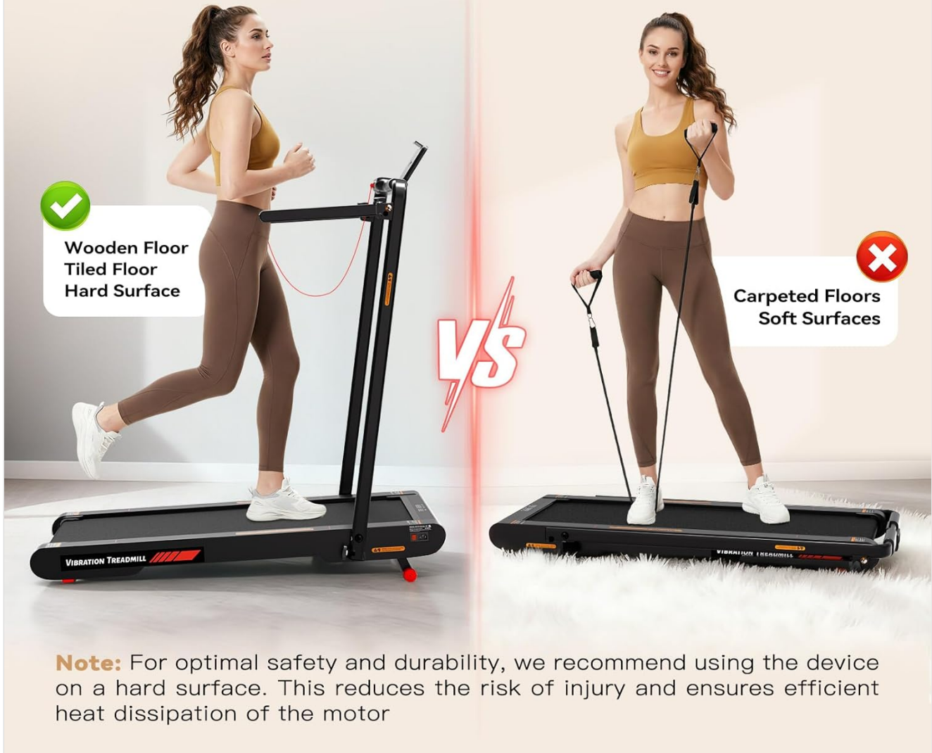
Image 2.1: Recommended usage on hard surfaces for optimal safety and motor performance.

Effective Fat Burning Is Also Possible at Home!