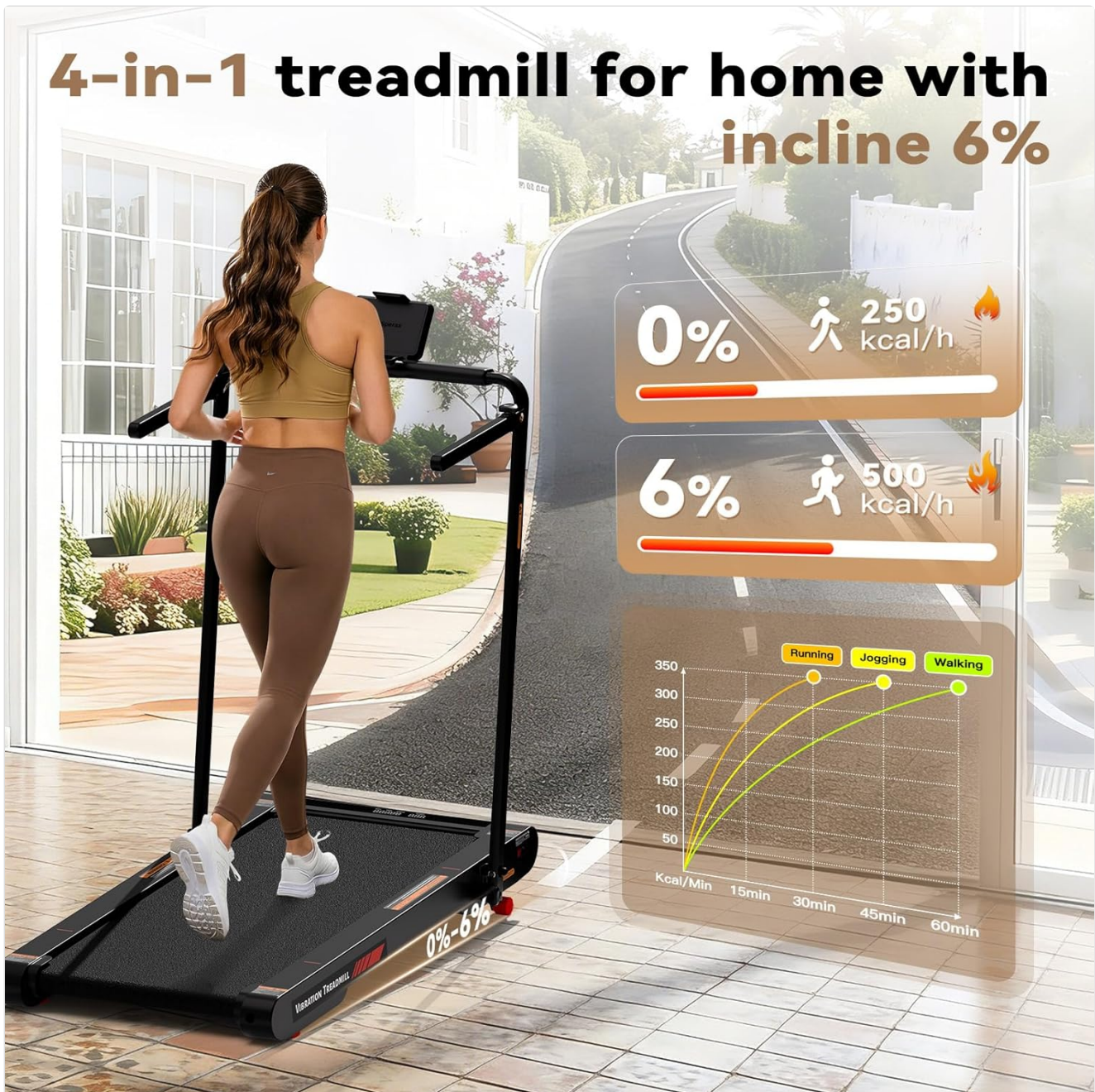
Image 4.1: Illustration of the treadmill with handrails in the upright position, ready for use.

Video 4.1: Demonstrates the setup and folding process of the Lysole treadmill, including securing the handrails.