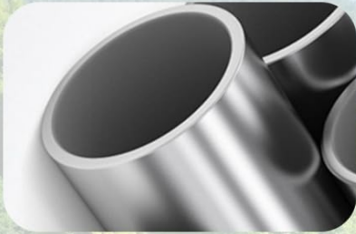
Φ1" Galvanized Iron Pipe