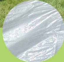
PE&UV Coated Cover