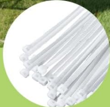
Detachable ZiP TiEs