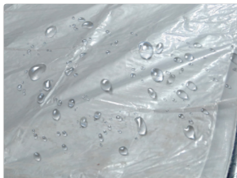
Image: A close-up view of water droplets on the PE&UV coated cover, demonstrating its waterproof properties.