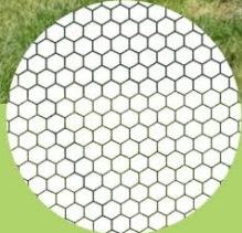
WiRe Fencing Mesh