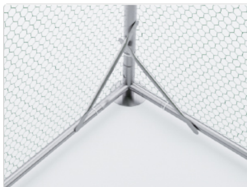
Image: Close-up view of the reinforced corner connections, highlighting the sturdy construction of the coop frame.