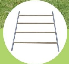
Chicken Roosting Ladder

Image: A visual representation of the complete accessory kit, including bungee balls, wire fencing mesh, detachable zip ties, PE&UV coated cover, and a chicken roosting ladder.