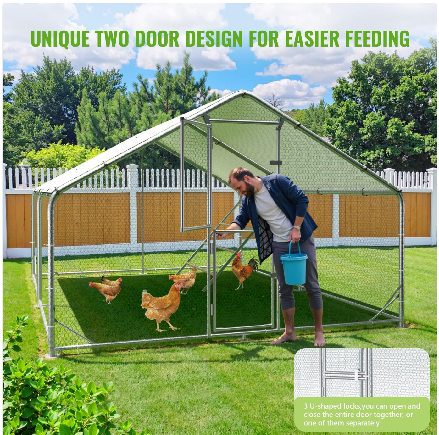
Image: A person demonstrating the unique two-door design, highlighting the 3 U-shaped locks that allow for split or full door opening for easier feeding and access.