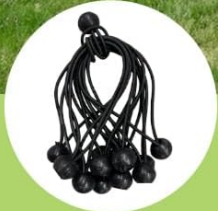
Ball Bungee Cords