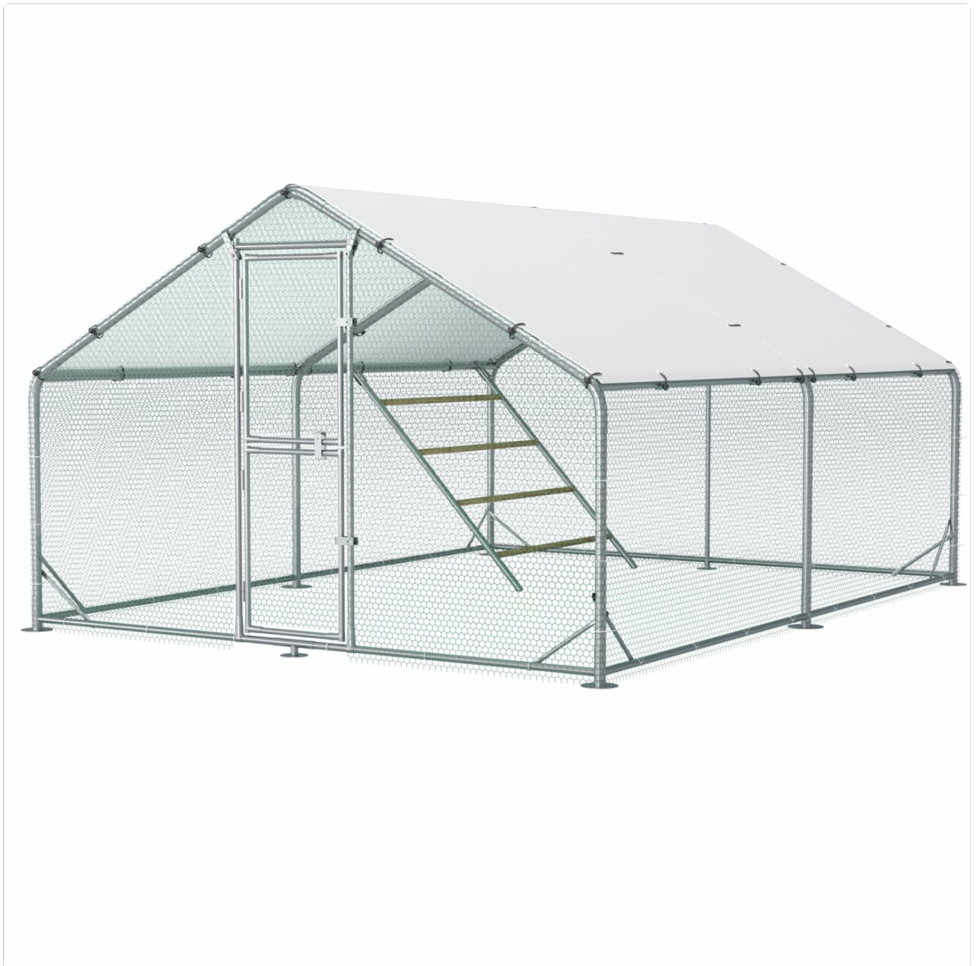
Image: The Benass Large Metal Chicken Coop, 10x13FT, fully assembled in an outdoor setting.