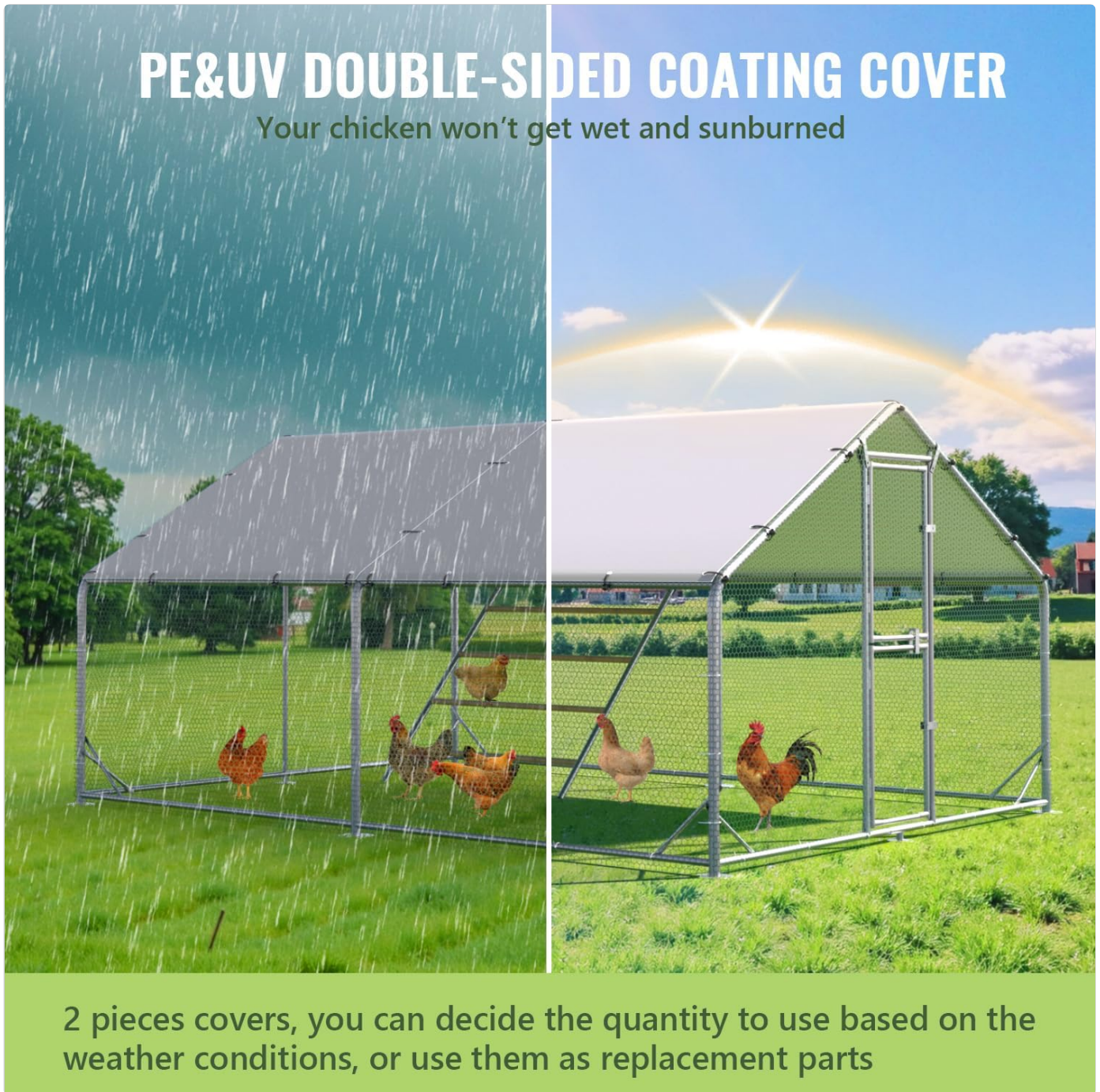
Image: The PE&UV double-sided coating cover effectively shielding chickens from both rain and direct sunlight, preventing them from getting wet or sunburned.