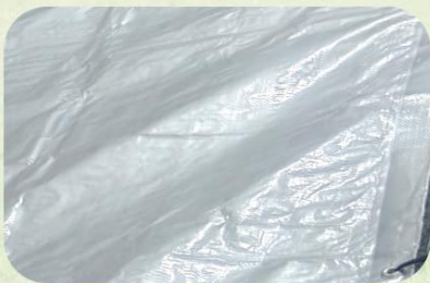
120g PE&UV Coated Cloth