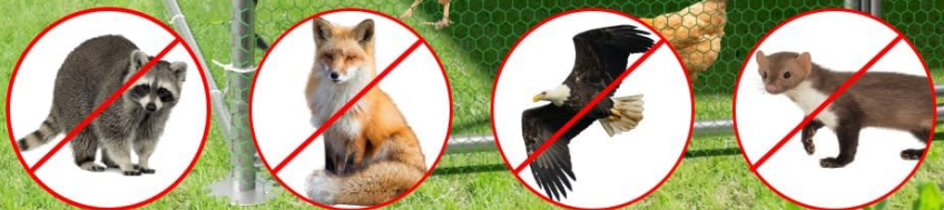
Image: Illustration of the coop's robust construction, including galvanized iron pipe, 3-layer strong steel wire gauze, and 120g PE&UV coated cloth, designed to keep poultry safe from predators.