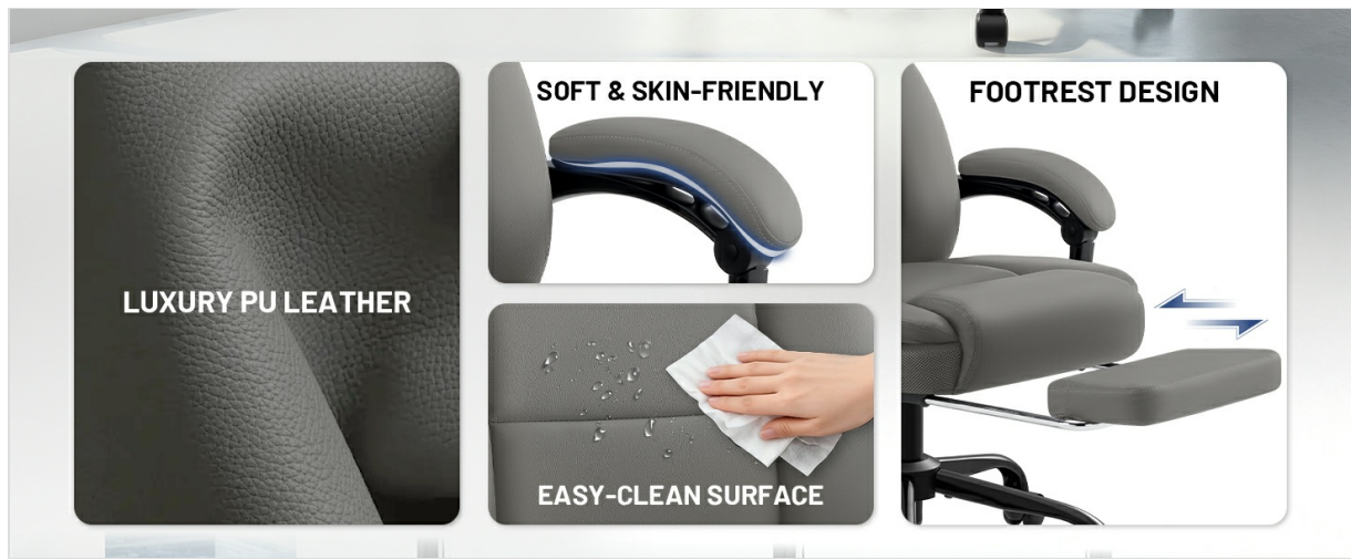
Figure 5: PU Leather Material and Cleaning Example