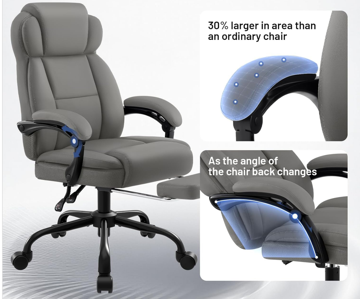
Figure 3: Linkage Armrest Mechanism

Bearings are used instead of screws at the rotating parts and will not loosen, increase the area of the armrest to fit your arm better