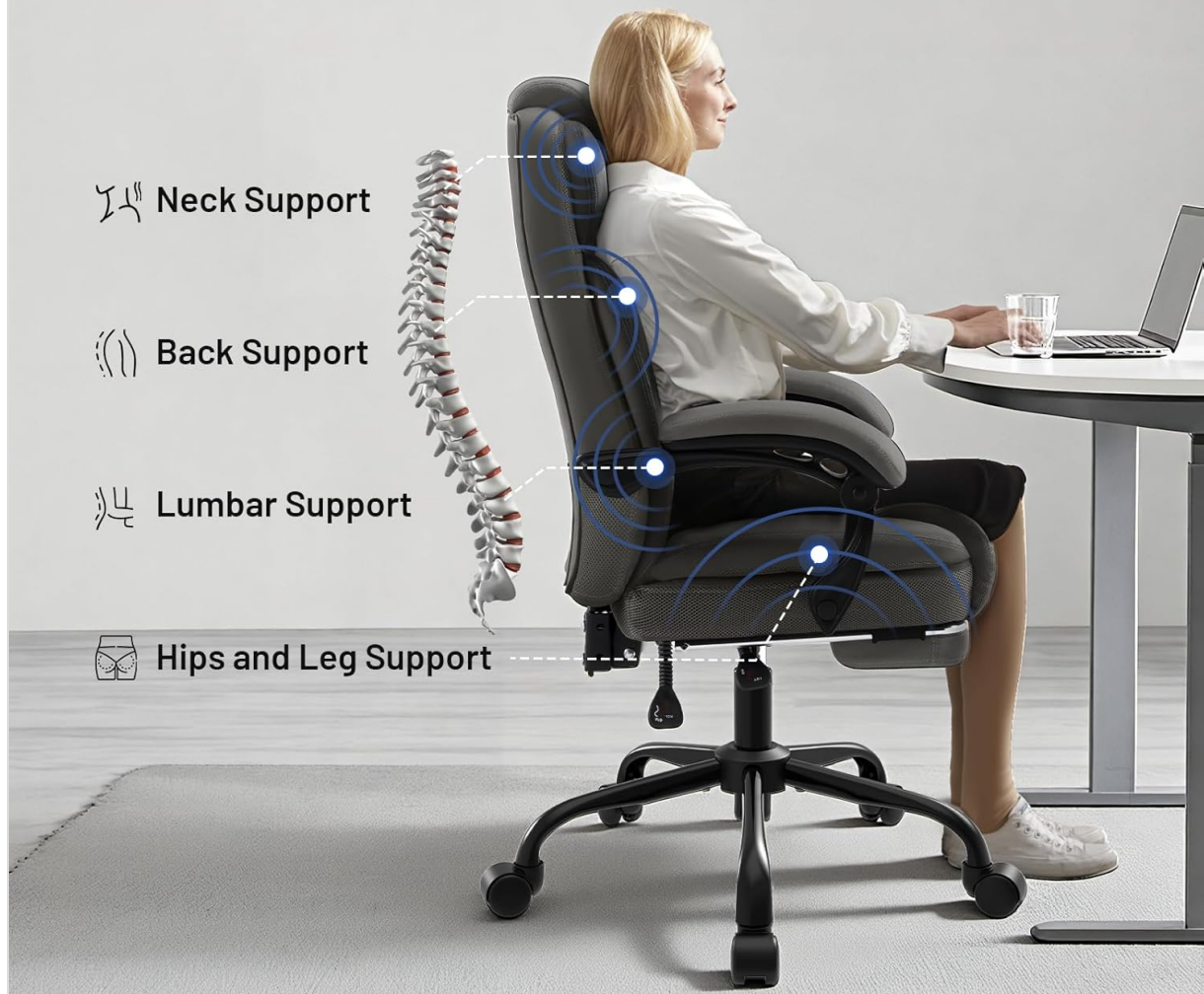
Figure 4: Ergonomic Support Zones

Ergonomic principle effective relief of spinal pressure