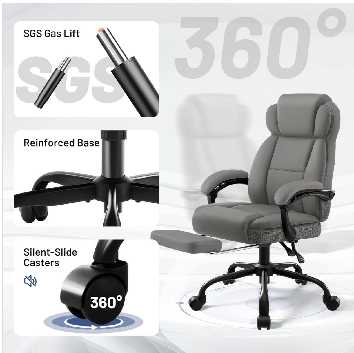
Figure 7: Key Components: Gas Lift, Base, Casters