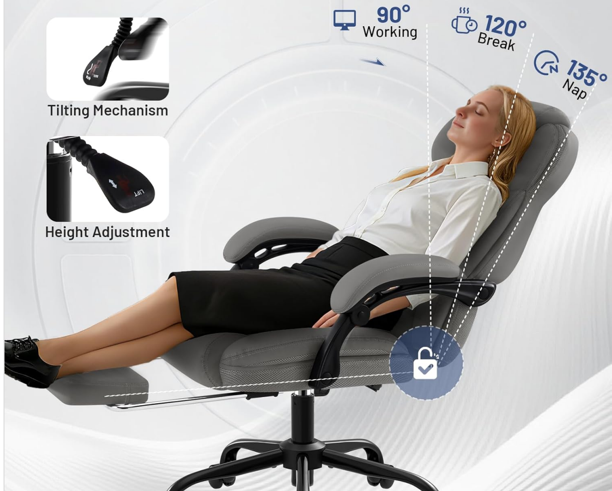
Figure 2: Recline and Height Adjustment Levers