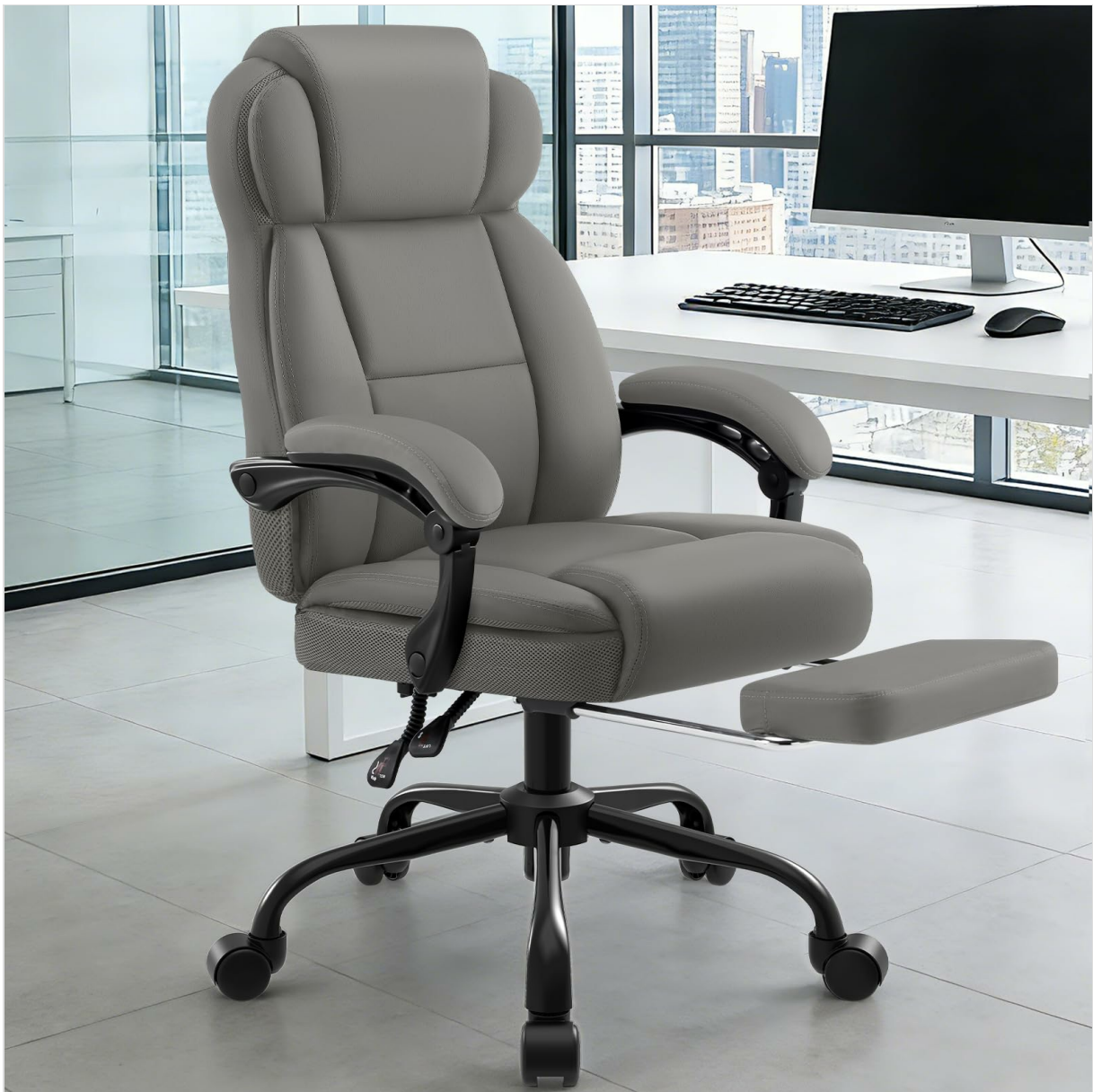
Figure 1: AreShark Ergonomic Office Chair with Footrest (Grey)