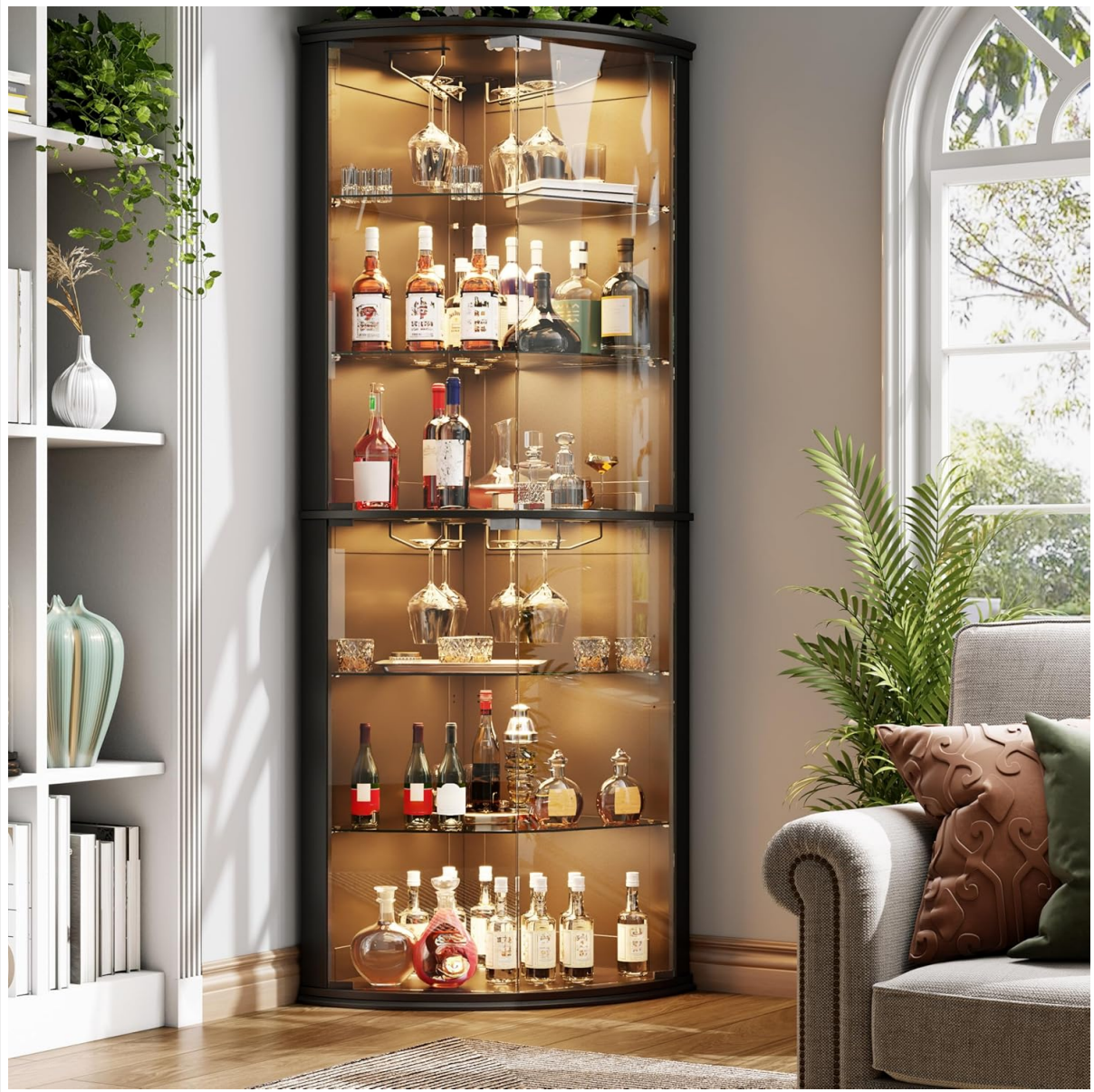
Figure 2.2: Assembled Loomie Corner Bar Cabinet. This image displays the cabinet fully assembled and stocked with various items, highlighting its aesthetic and functional design.