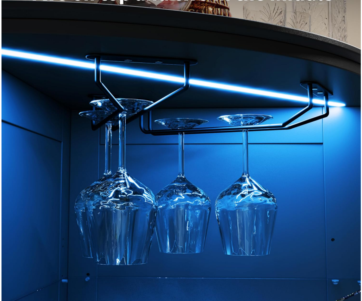
Figure 4.2: Wine Glass Holders. This image shows the two rows of wine glass holders, designed for organized storage of stemware.