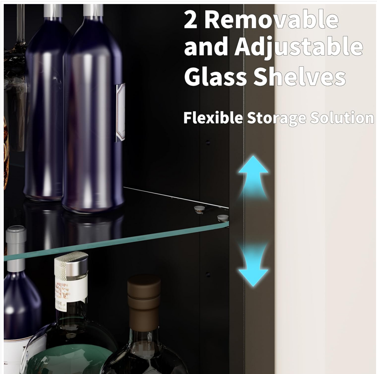
Figure 4.1: Adjustable Glass Shelves. This image highlights the flexibility of the two removable and adjustable glass shelves, allowing customization of storage space.