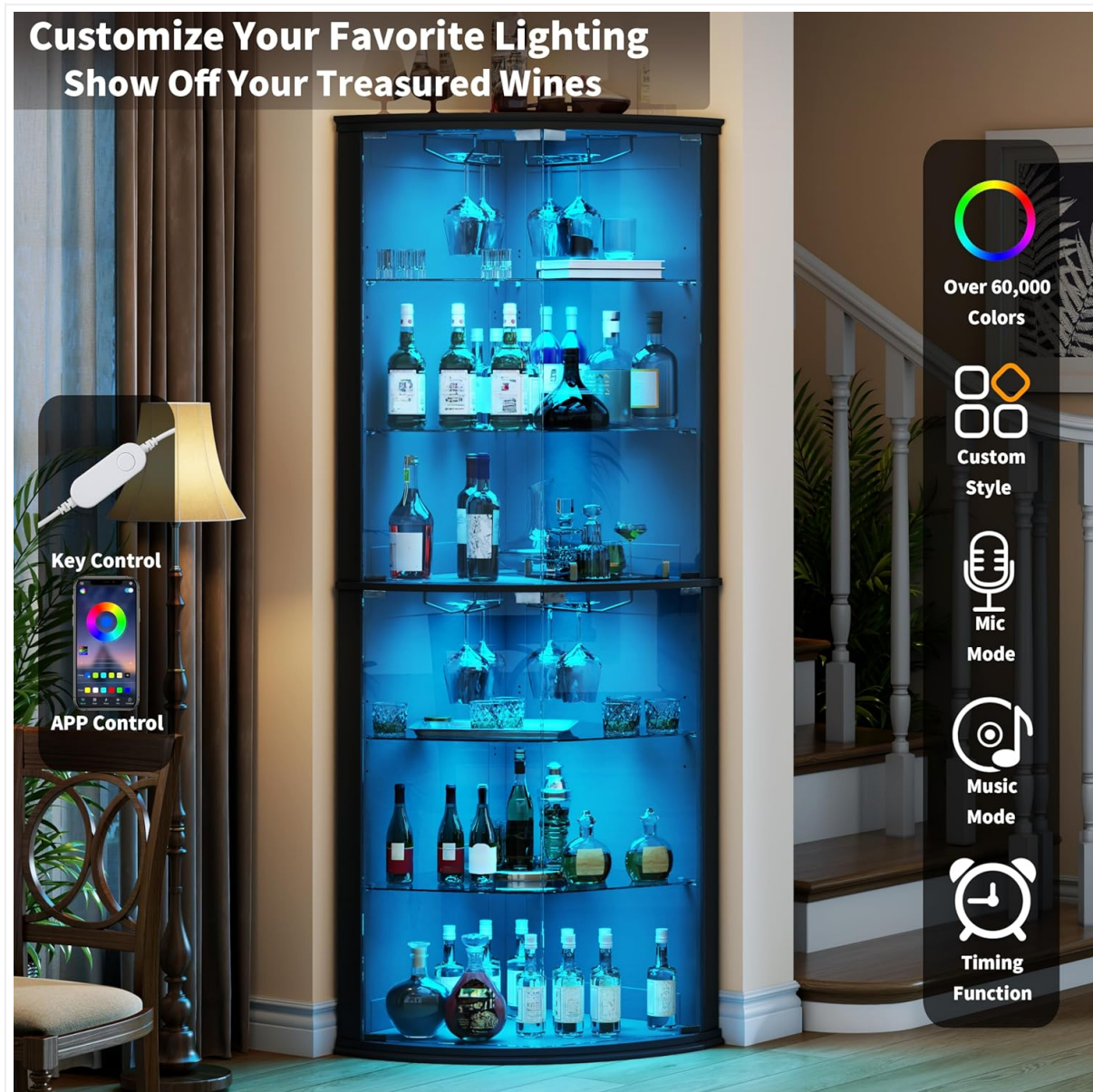
Figure 5.1: LED Light Control Options. This image illustrates the key control and app control methods for the LED lighting, along with icons representing various functions like color selection, custom styles, and music mode.