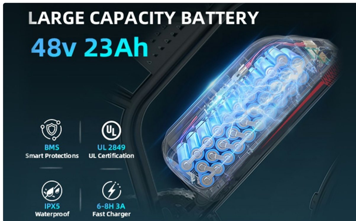
Image: Illustration of the 48V 23Ah battery, highlighting its large capacity, BMS protections, UL 2849 certification, IPX5 waterproof rating, 6-8 hour 3A fast charging, and lockable design.

allowing for secure indoor or outdoor charging.