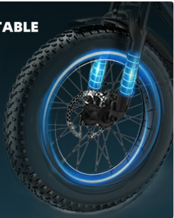
Image: Close-up of the 20x4 inch fat tire, suitable for snow, beach, mountain, and gravel roads, emphasizing its anti-slip and puncture-resistant qualities.