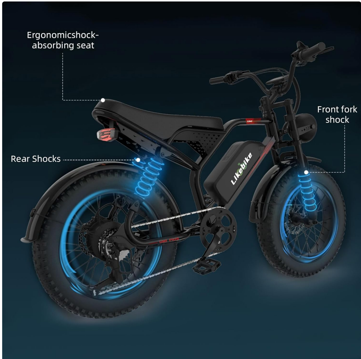
Image: A composite image highlighting the taillight, retro headlight, hydraulic dual brakes, and professional suspension fork.