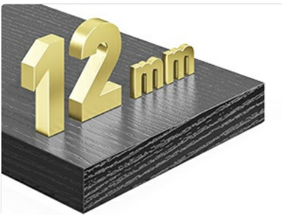
Desktop thickness of 12mm for durability.