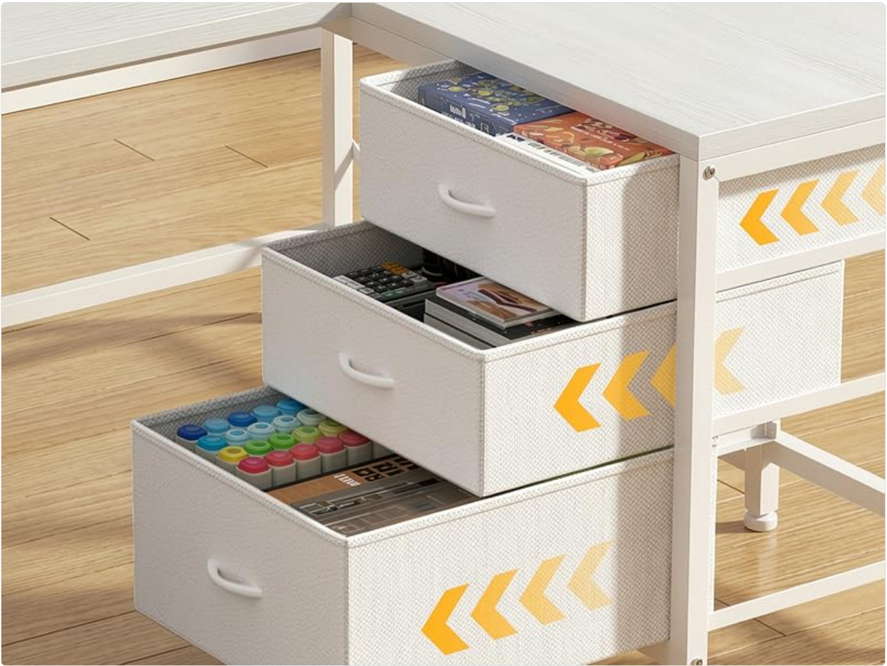
The six fabric drawers provide ample storage space for various items.