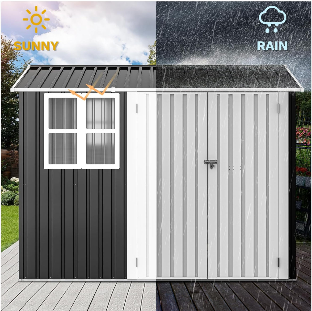
Image 4.1: Visual representation of the shed's weather resistance, showing its performance in both sunny and rainy conditions.