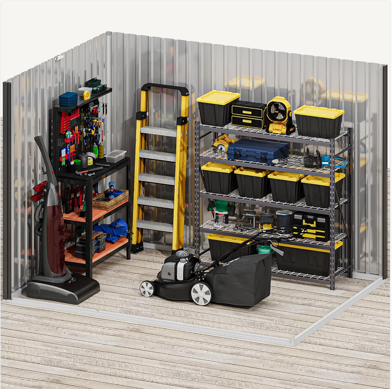
Image 2.1: An interior view of the shed, illustrating its potential for organized storage of garden tools, lawnmowers, and other equipment.