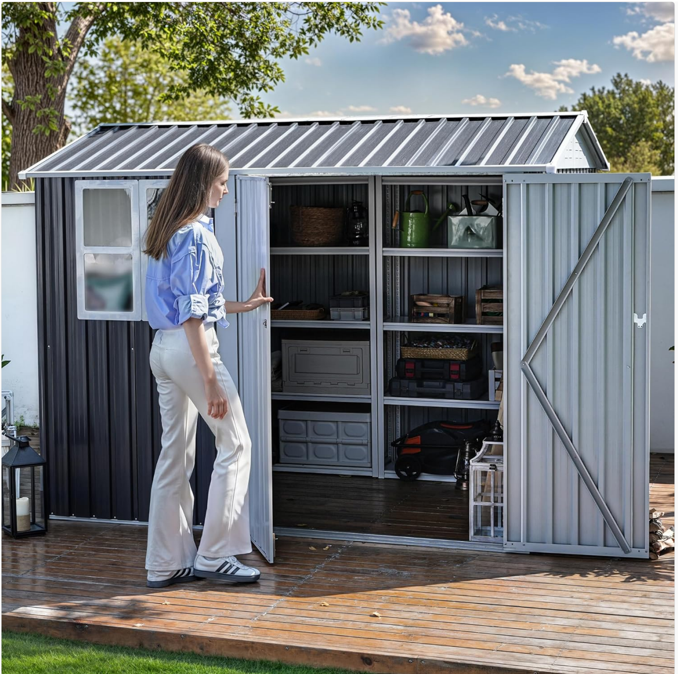
Image 3.1: A user demonstrating the opening of the shed's double doors, revealing the interior storage space.