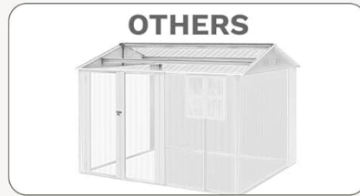
Lack of Pillars Leads to Structural Weakness