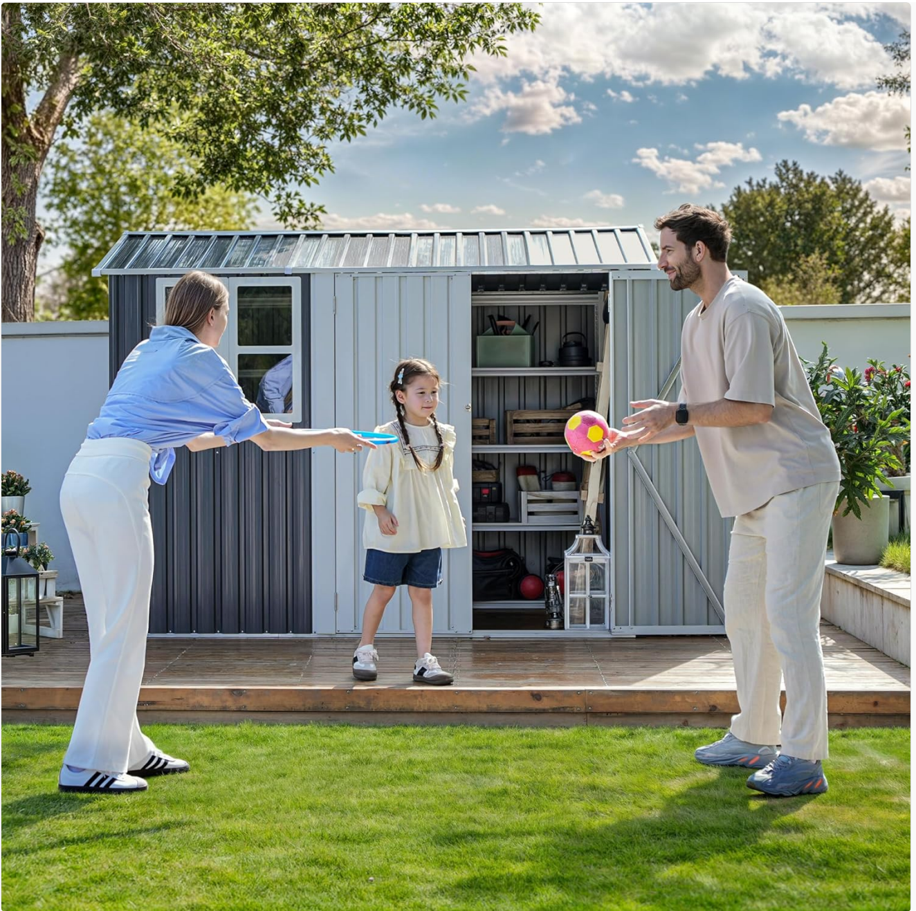
Image 1.1: The DWVO 8' x 6' Outdoor Storage Shed in a typical backyard environment, demonstrating its integration into a home setting.