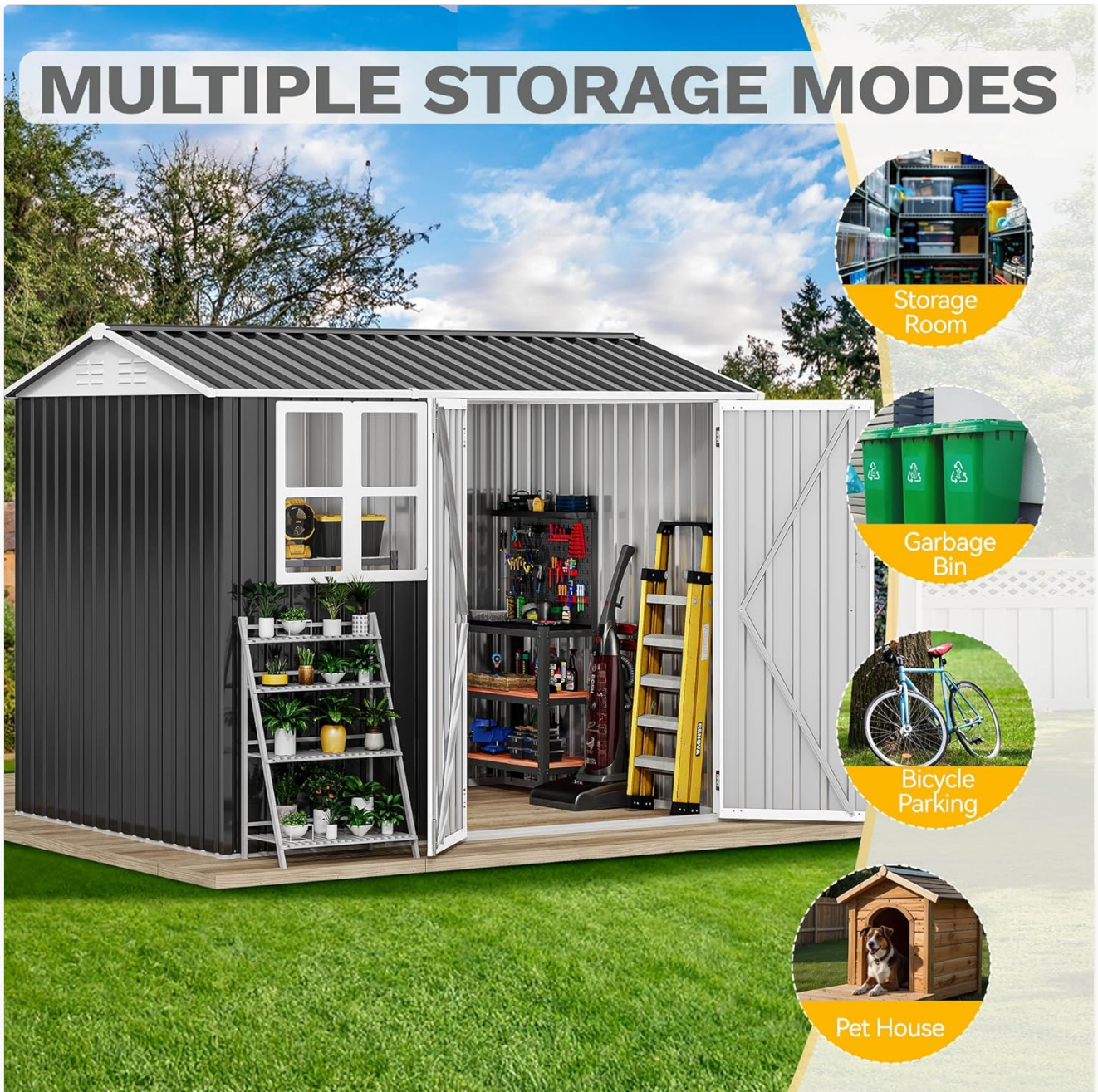
Image 1.2: Illustration of the shed's versatility, showcasing its use for general storage, garbage bins, bicycle parking, and as a pet house.