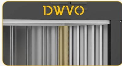
4-Pillar Support for Superior Strength