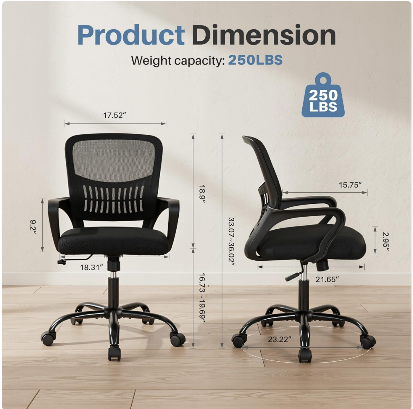
Front view of the DUMOS office chair, illustrating the main components.