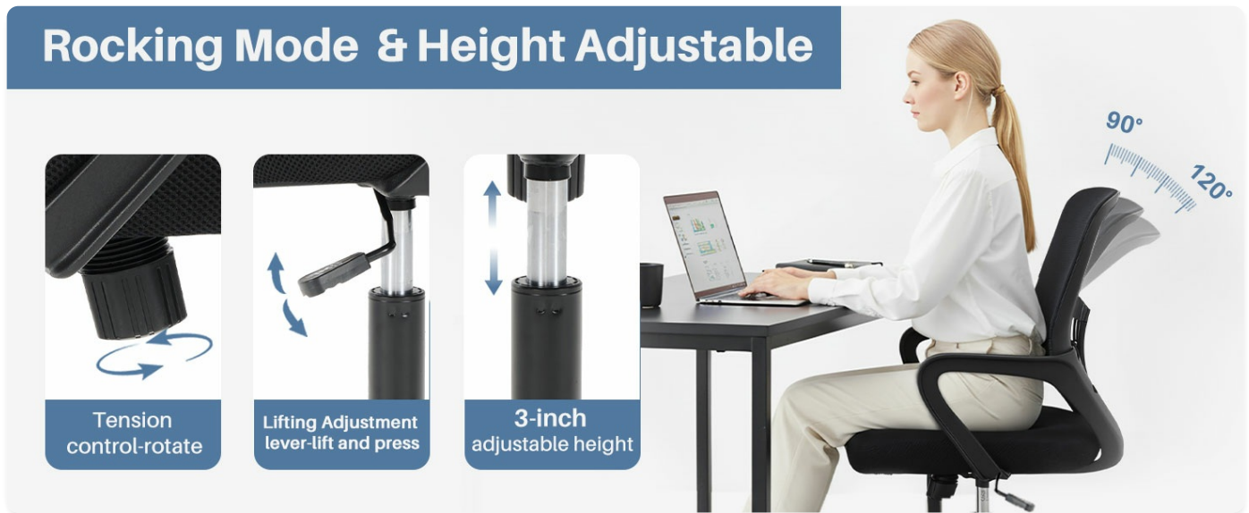
The lever for height adjustment and the rocking mechanism.

To adjust the chair height, lift the lever located on the right side of the seat. To raise the chair, lift the lever while taking your weight off the seat. To lower the chair, lift the lever while remaining seated. Release the lever at your desired height.