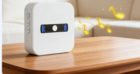
Image: The portable receiver displaying its compact design, showing the 5-level volume adjustment from 0dB to 120dB, and the option to select from 20 types of chime sounds.