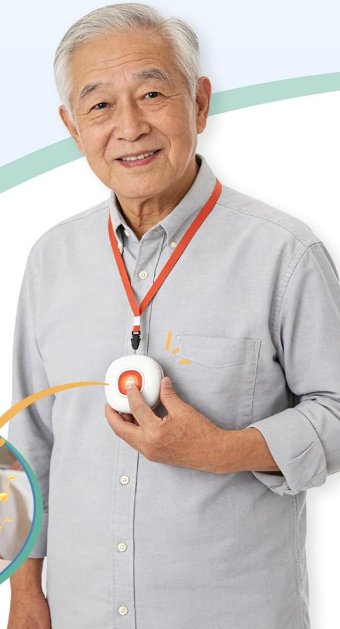
Image: Key features of the DAYTECH Wireless Call Bell, including portability, IP55 waterproof rating, low battery notification, 150m communication range, and expansion capability.