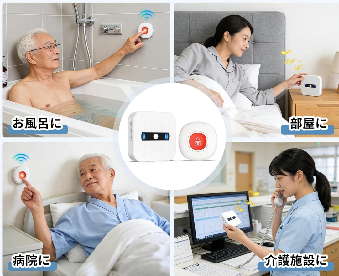
Image: Illustrations of the call bell being used in various locations such as a bathroom, bedroom, hospital, and care facility, highlighting its versatility.