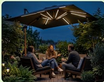
Image: Product components of the VONROC GP855AA LED Parasol Light.

La luce bianca calda crea un'atmosfera accogliente.