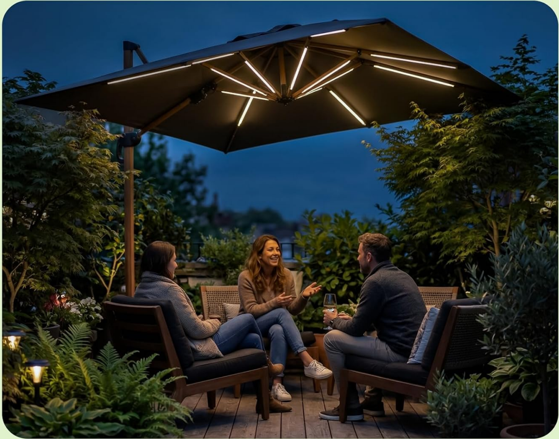
Image: Warm white light creates a welcoming atmosphere.

Lumière blanche chaude crée une atmosphère chaleureuse.