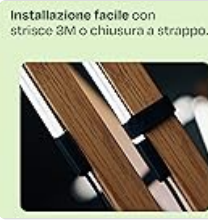
Image: Easy installation with 3M adhesive strips or hook-and-loop fasteners.